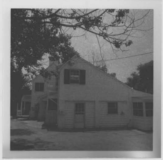
View of side from northwest showing c. 1939 wing with main house in the background.