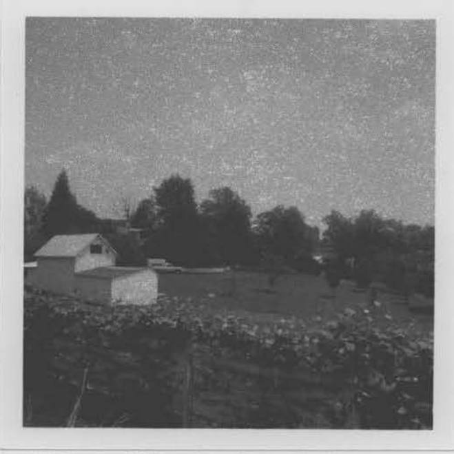
Gittings HaHa in the distance left, and part of its grounds, and the Antique House Property in the distance right.