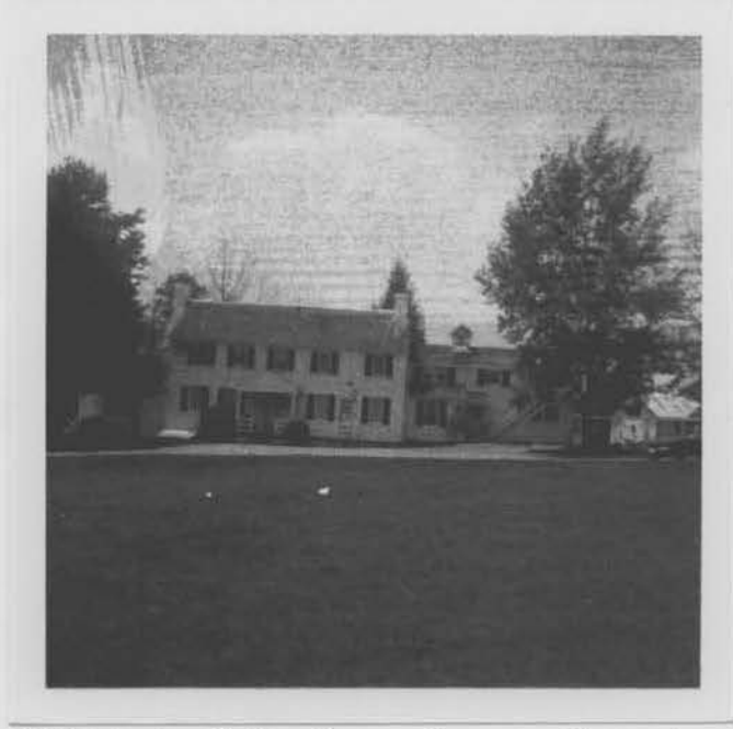
Gittings HaHa from the northeast looking at the front. Wings c. 1939 are to left and right of older middle section.