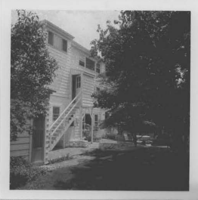
Gittings HaHa showing rear with third story added under the roof. View from west southwest.