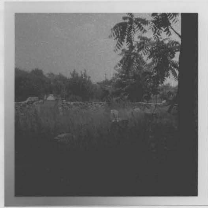
Brown family cemetery behind Gittings HaHa