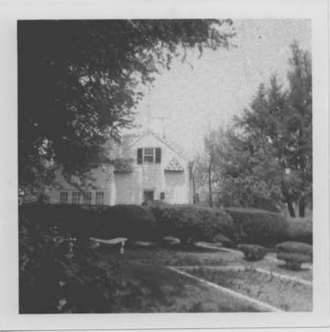
View of side and part of gardens from the southeast. New wing c. 1939, is at left, main house at right.