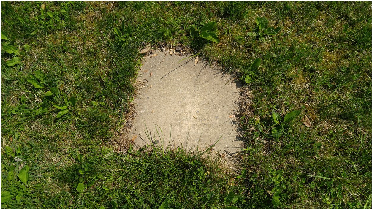
7. Grave marker fragments