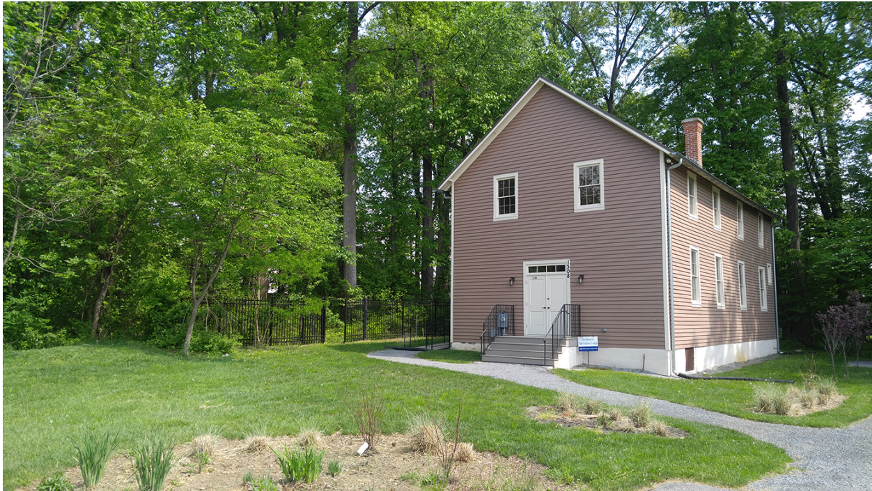
8. Historic Odd Fellows Lodge behind church, facing south