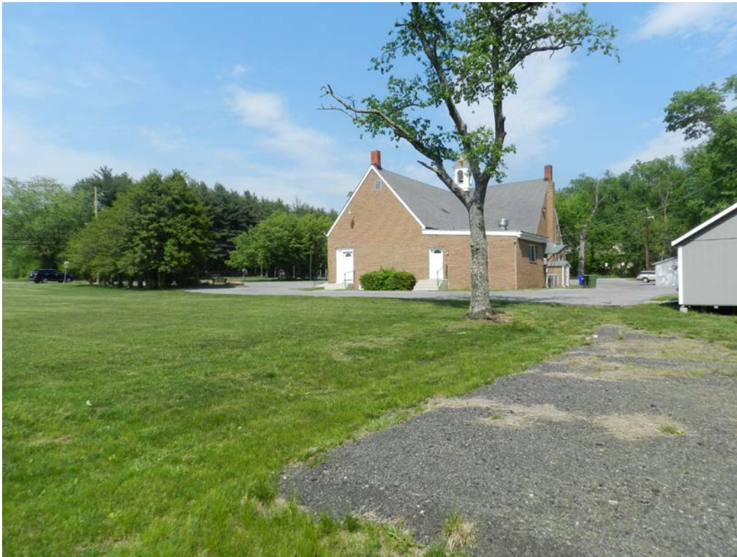
3. Possible cemetery field, facing east