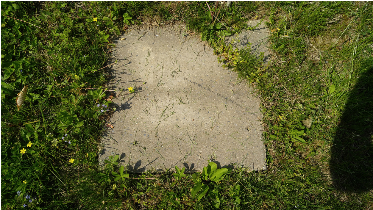
5. Grave marker fragments