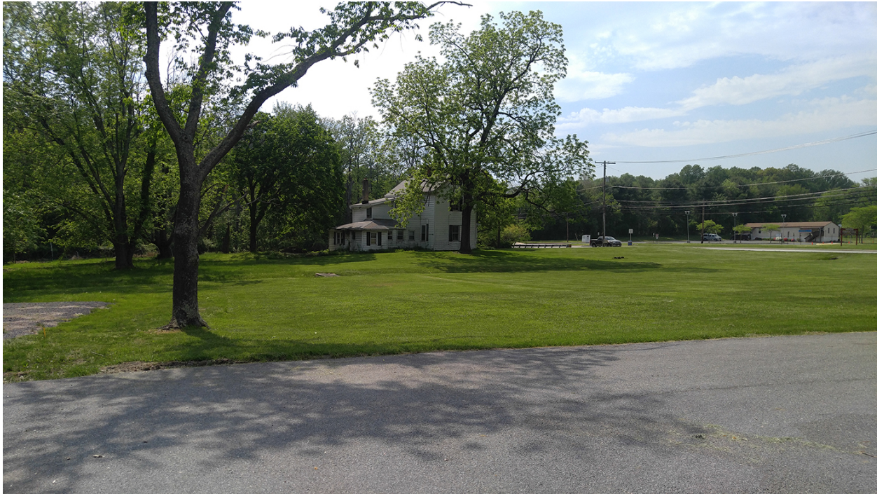
2. Possible cemetery field, facing west