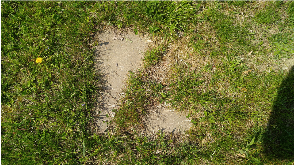
6. Grave marker fragments