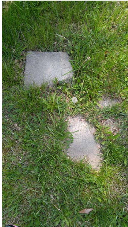
4. Grave marker fragments