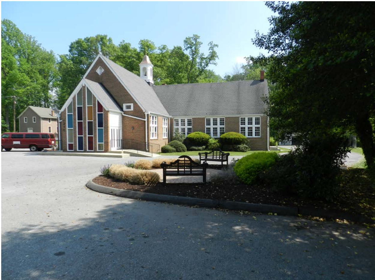
1. Approach to church from Olney Sandy Spring Road, facing south