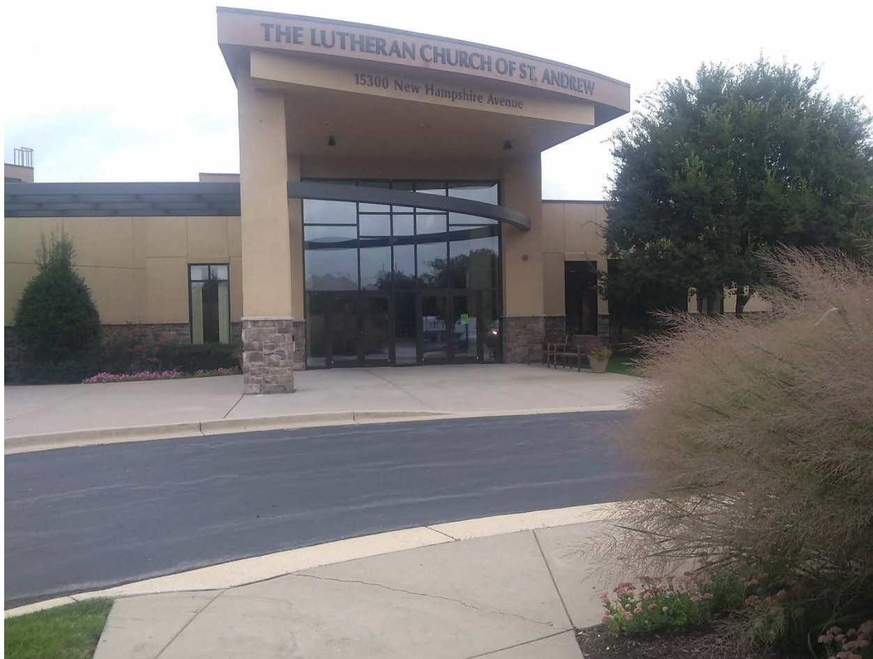
1. Approach to church from New Hampshire Ave., facing west