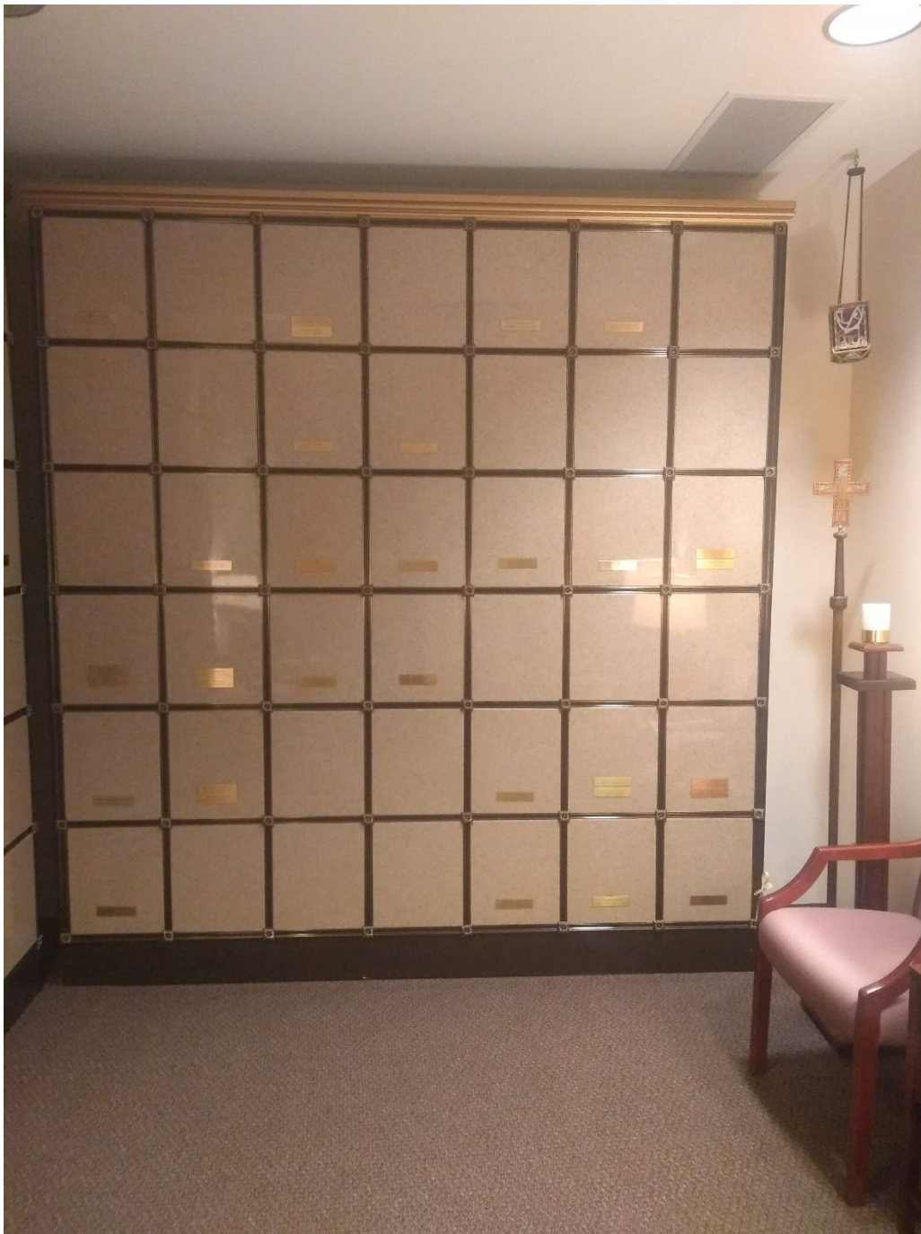
3. Right-hand wall of columbarium