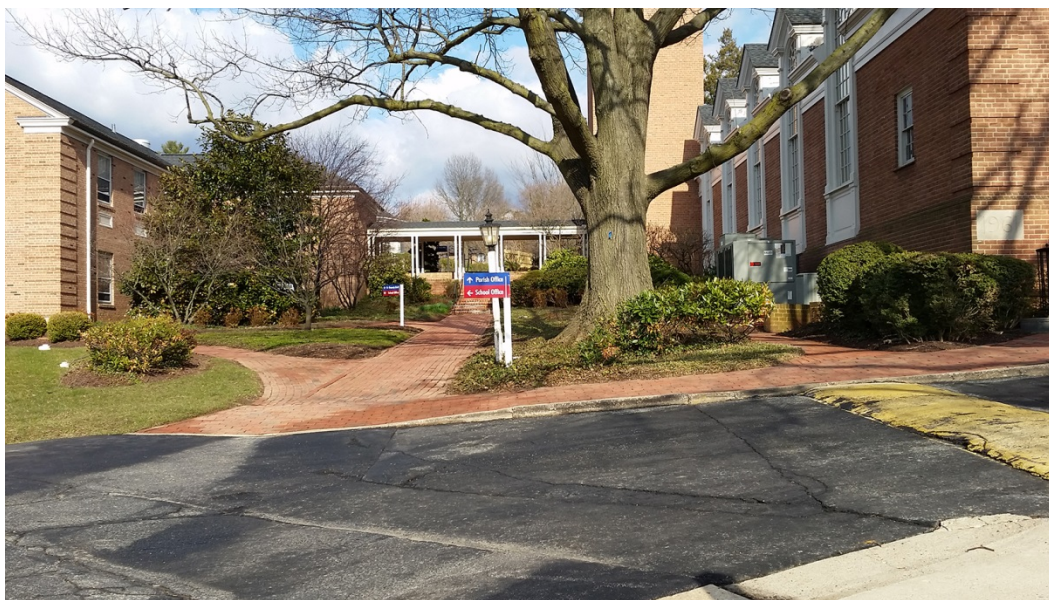
1. Approach from driveway, facing north-east