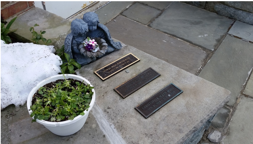
9. Typical cap stone over inurnment niches