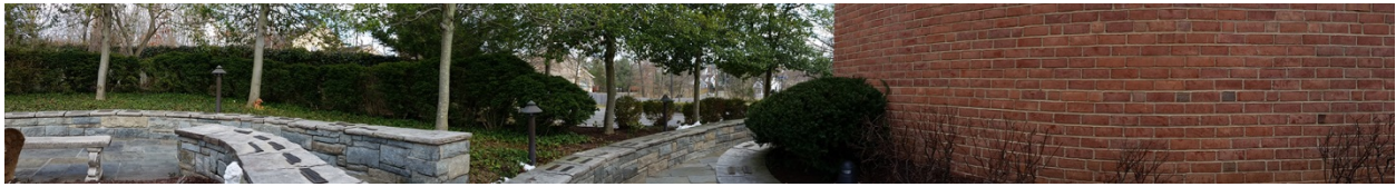
5. Panoramic from east to south to west