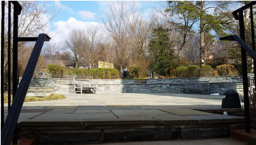
3. Center of columbarium garden from breezeway, facing north-east