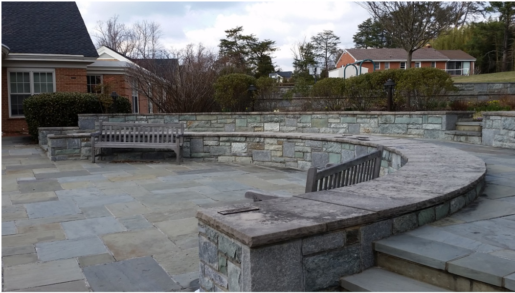
8. Half-round columbarium, niches under cap stones, facing north