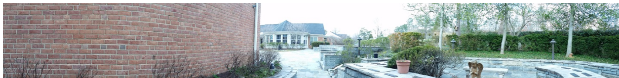
4. Panoramic from west to north to east