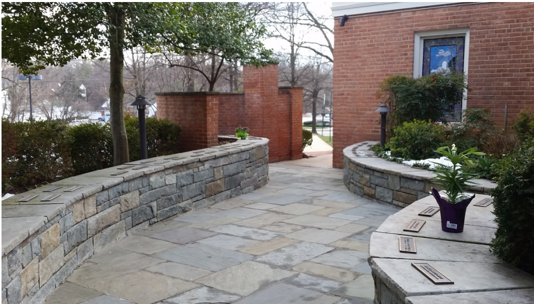
6. Half-wall columbarium, niches under cap stones, facing south