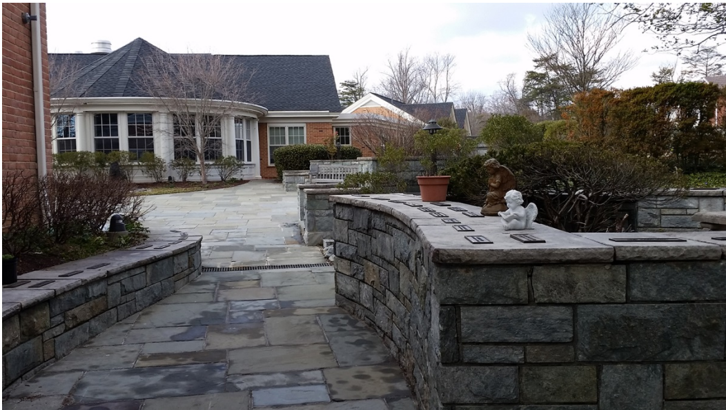
7. Half-wall columbarium, niches under cap stones, facing north