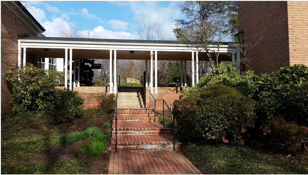
2. Breezeway entrance to columbarium garden, facing north-east