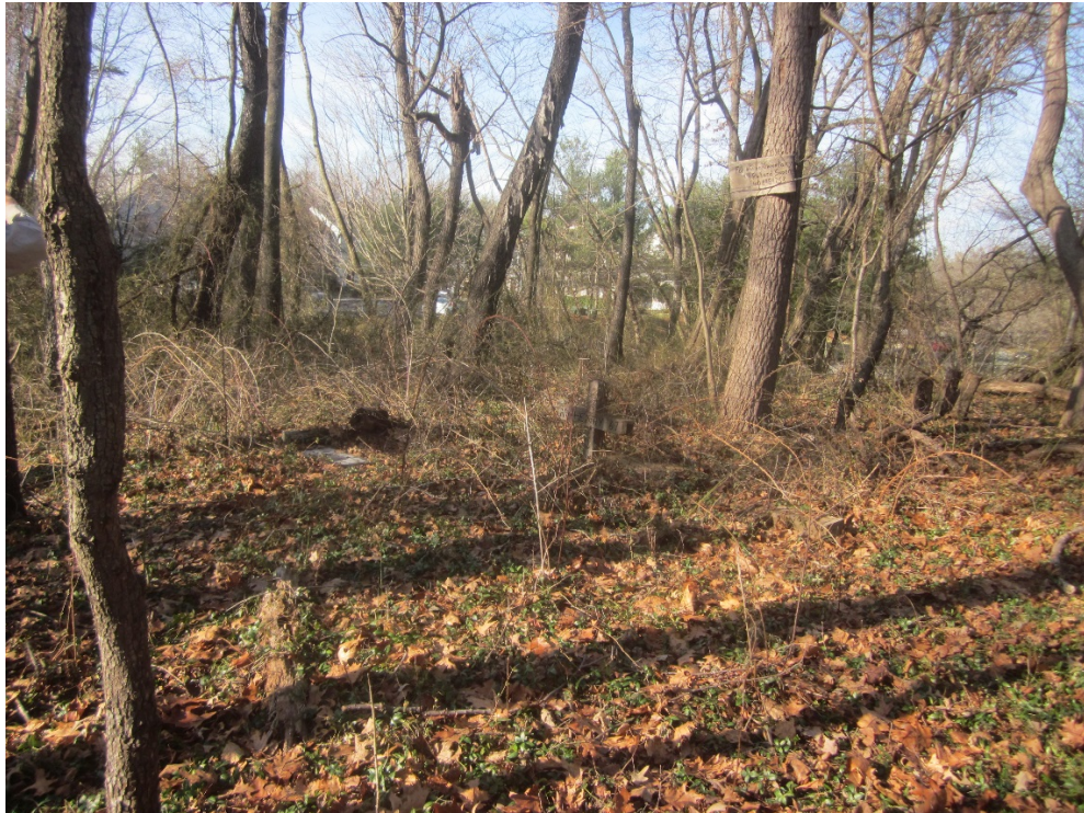
3. Center of cemetery, facing southwest