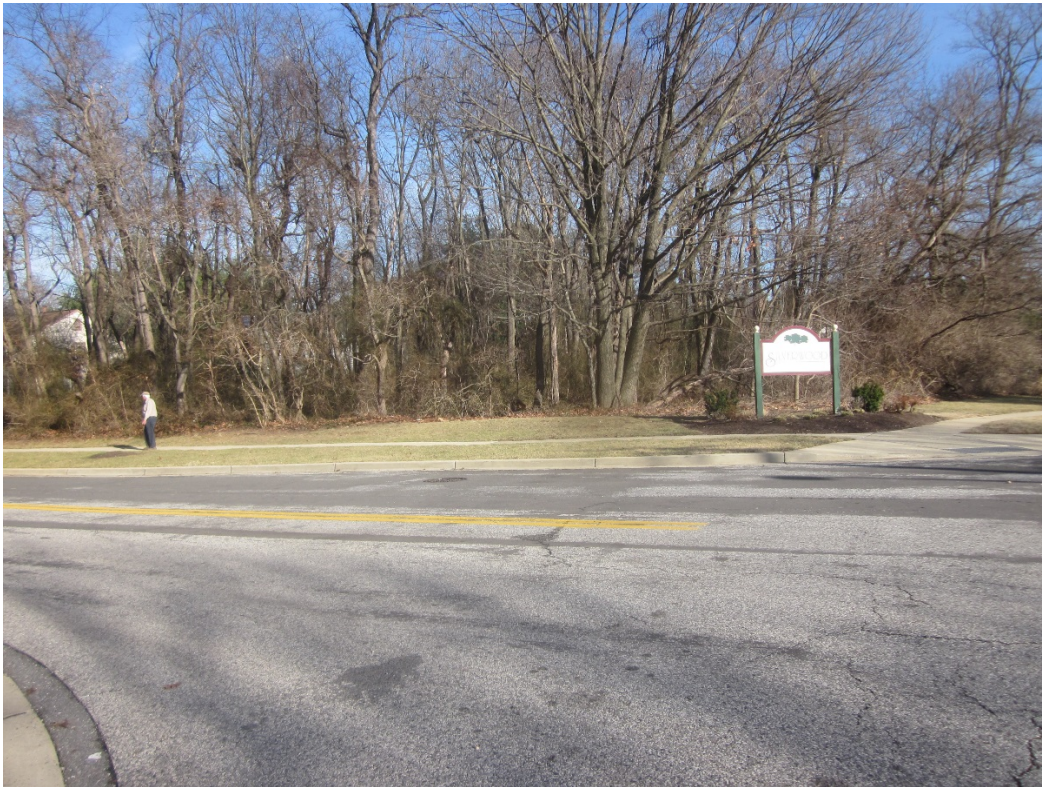
1. View of cemetery from Greencastle Rd, facing north