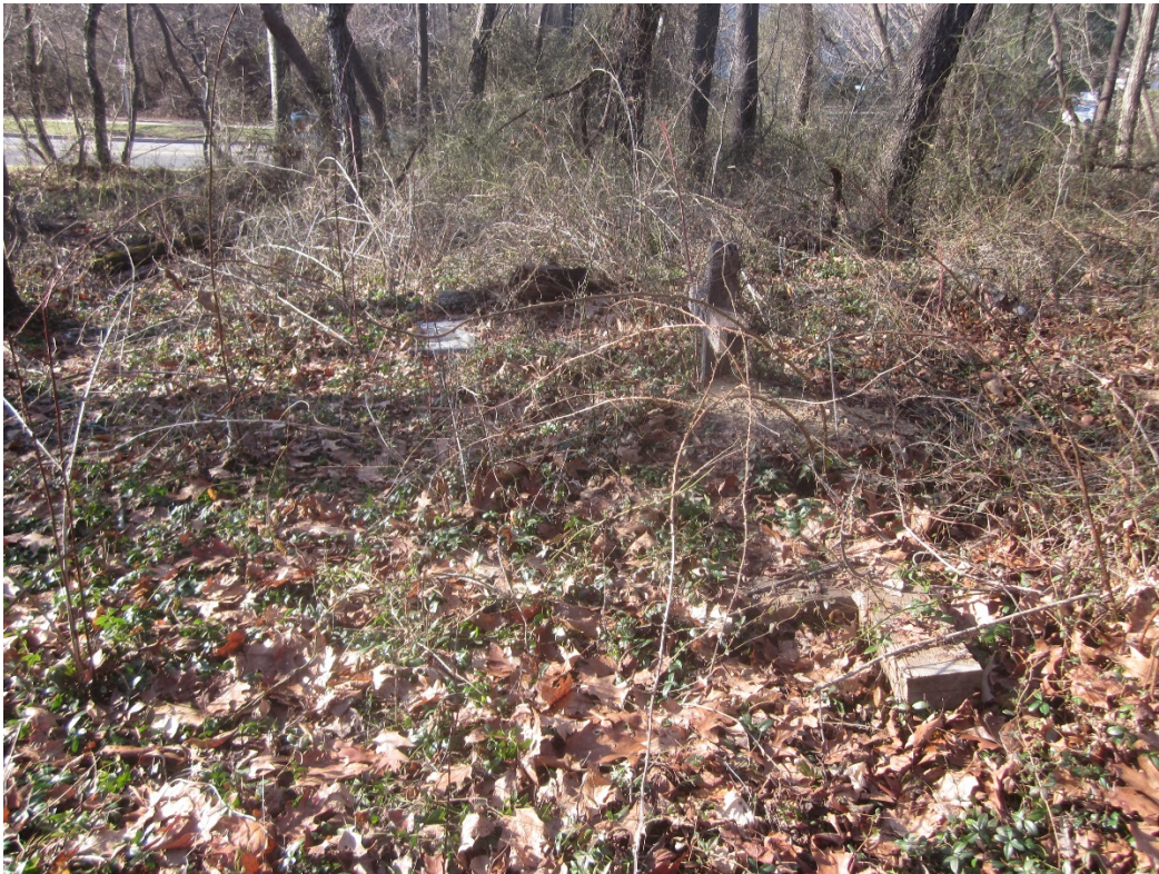
5. Center of cemetery, facing south toward Greencastle Rd