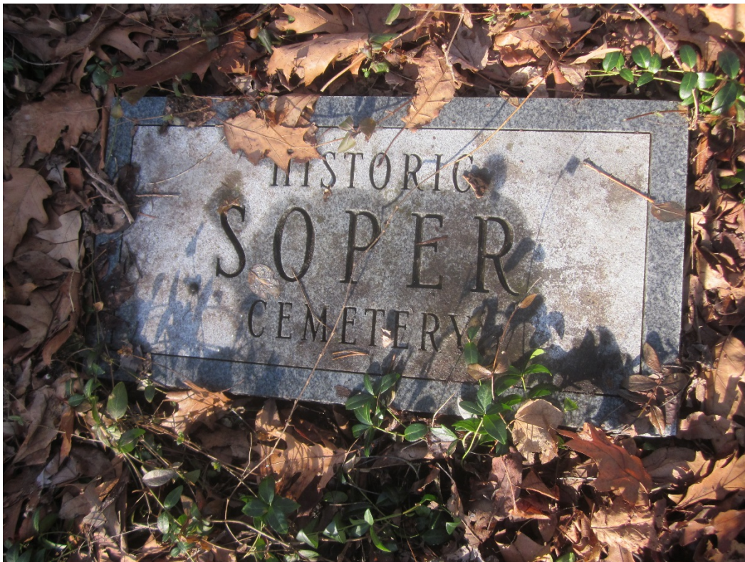
6. Historic Soper Cemetery marker in middle of cemetery