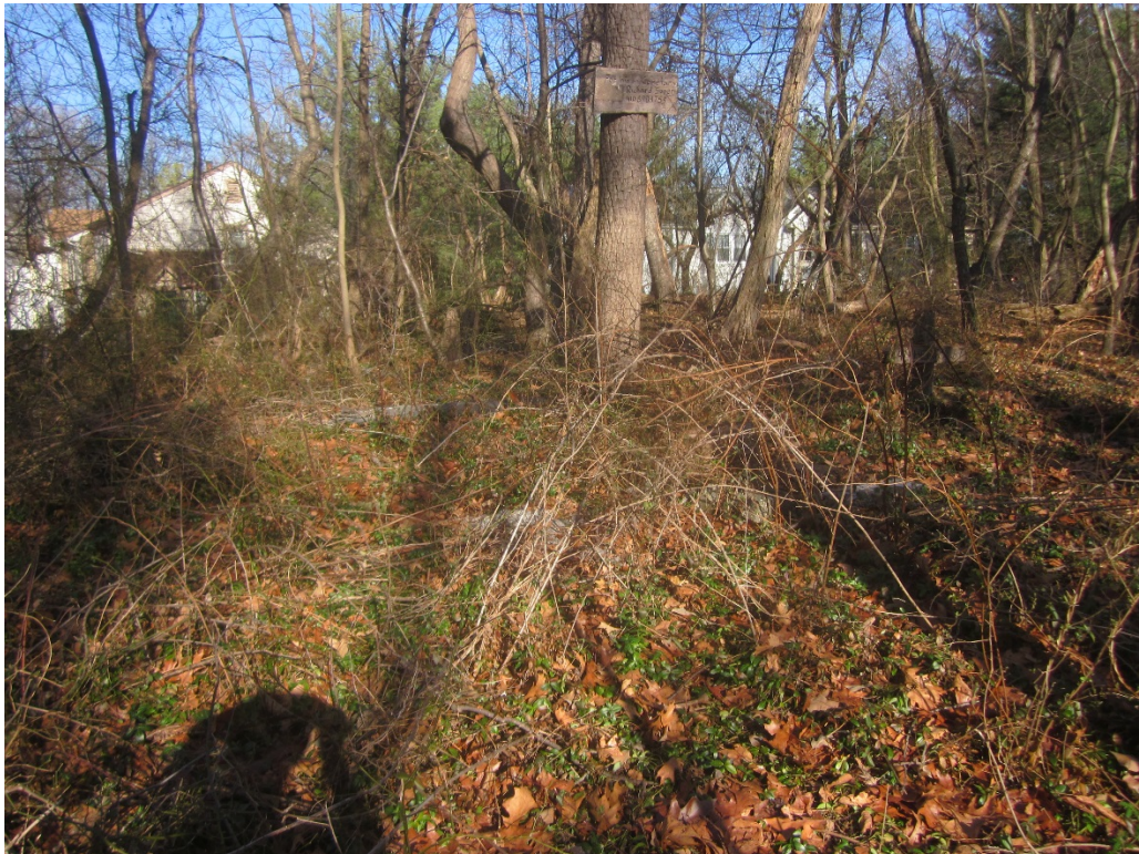
2. Entrance to cemetery from corner of Greencastle and Wexhall, facing north