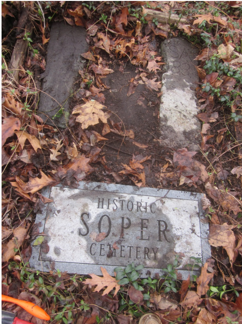
9. Historic marker and 2 concrete markers with initials and dates