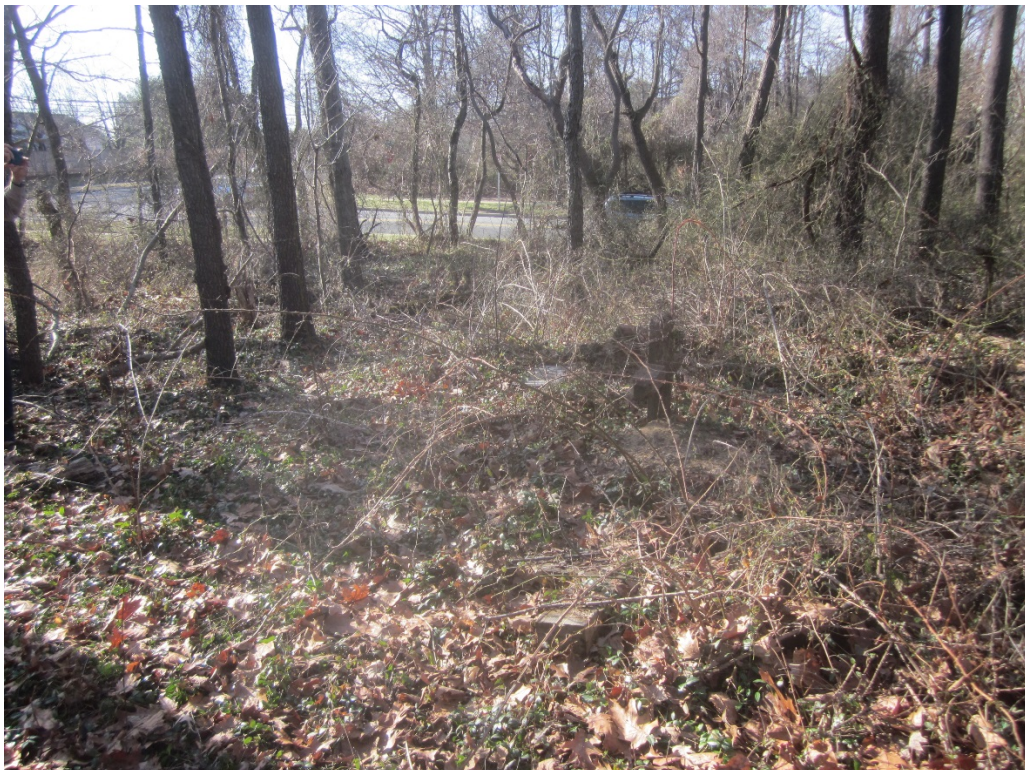
4. Center of cemetery, facing south toward Greencastle Rd