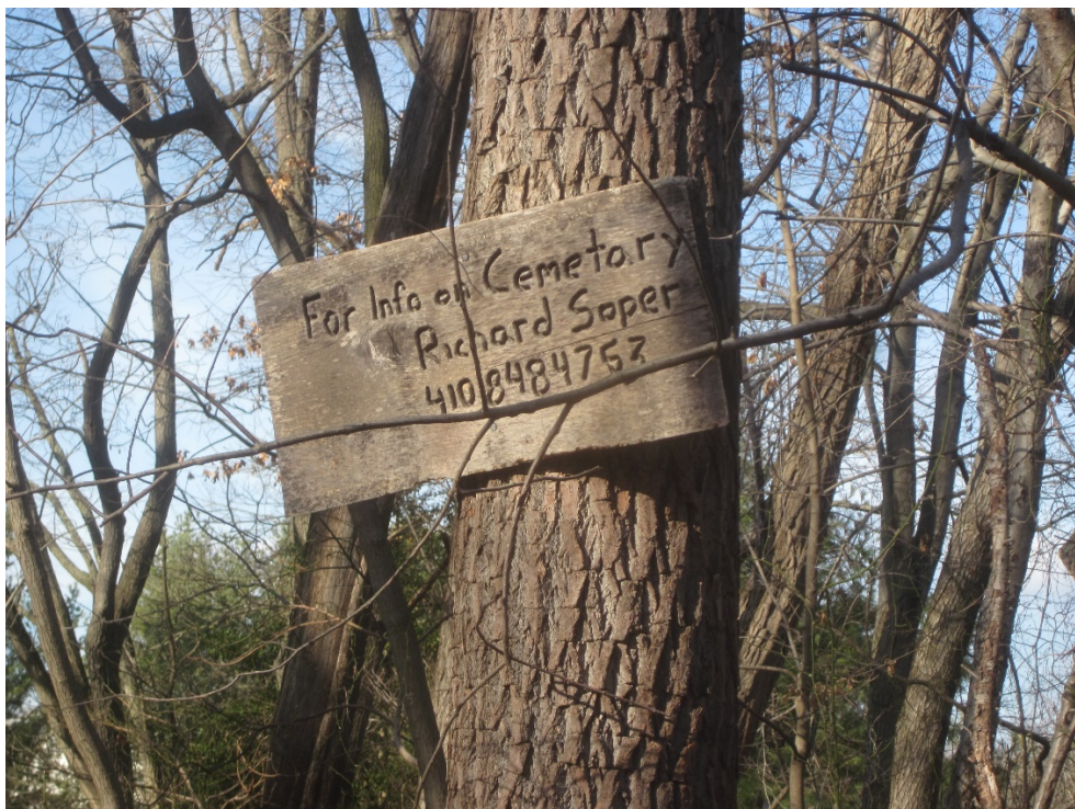
8. Wooden sign mounted on tree