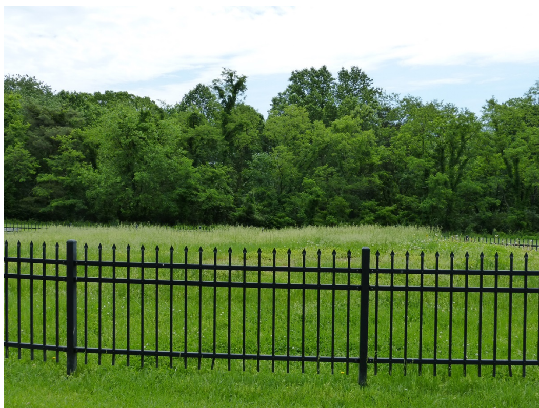
6. View from pathway toward cemetery, facing south-east