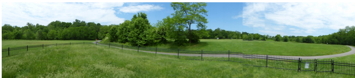
4. Panoramic from west to north to east from marker