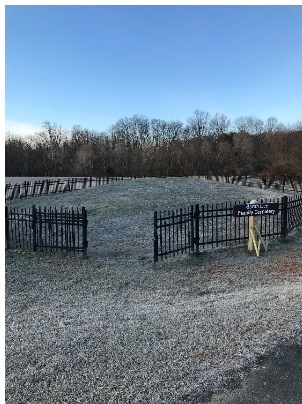
8. Cemetery with new sign at entrance gate