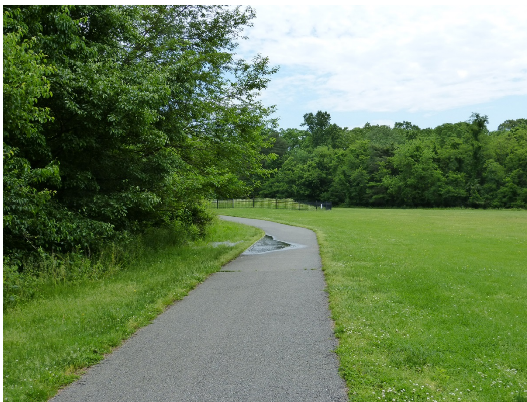
1. Approach to cemetery from parking lot, facing south-east