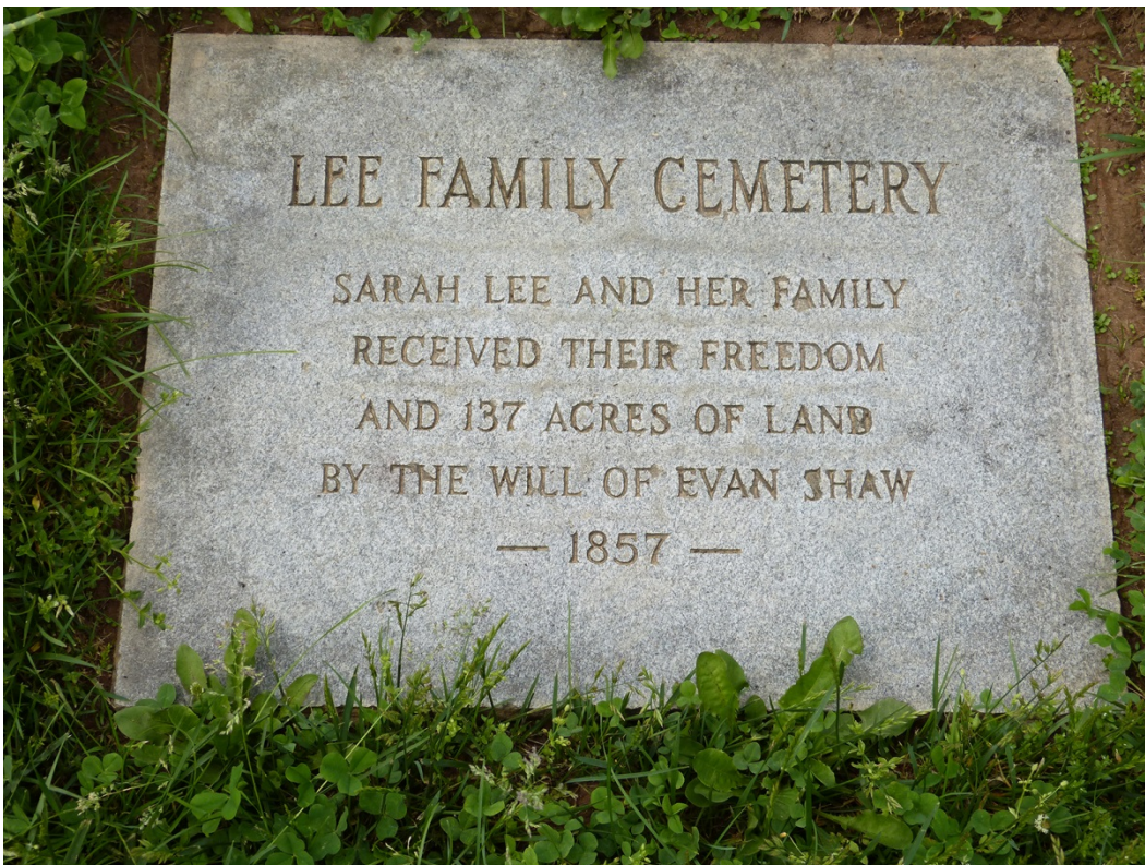
3. Granite marker located in the center of burial mound