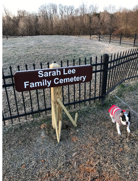
7. New cemetery sign added in December 2018