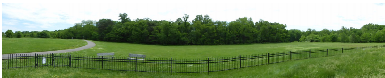
5. Panoramic from east to south to west from marker