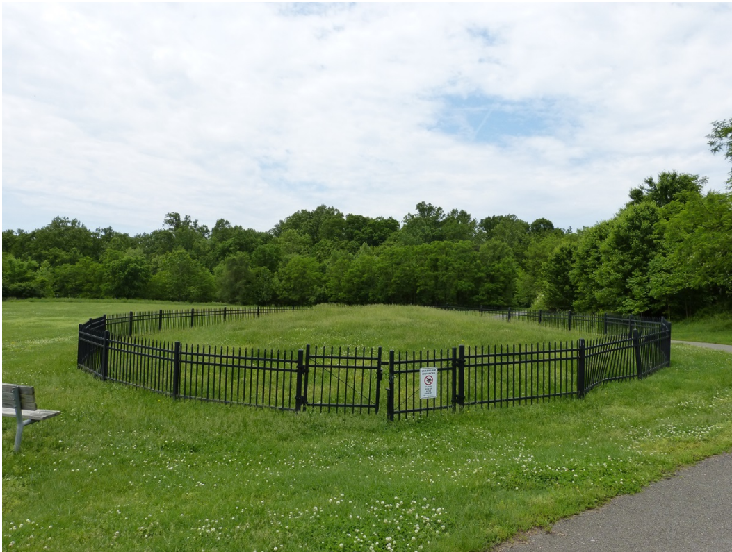
2. View toward cemetery, facing south-west