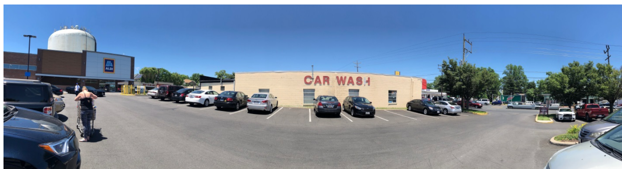
2. Panoramic from west to north to east