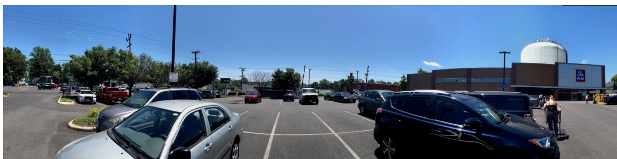
1. Panoramic from east to south to west