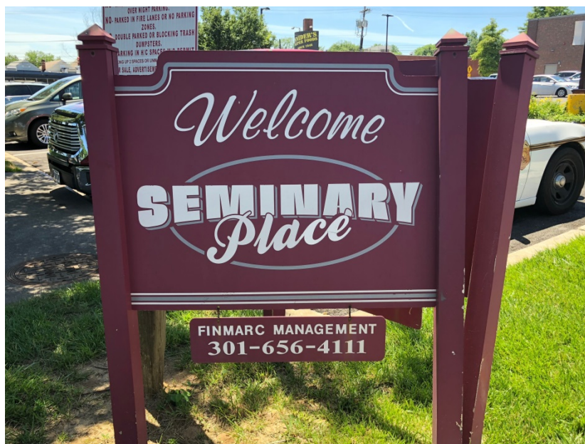
3. Location sign for shopping center with management info