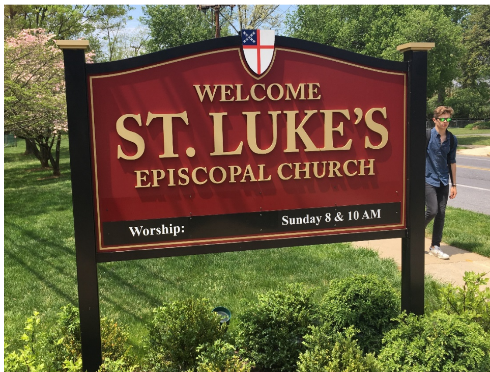
1. Church sign on Grosvenor Lane, facing north