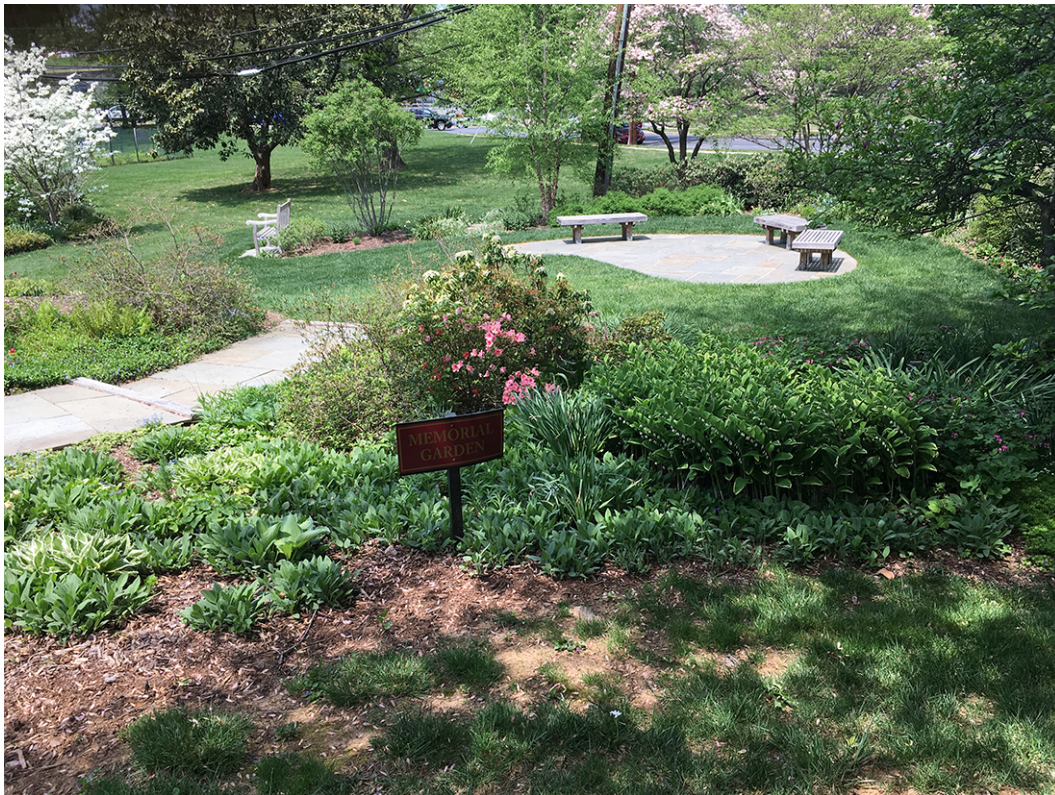
2. Approach to memorial garden, facing west