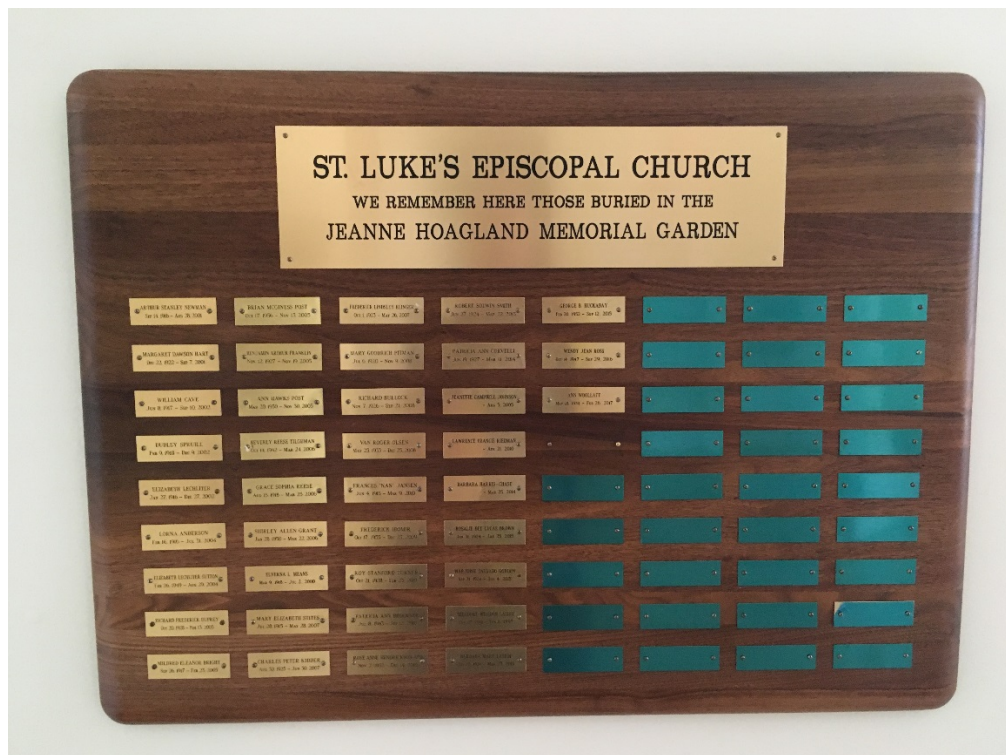
8. Second name plaque of burials in memorial garden