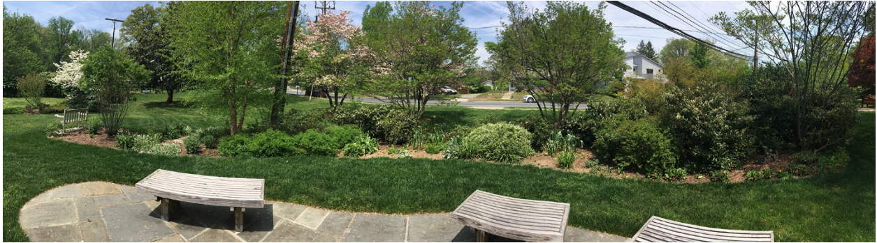
4. Panoramic from patio from west to north to east