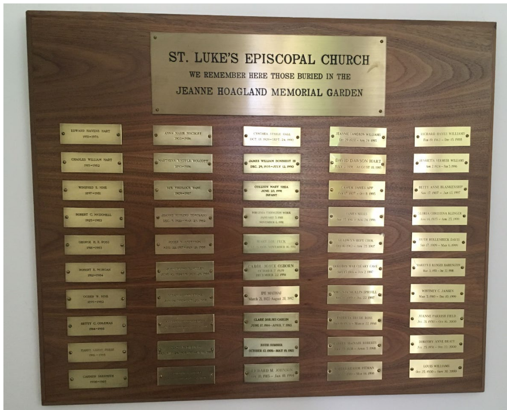
7. First name plaque of burials in memorial garden