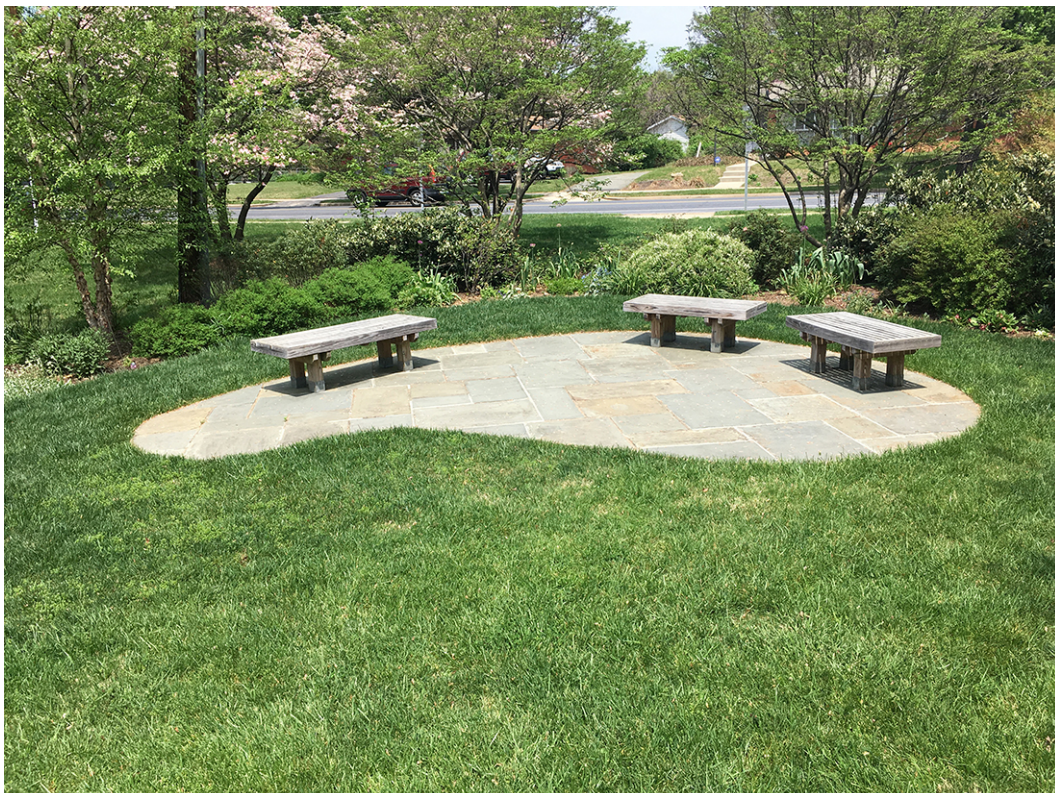
3. Memorial garden flagstone patio and benches