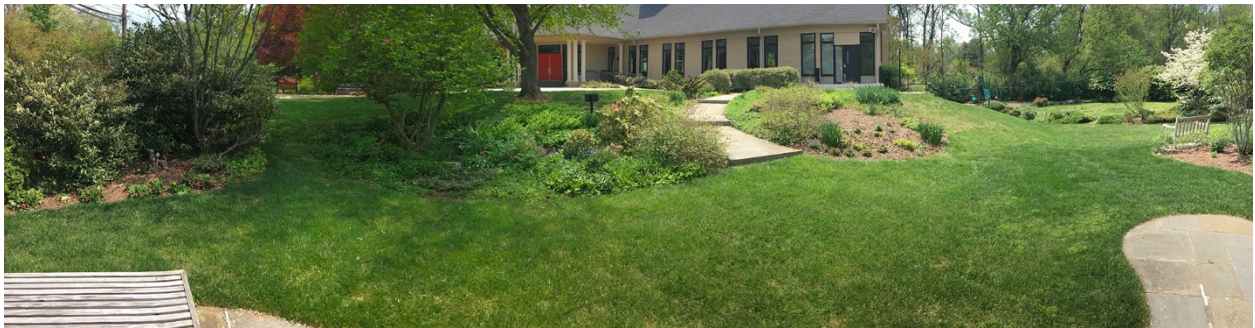
5. Panoramic from patio from east to south to west