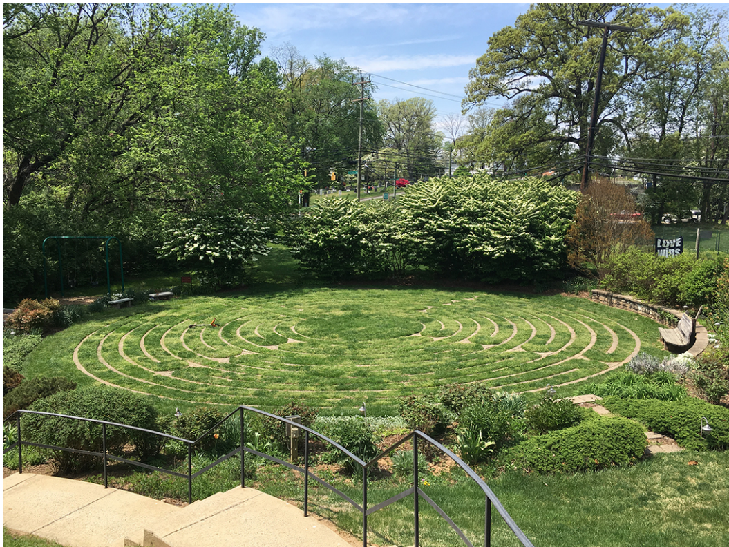
6. Labyrinth with perimeter memorial garden