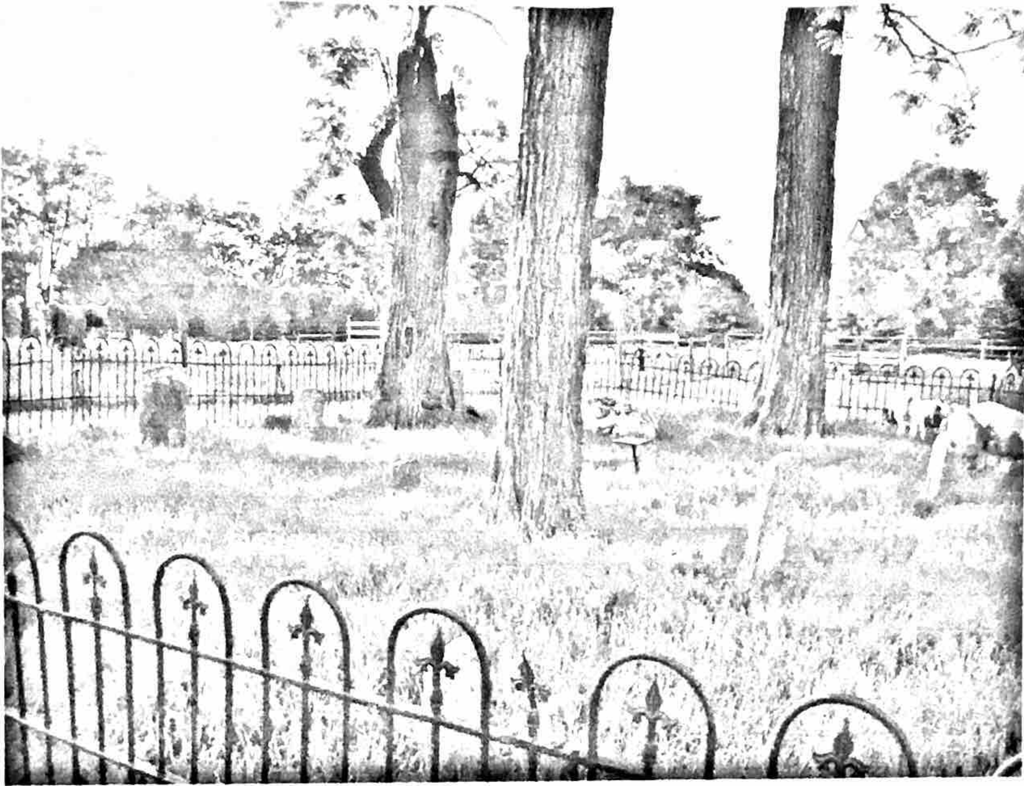
100-0017 Looking east from southwest corner of cemetery.

2014 HAYES FAMILY CEMETERY 22310 W. HARRIS ROAD BARNESVILLE