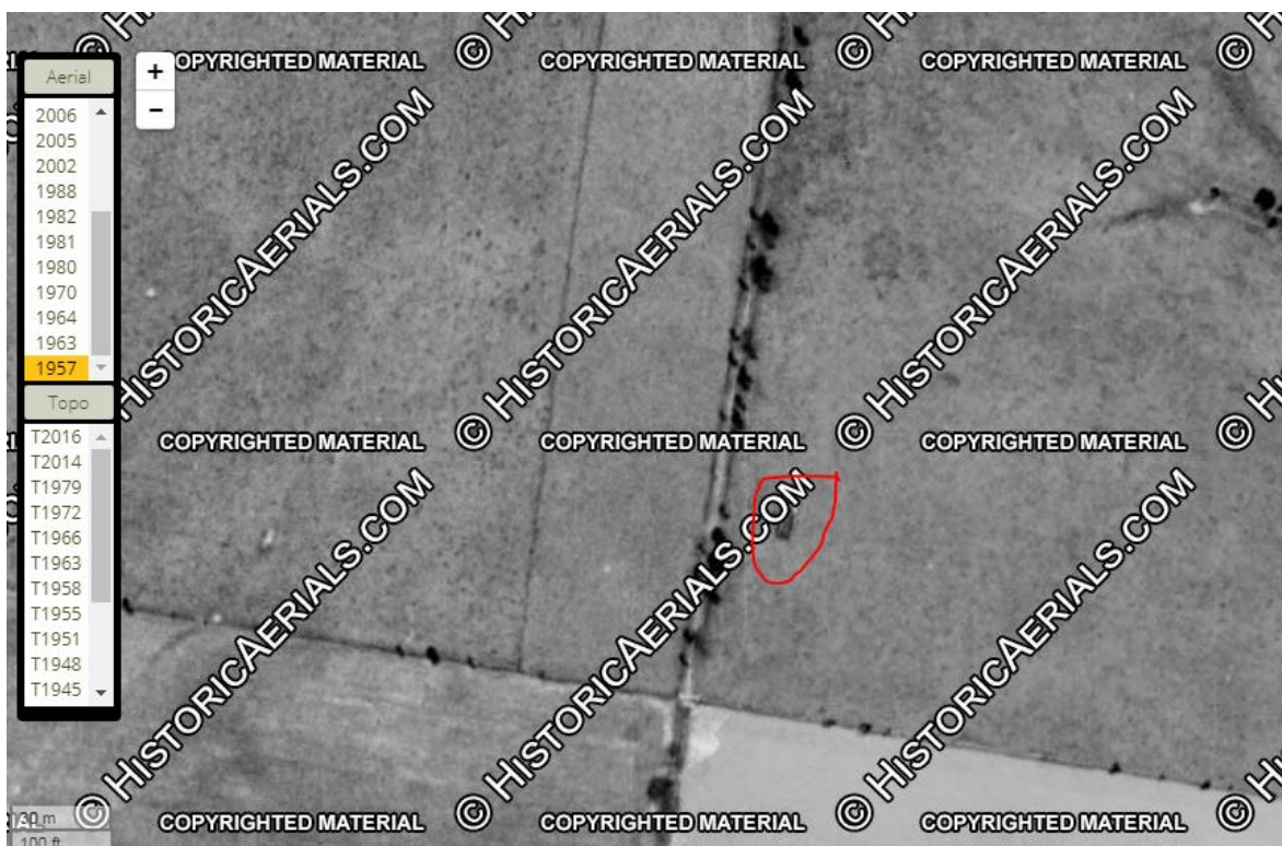
Possible cemetery surrounded by fence and trees, 1957