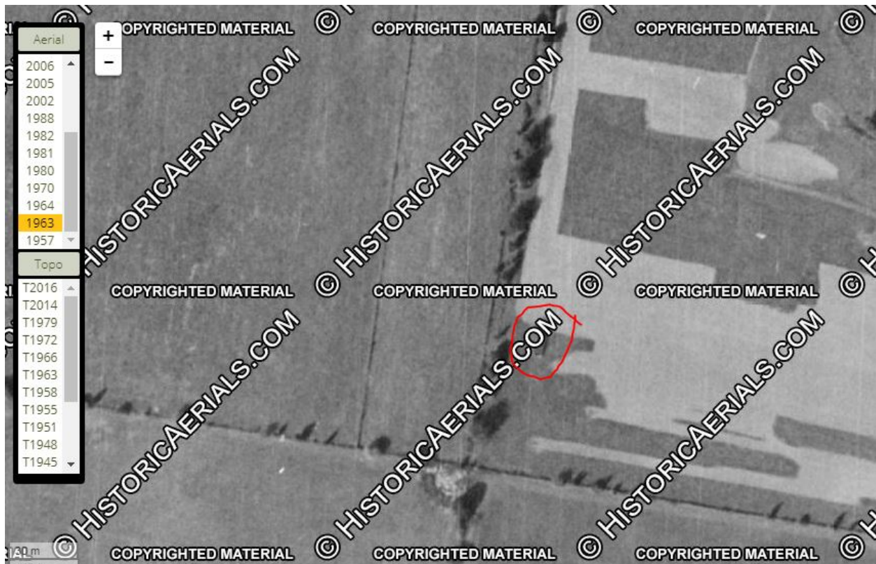
Possible cemetery surrounded by fence and trees, 1963