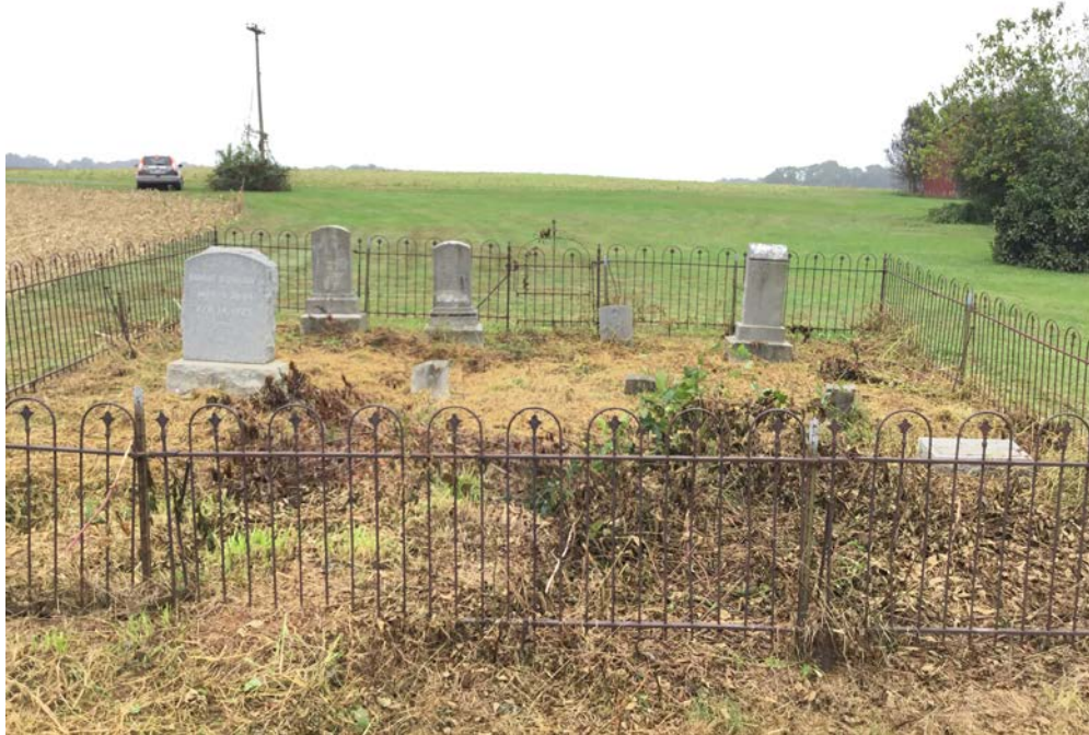
4. Cemetery from the east side, facing west