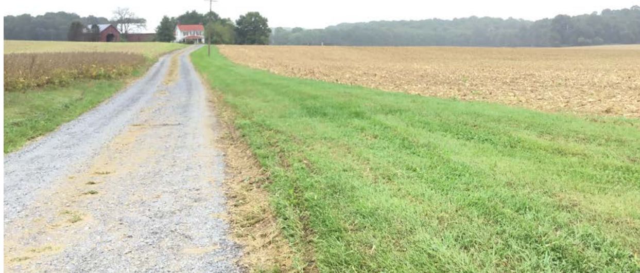
1. Driveway to house, cemetery to the right after corn field, facing northeast