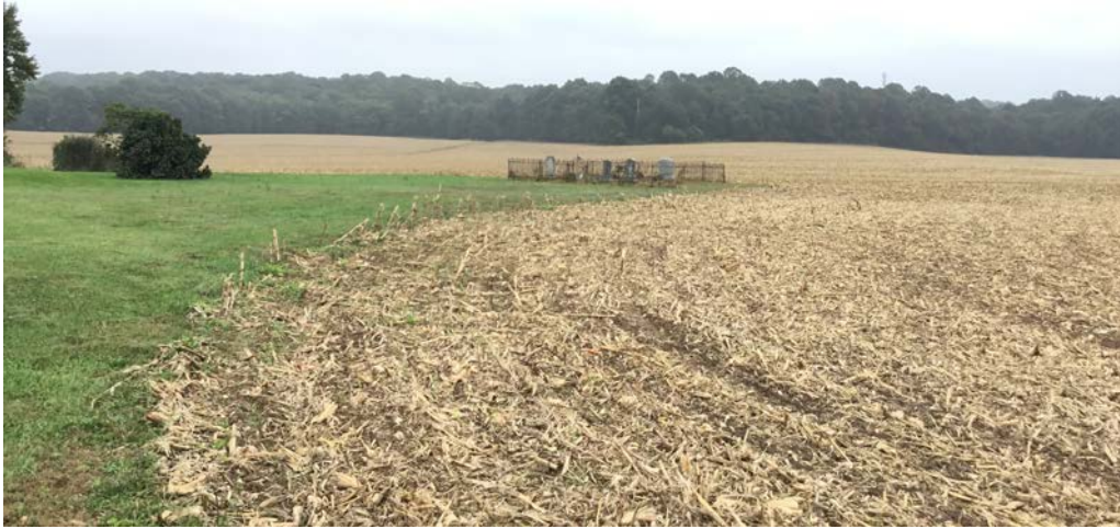
2. Initial view of cemetery, facing east