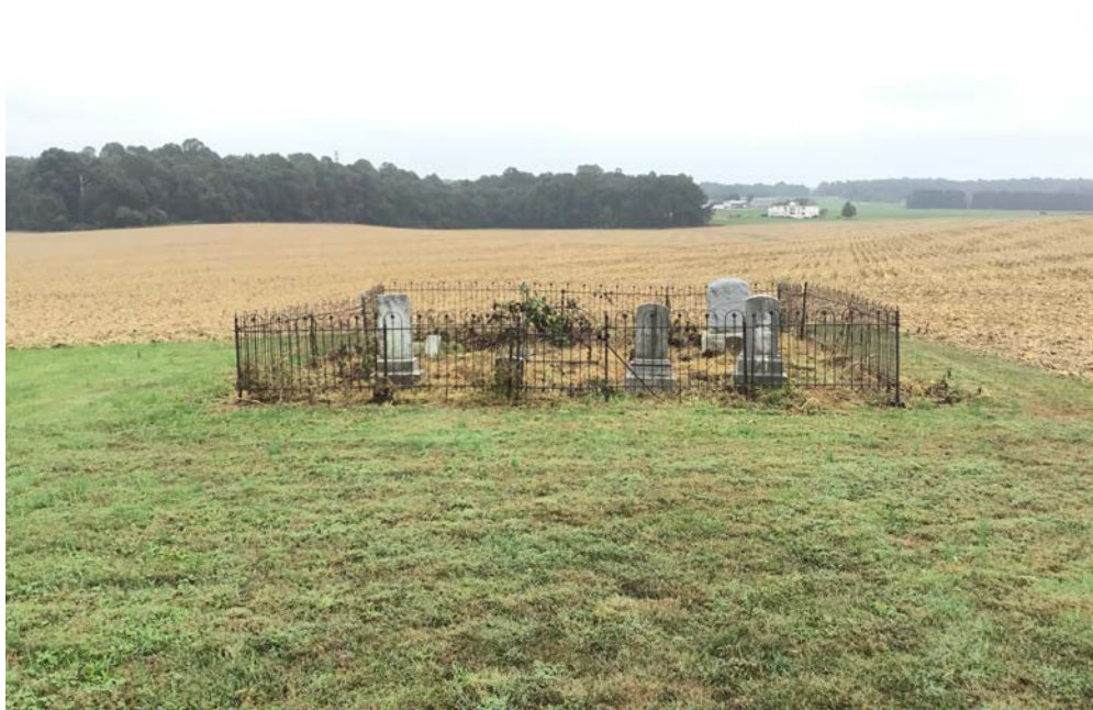
3. Approach to cemetery gate, facing east