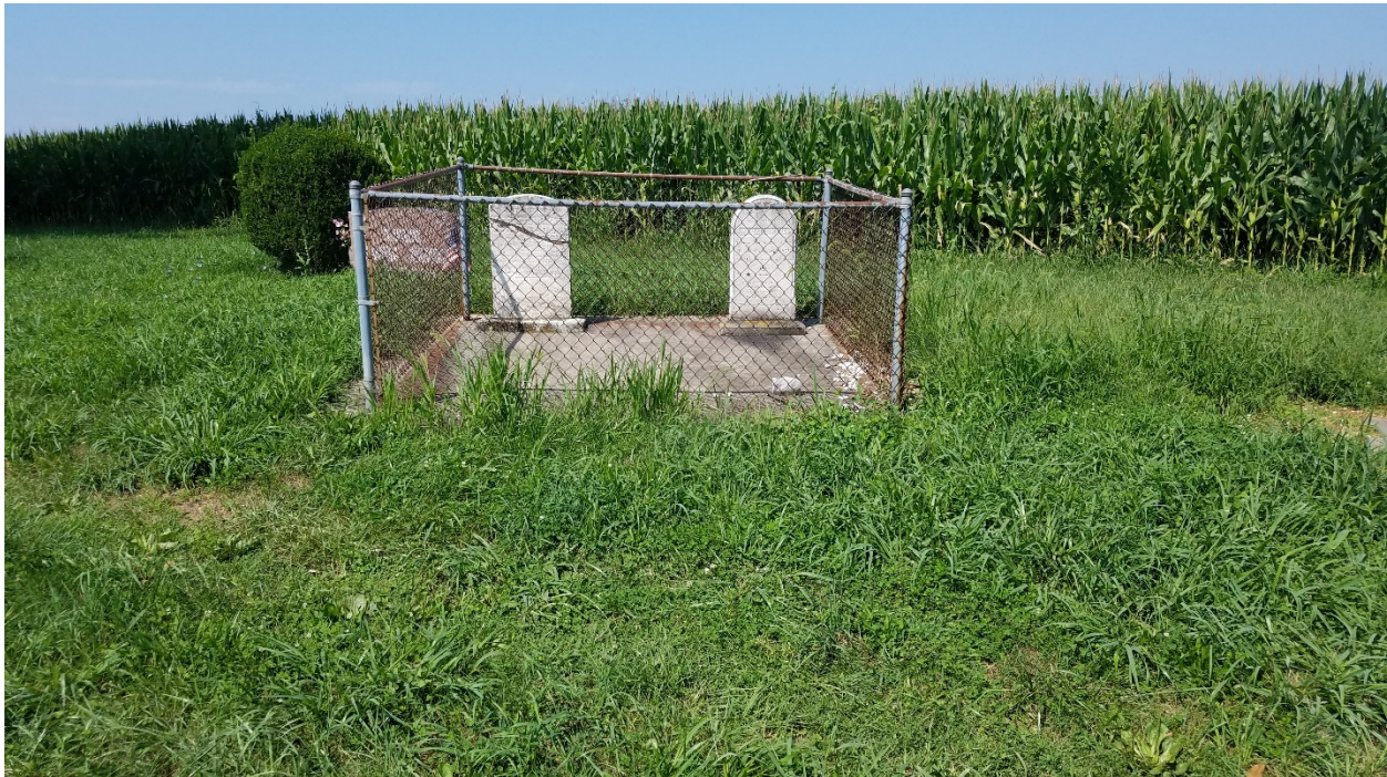
5. Cemetery, facing west