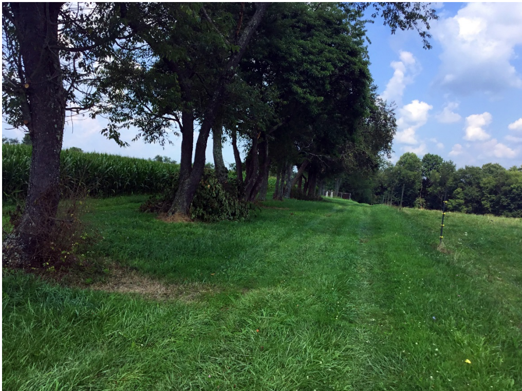
3. Approach to the cemetery along pathway, facing north