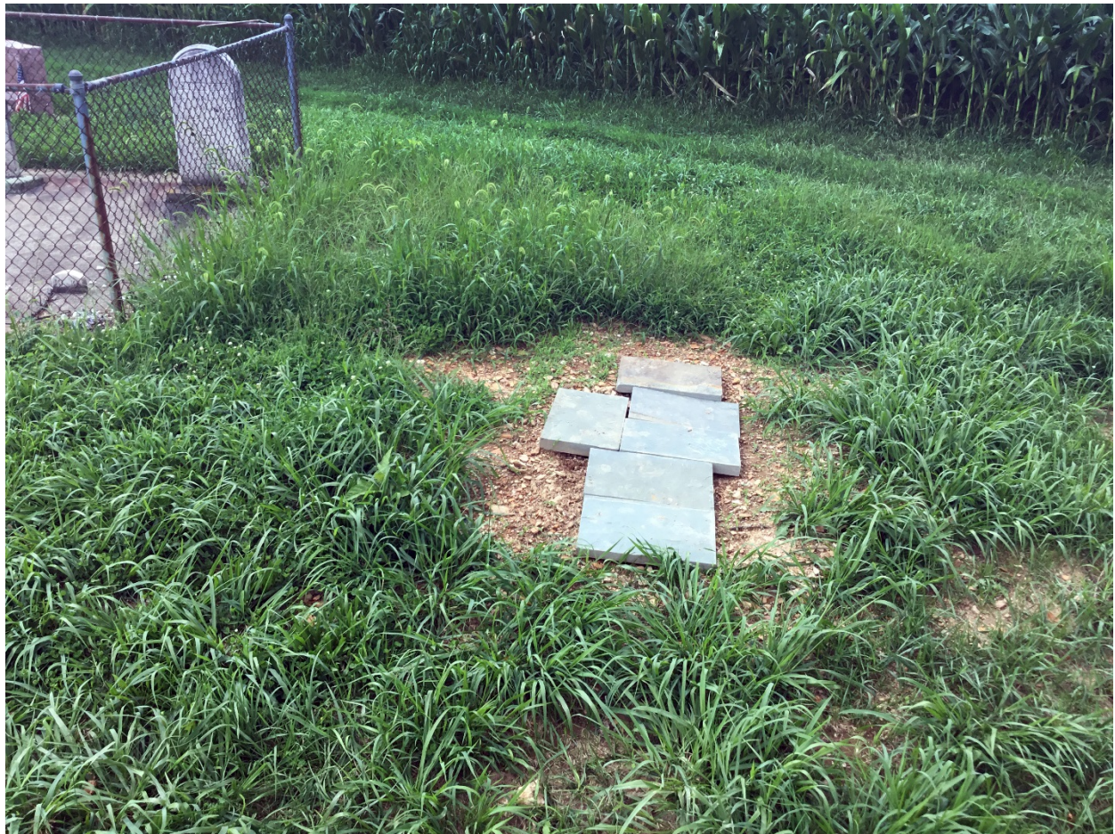
7. Burial area of the current family pets (dogs)