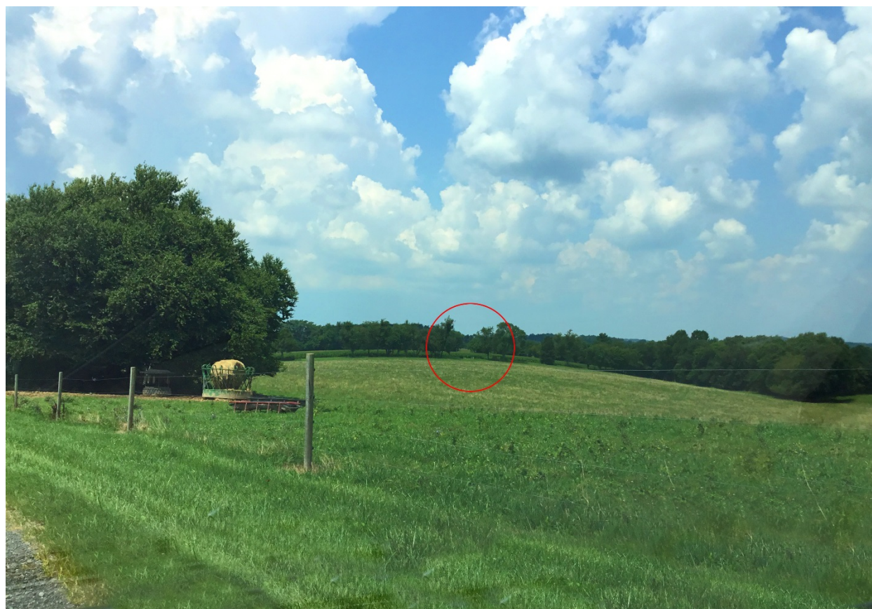
1. Approach to the cemetery from the back of the house, facing northwest