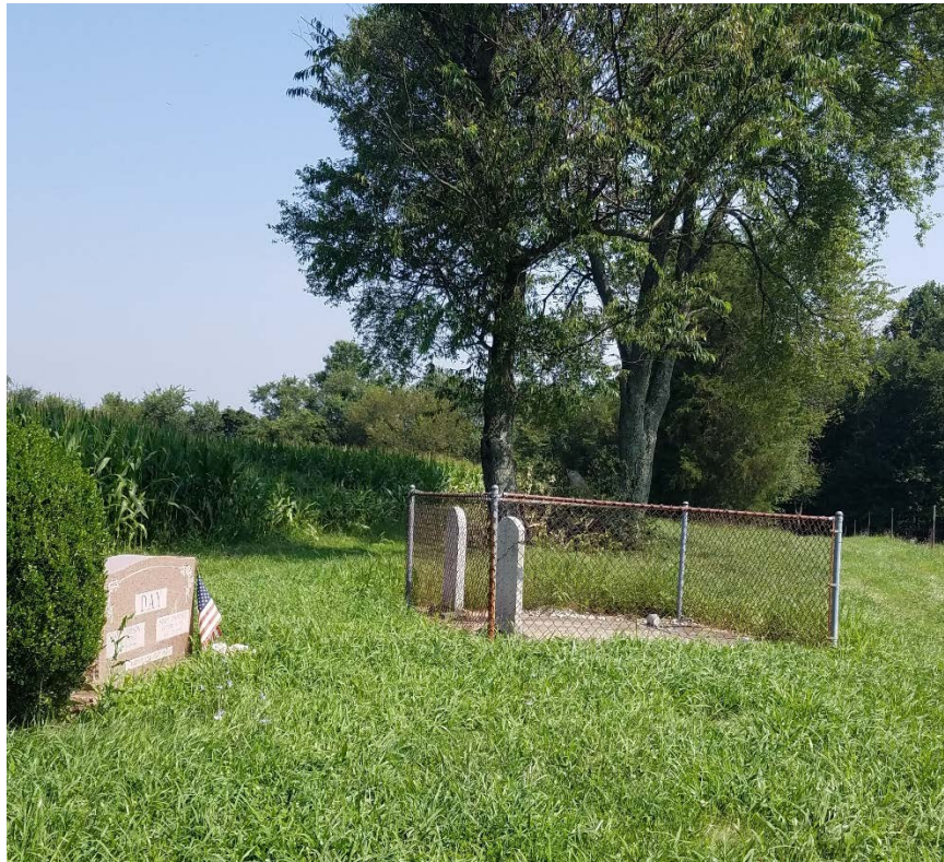
4. Cemetery, facing north