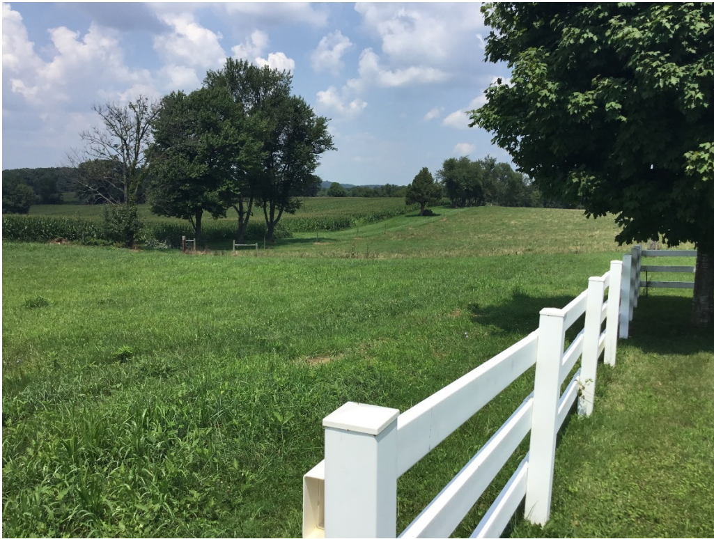
2. View to the cemetery from fence behind house, facing northwest