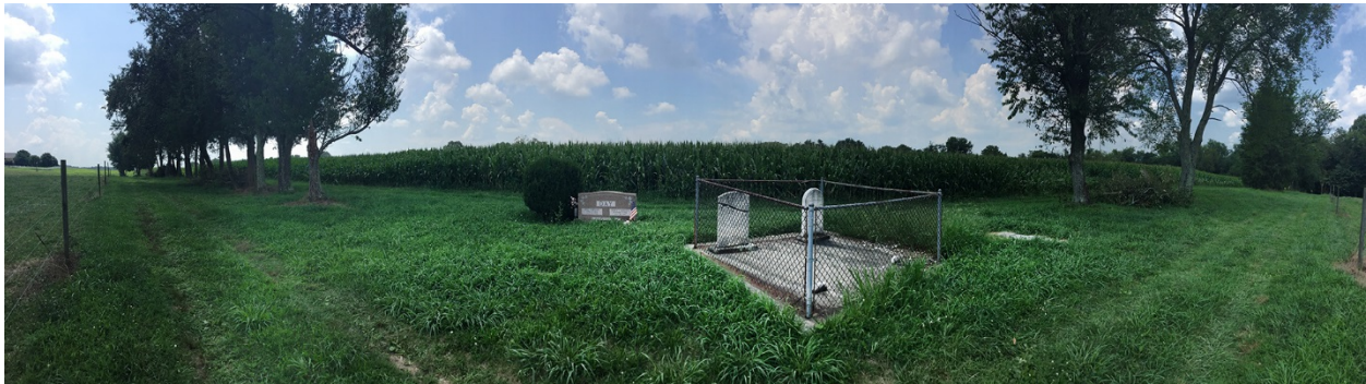
6. Panoramic from south to west to north