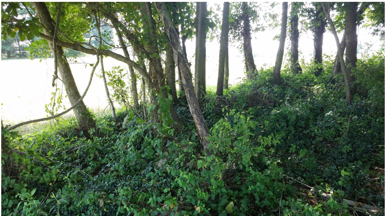
3. Overgrowth of ivy and weeds covering the grave markers