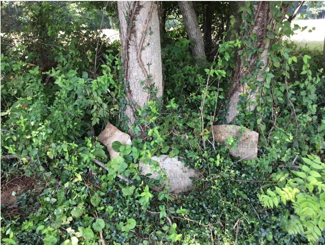
2. Discarded grave markers leaning on trees, facing