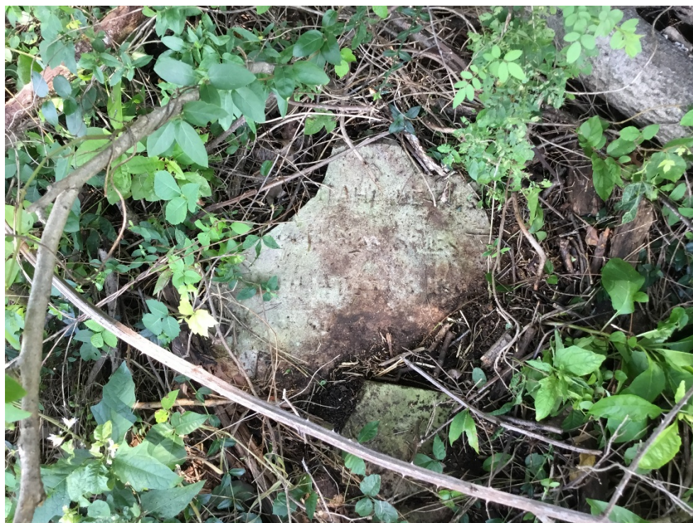
5. Overgrowth of ivy and weeds covering the grave markers