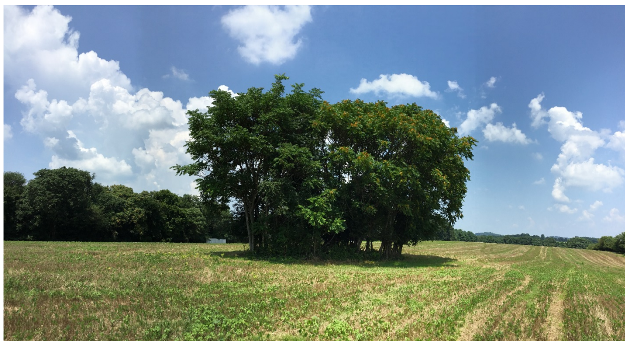
1. Trees in middle of a cornfield where markers are found