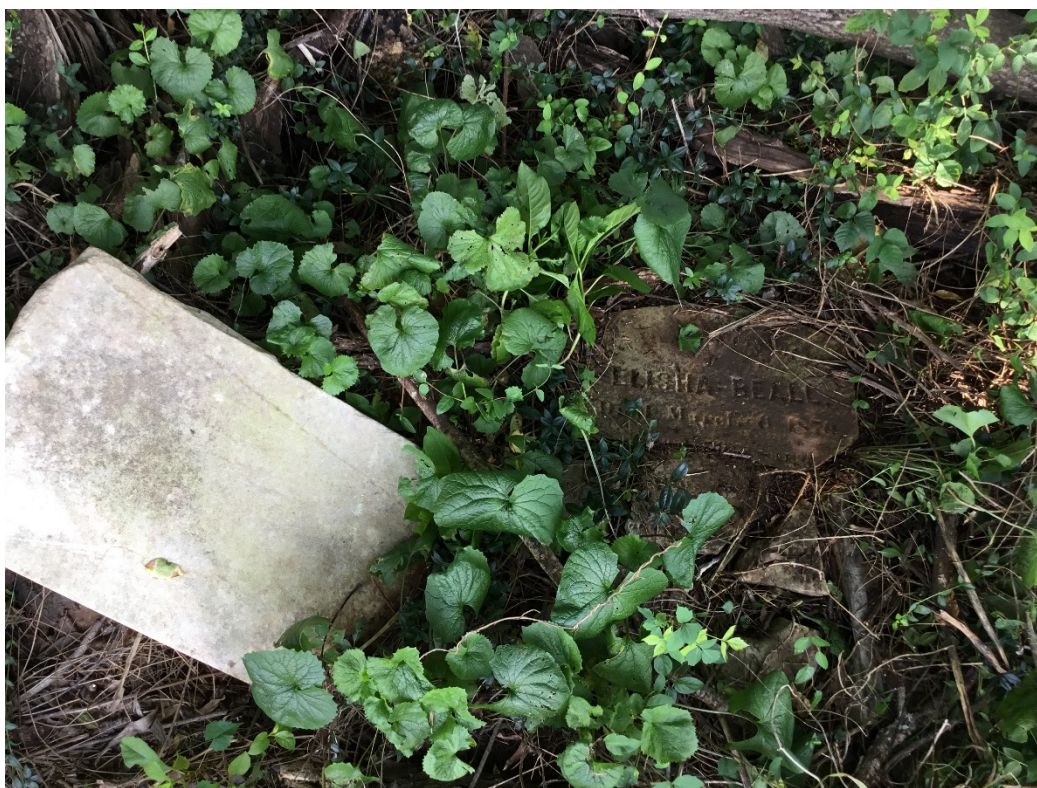
4. Overgrowth of ivy and weeds covering the grave markers