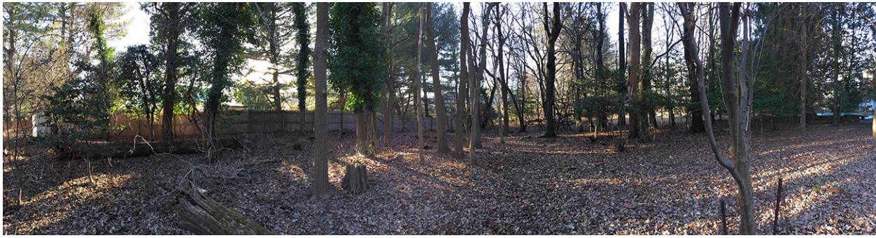
4. Panoramic from center of cemetery facing south