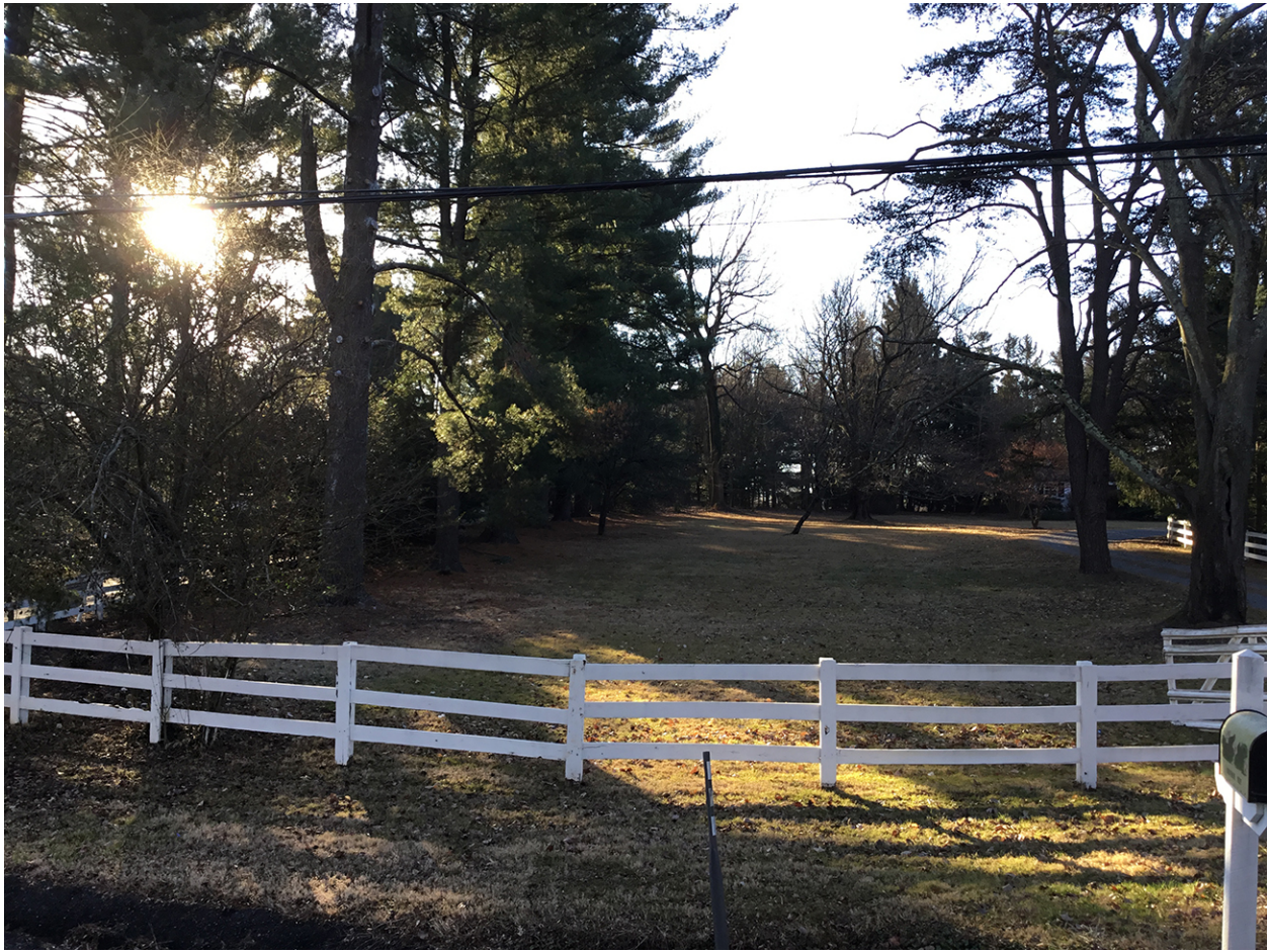
1. Approach from Bronson Drive right-of-way along tree line at left