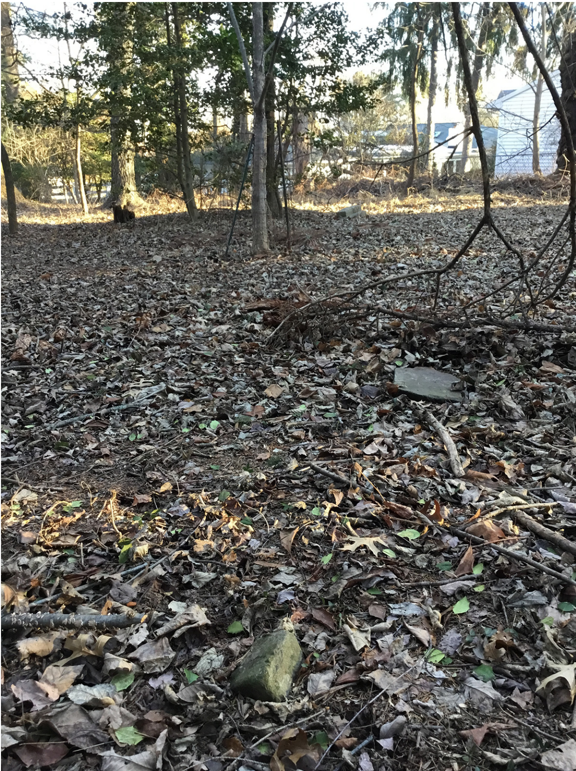
8. Field stones facing east