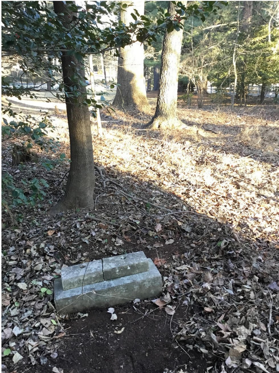
5. Solitary grave base close to right-of-way entrance