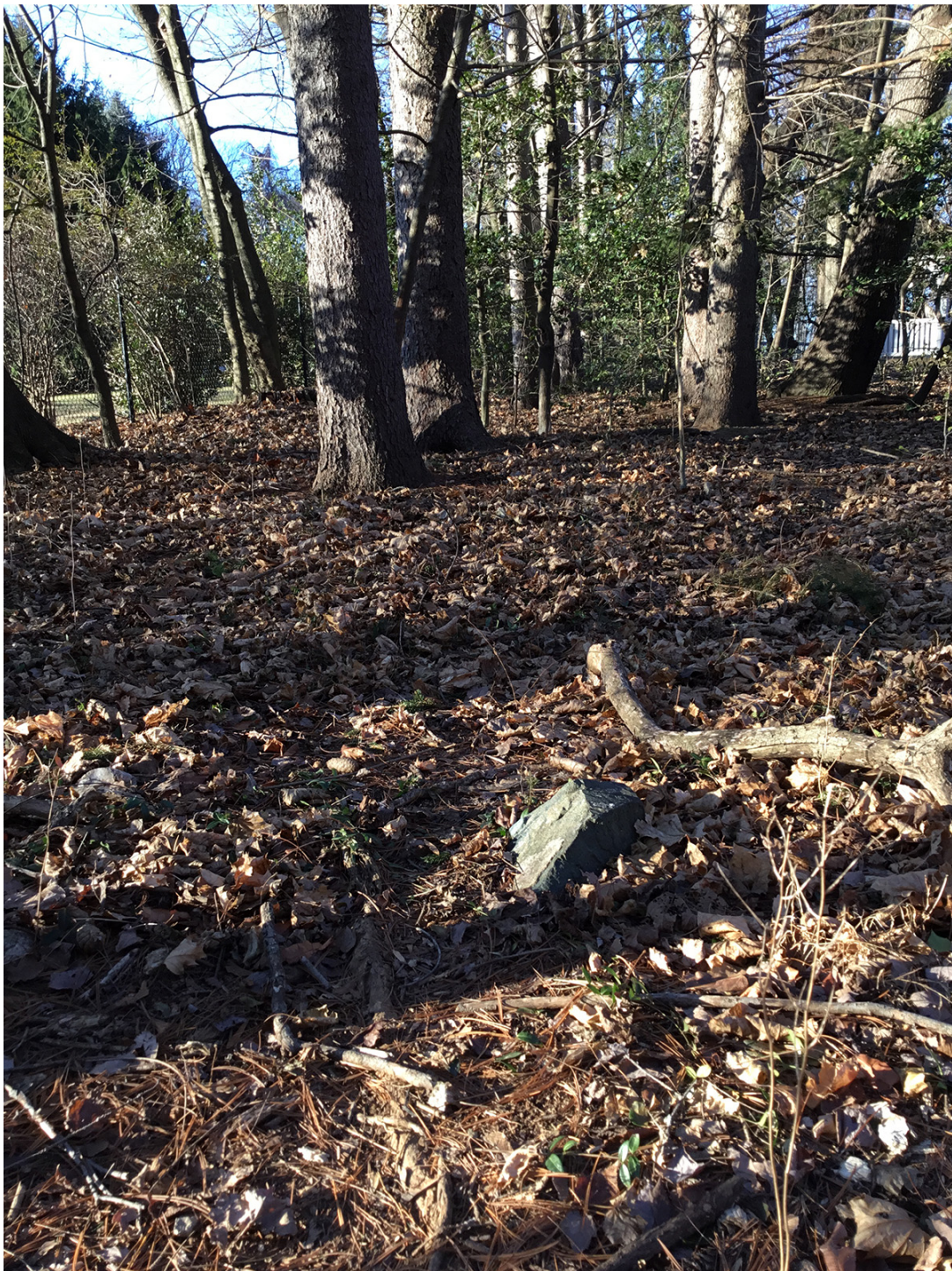
6. Field stone along southern edge