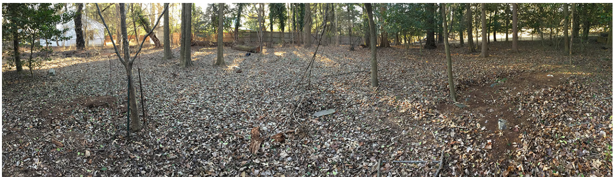
2. Panoramic from entry boundary toward center of cemetery