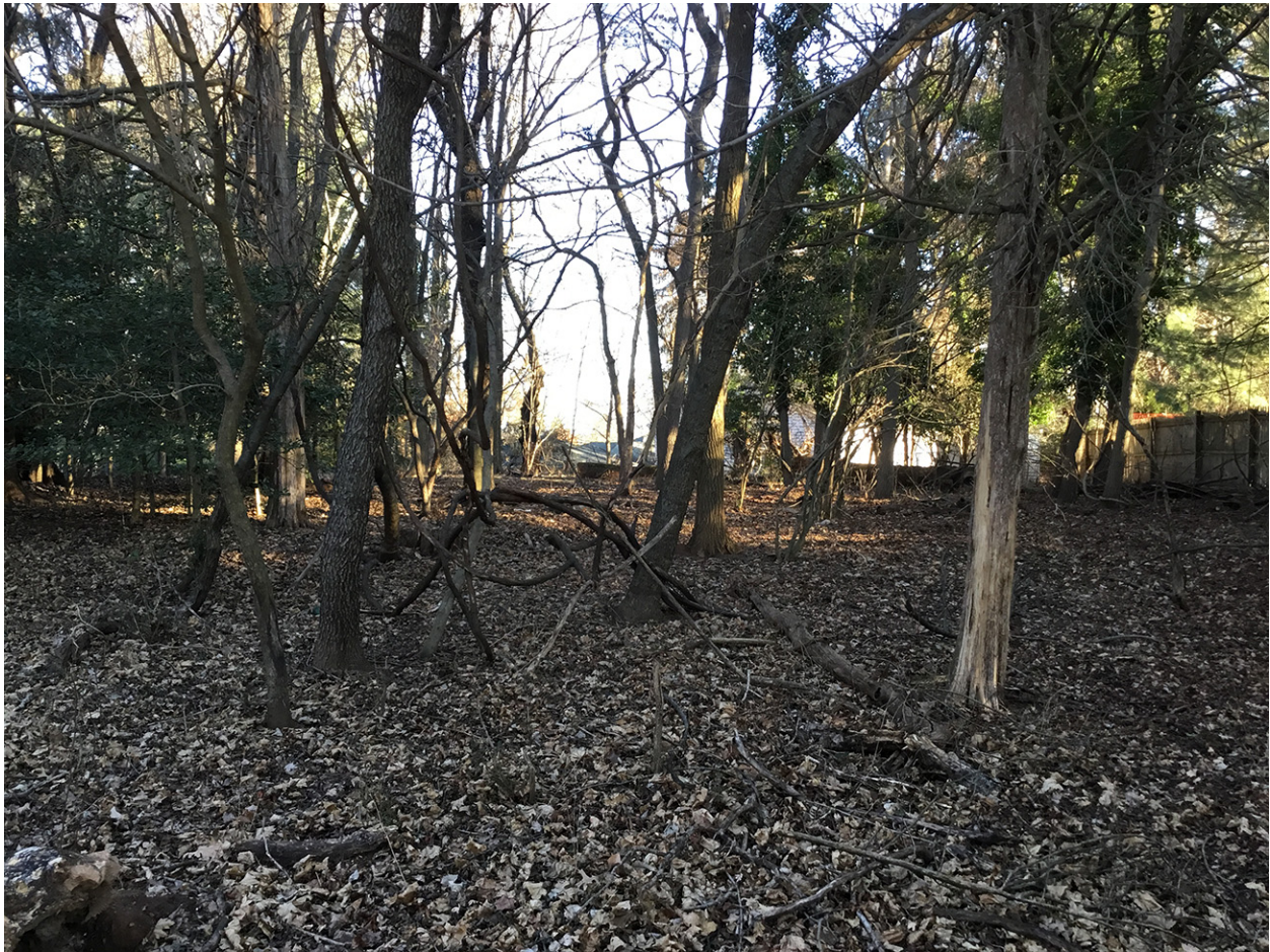
7. Facing north from southern edge