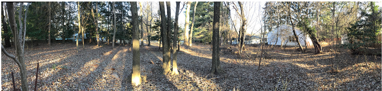
3. Panoramic from center of cemetery toward right-of-way