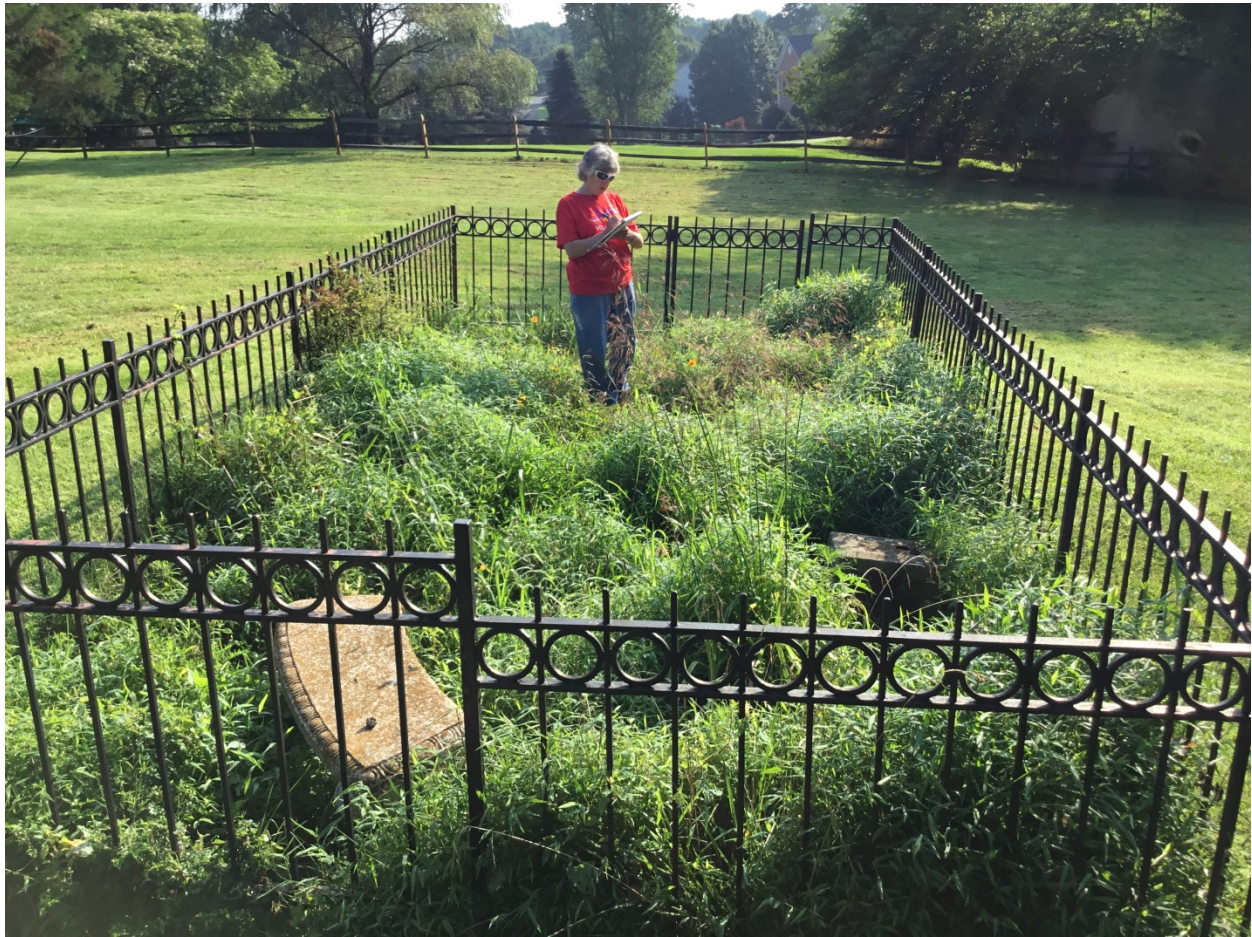
4. Overgrowth within enclosure, facing east