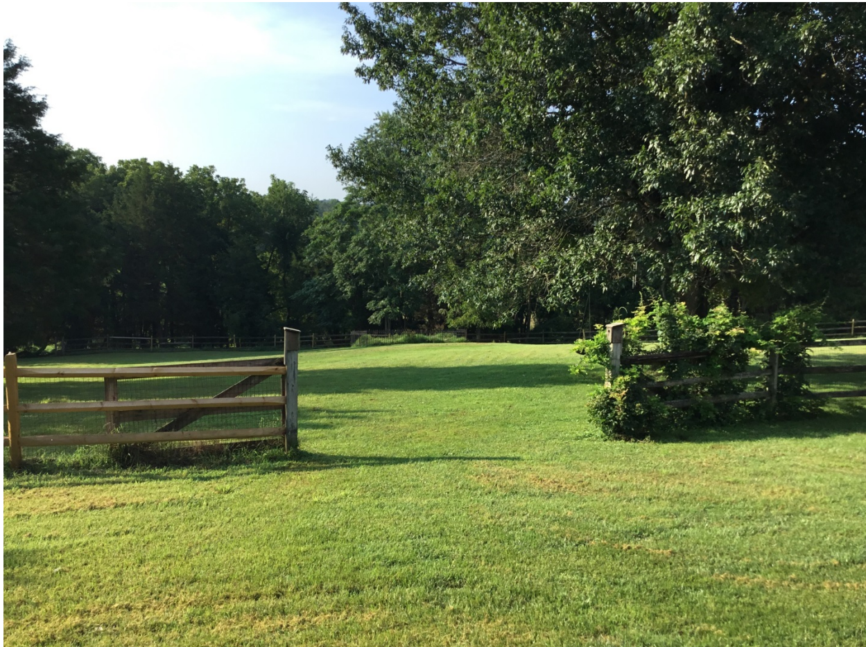
1. Approach to cemetery from residential parking lot, facing south