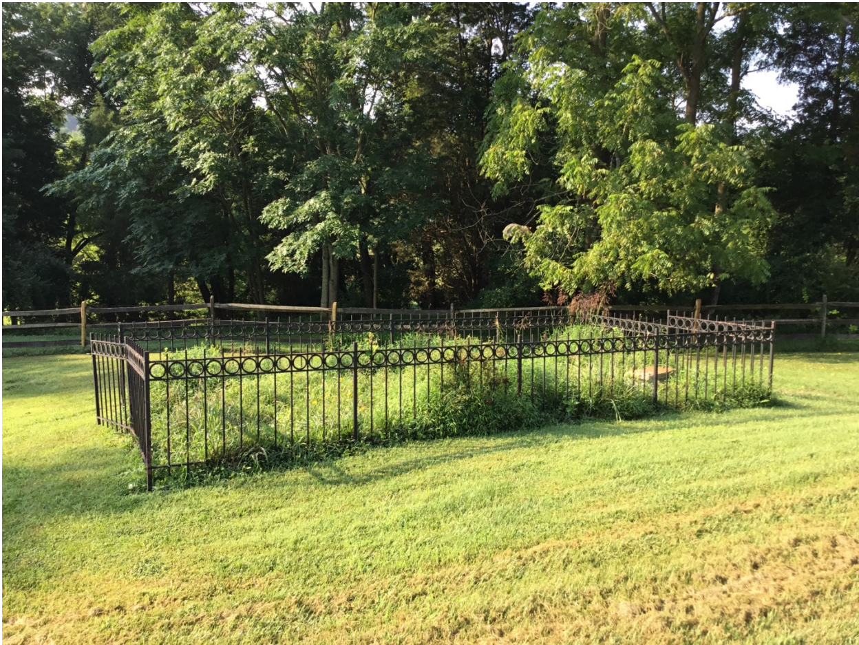
2. Gated iron fence enclosure, facing south