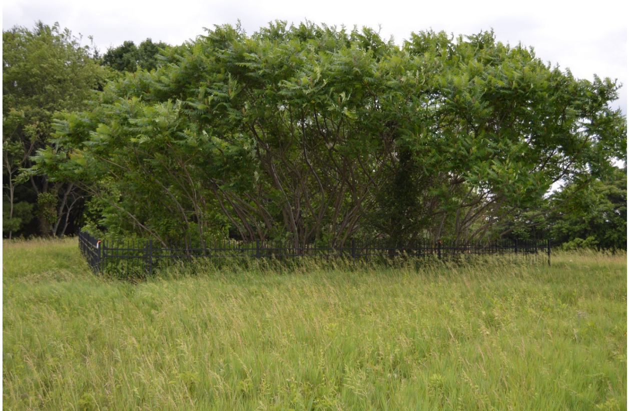
Waters Family Cemetery – Current Condition (2016)