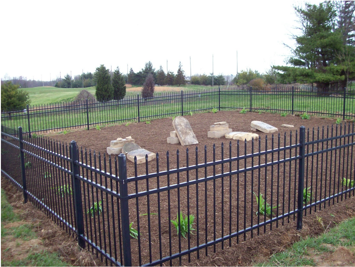
Waters Family Cemetery – Restored in 2007