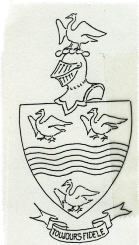
Waters Family Crest