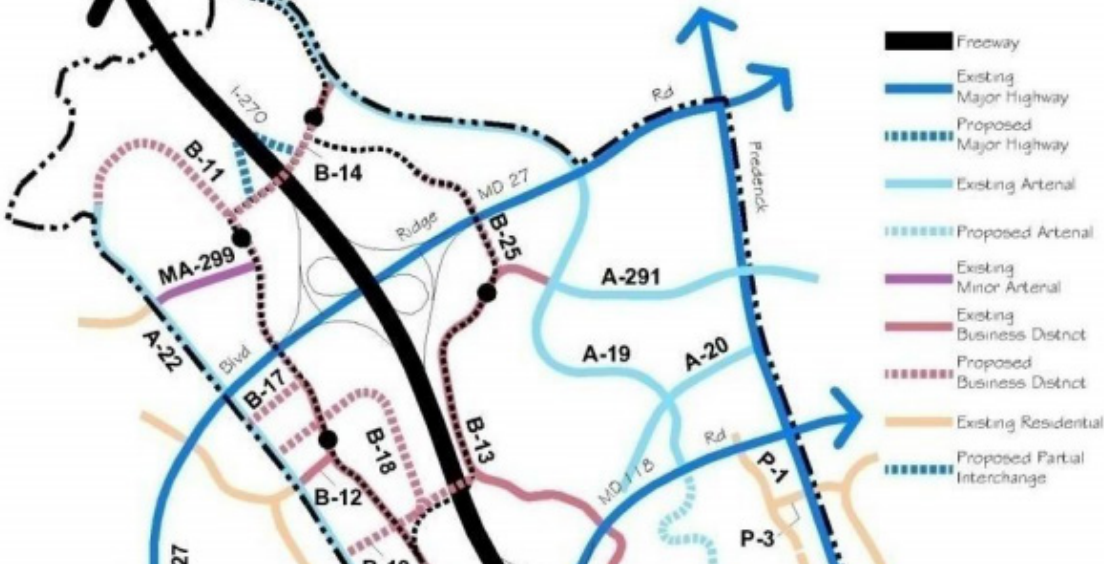
Germantown Master Plan