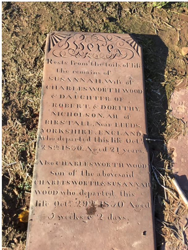
7. Seneca sandstone grave marker