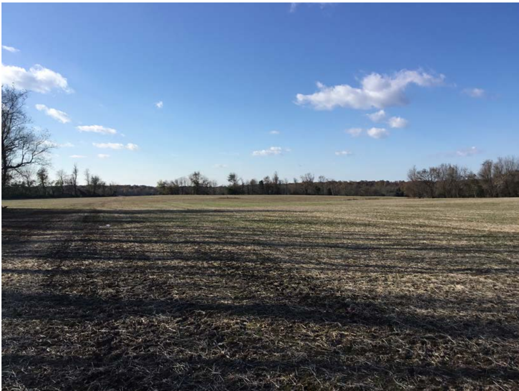
3. Continued approach to cemetery, facing south-west