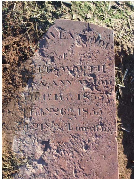
9. Seneca sandstone grave marker