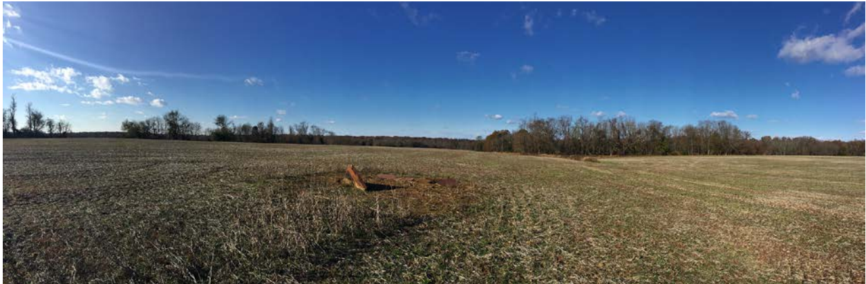
10. Panoramic from south to west to north