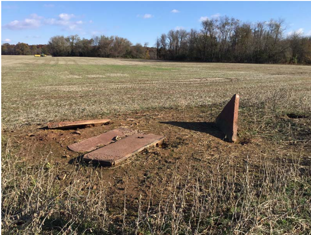
6. Cemetery, facing north