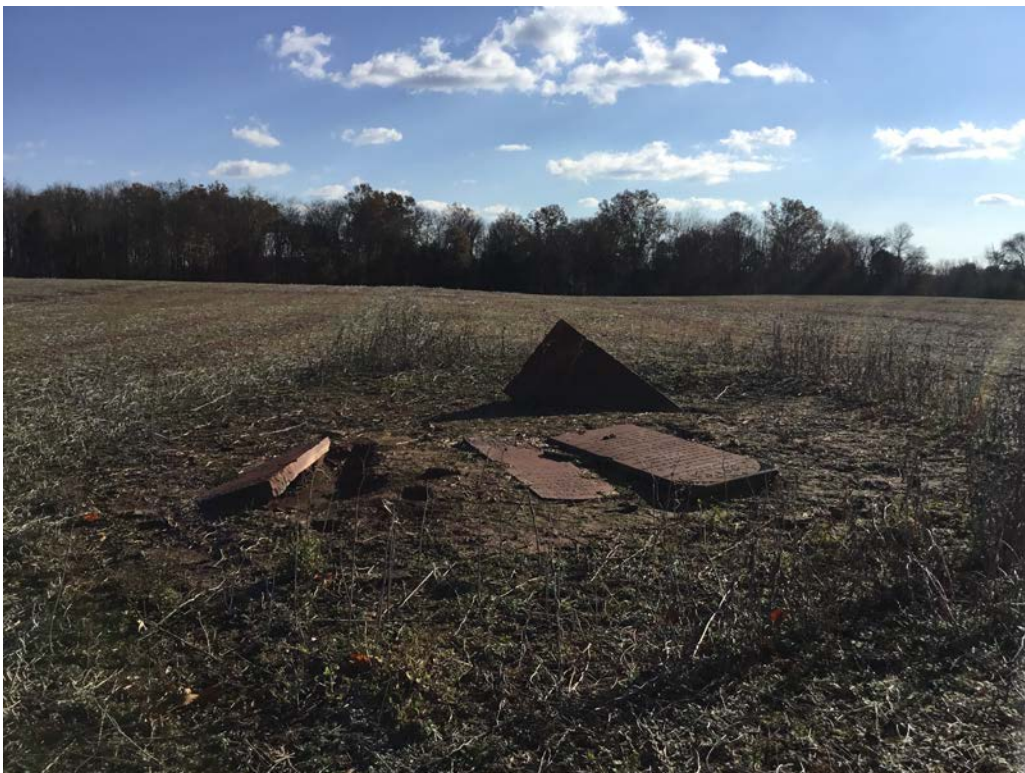
5. Cemetery, facing east