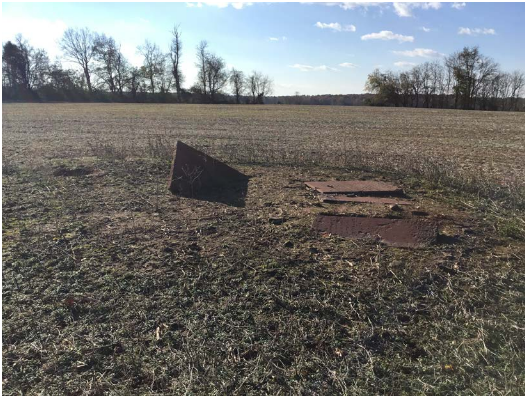
4. Initial view of cemetery, facing south