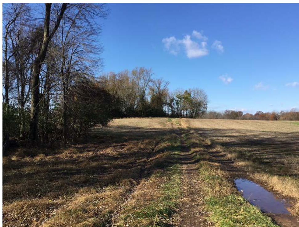
1. Approach to cemetery from parking pull-off, facing west