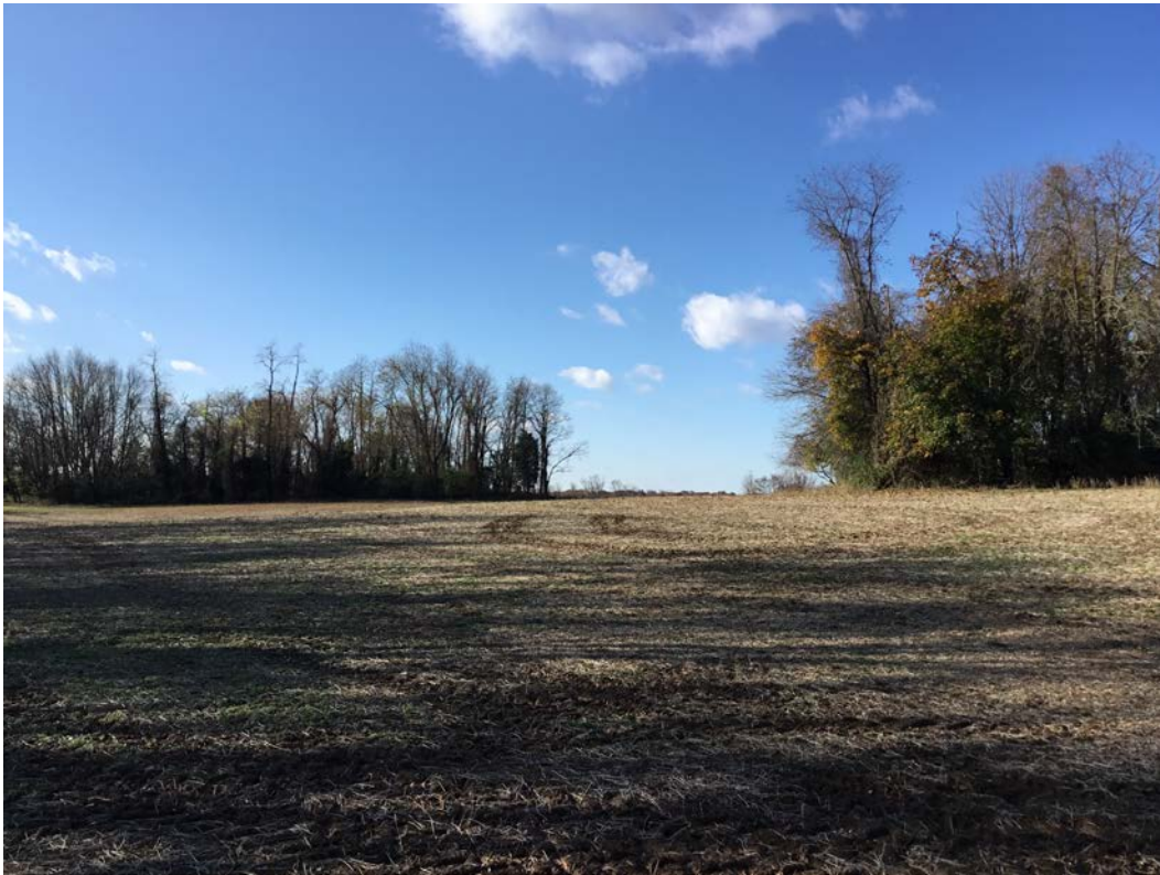
2. Continued approach to cemetery, facing south-west