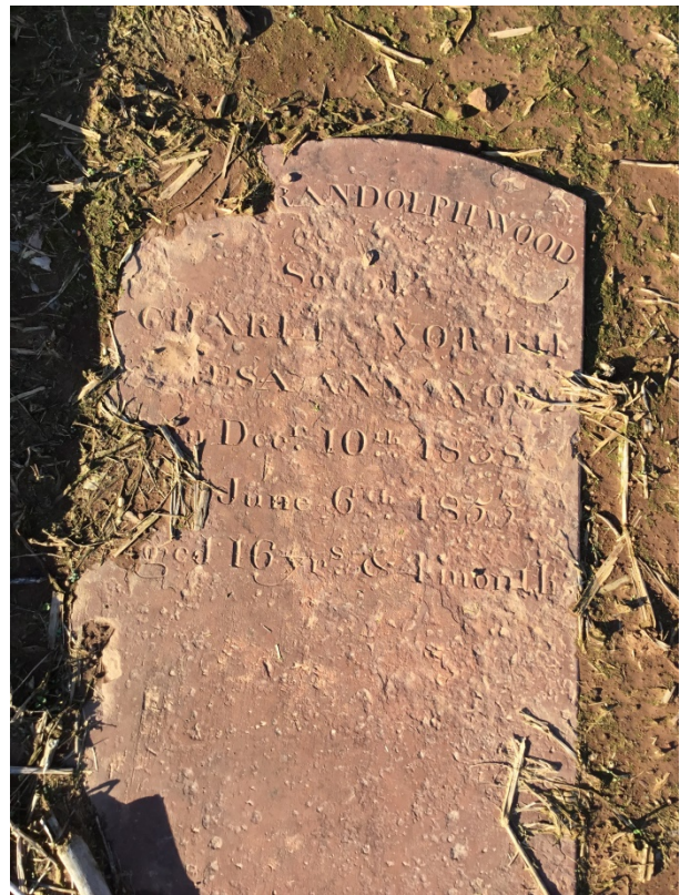
8. Seneca sandstone grave marker