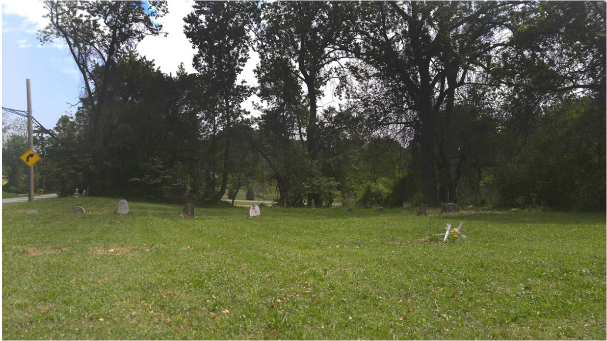
2. Center of cemetery, facing northeast