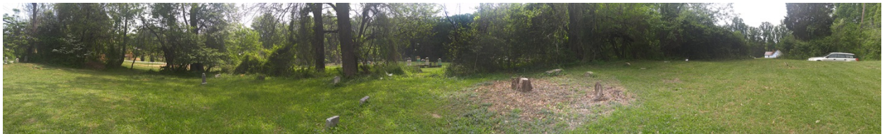
4. Panoramic from east to south to west