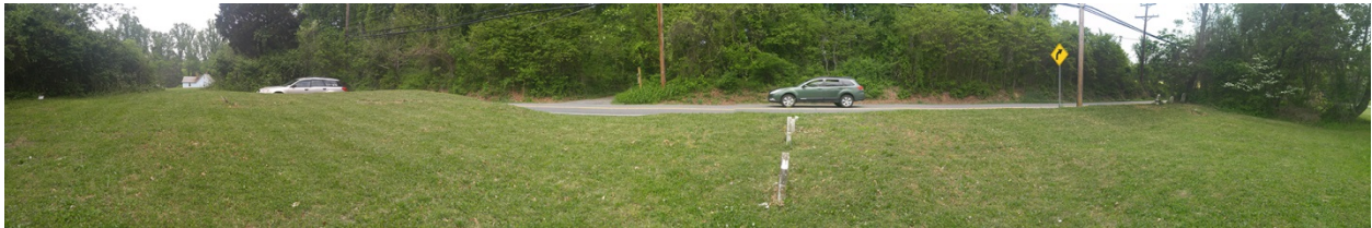
3. Panoramic from west to north to east