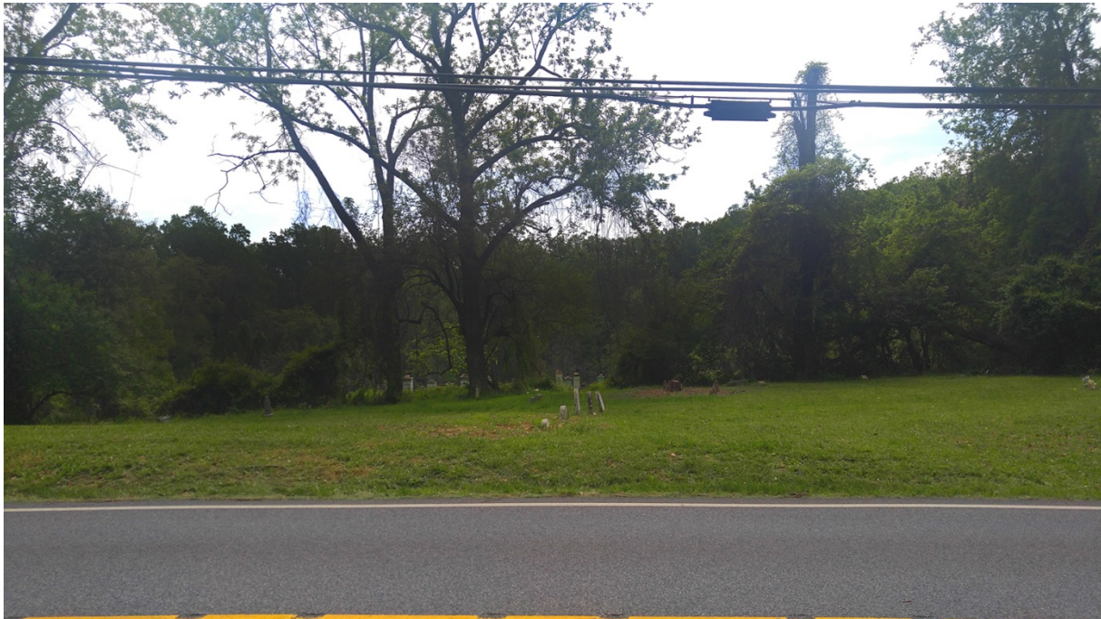
1. Cemetery from Ashton Road (Rt. 108), facing southeast