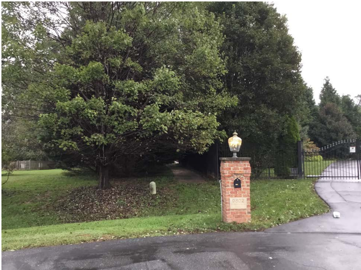
1. Approach to sidewalk at 9802 Potomac Manor Dr., facing northeast