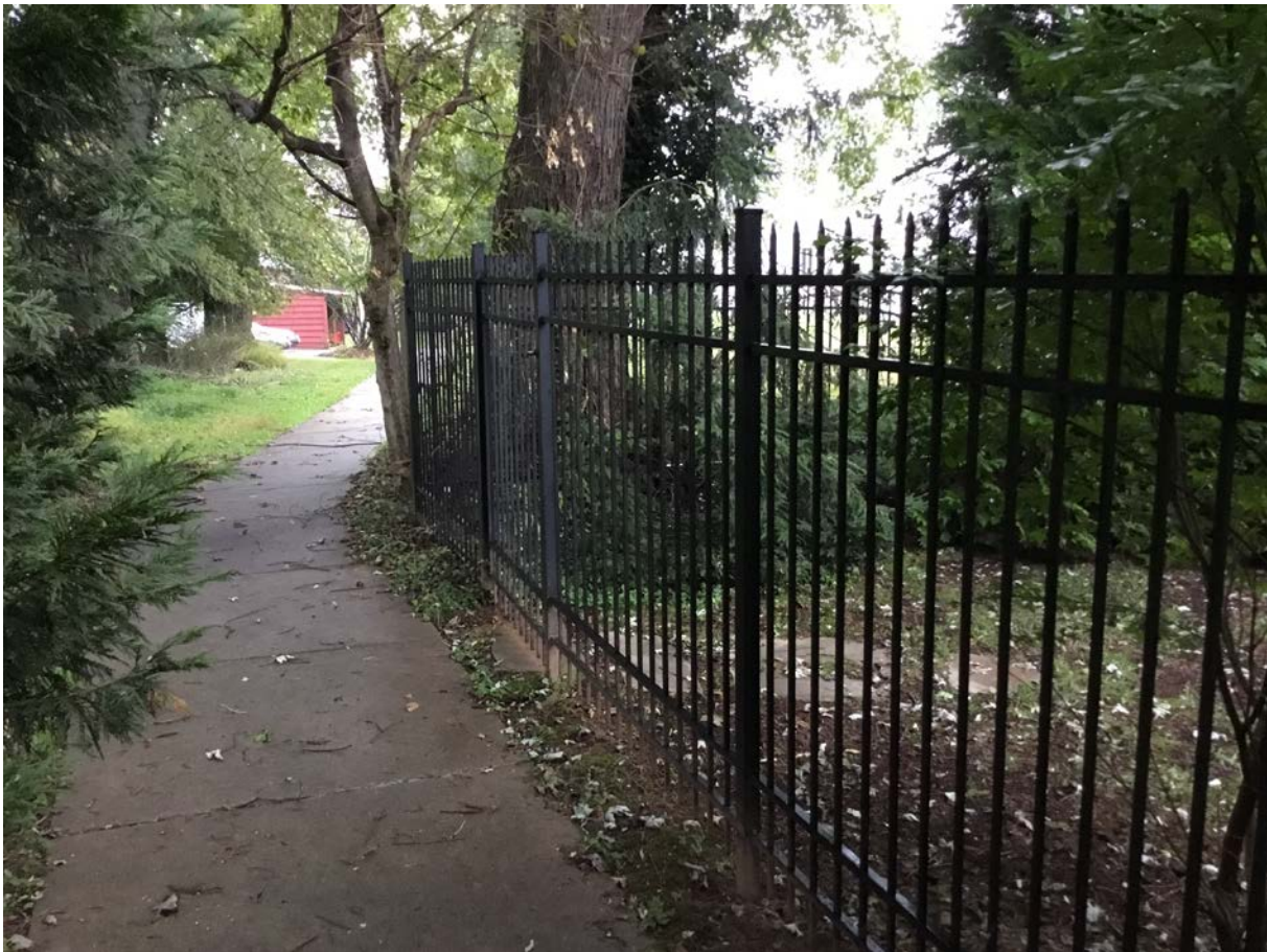
2. Approach to presumed cemetery at right, behind fence, facing northeast