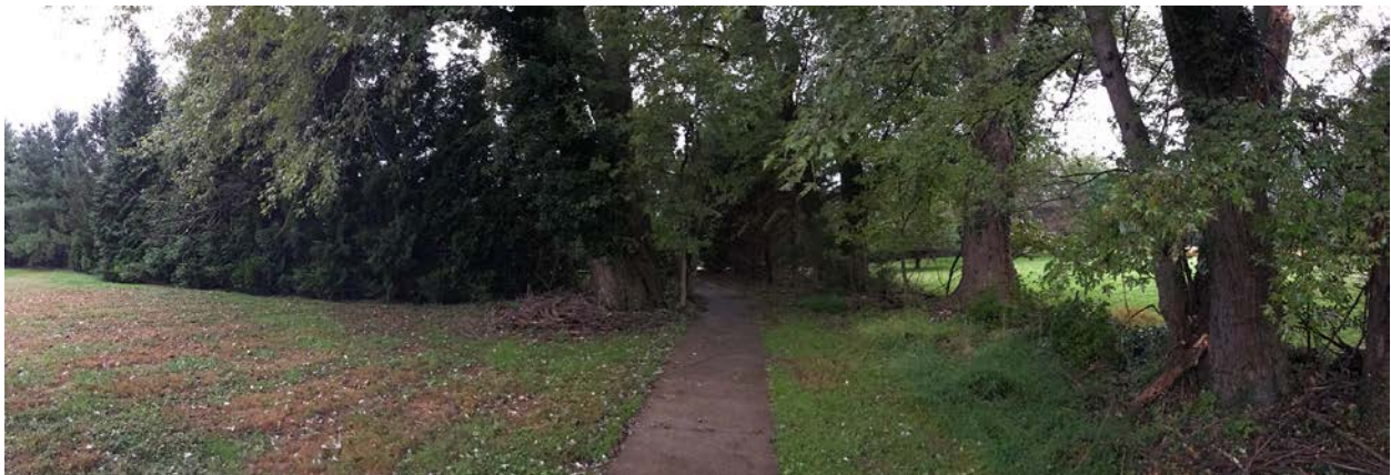
3. Reverse approach from River Road, panoramic facing southwest