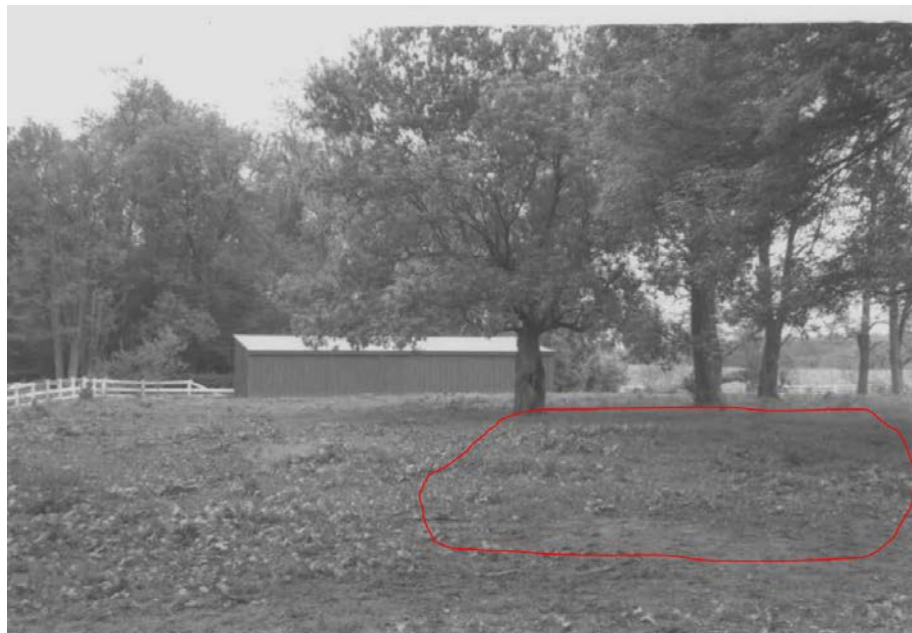
1991– Facing south from the house