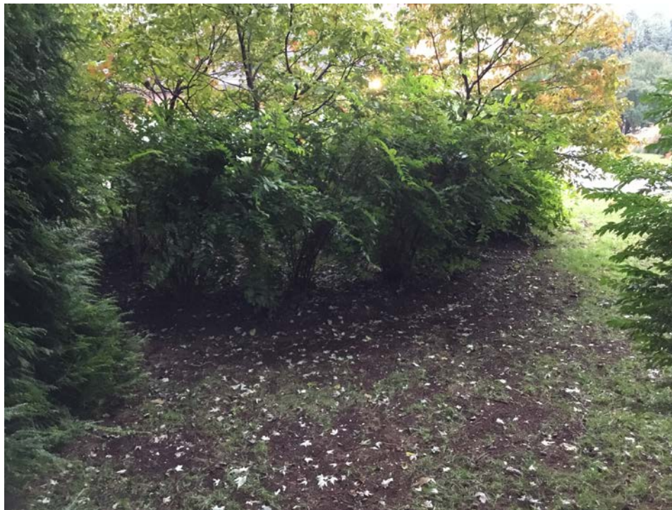
5. Cemetery over the fence at 9802 Potomac Manor Dr., facing southeast