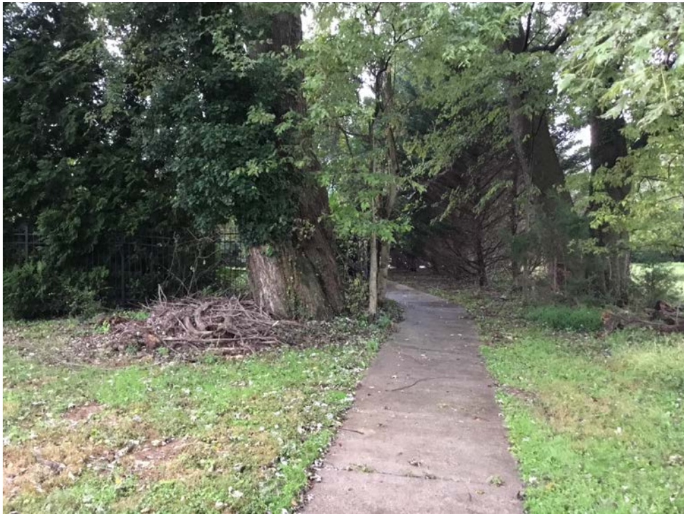
4. Huge maple tree marks the cemetery area, facing southwest