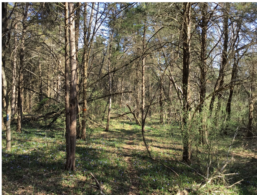
1. Approach to homestead on Orange Path