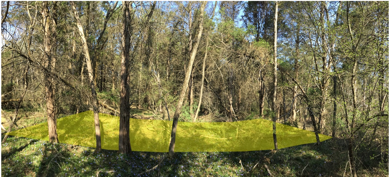
5. Panoramic from south to west to north