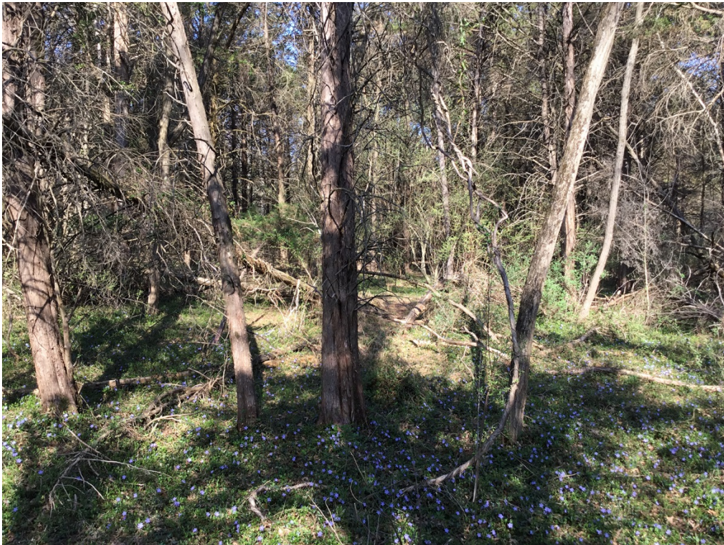
2. Center of cemetery, facing north-west