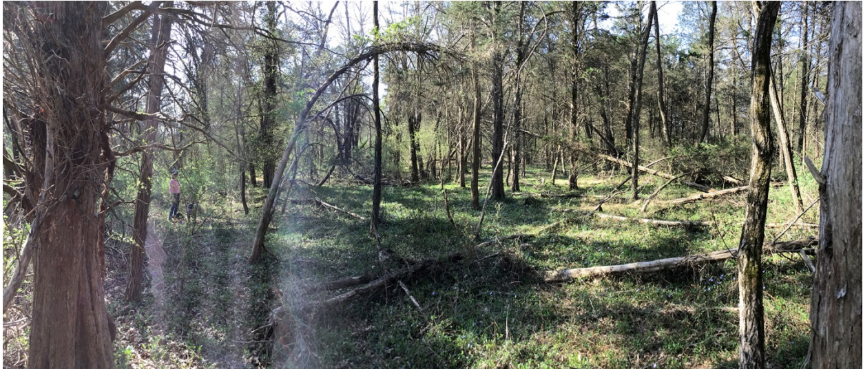
4. Panoramic from east to south to west