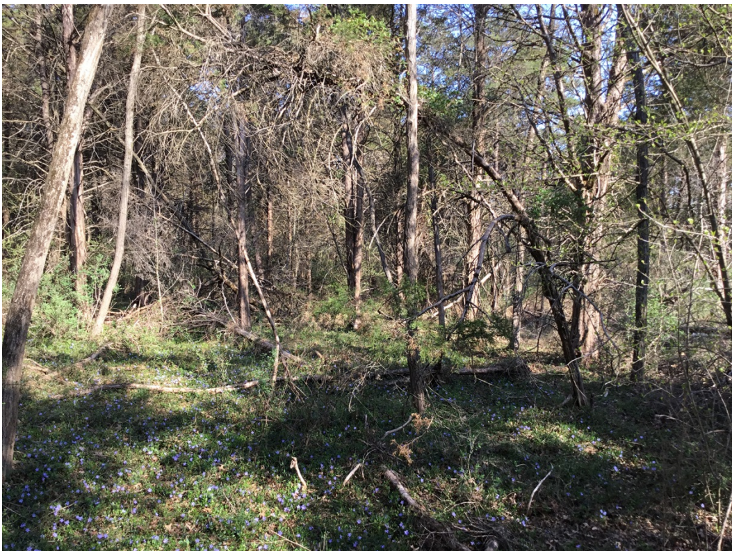
3. Center of cemetery, facing north