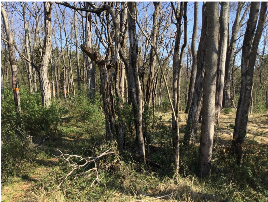
7. View toward cemetery from homestead (on right), facing north