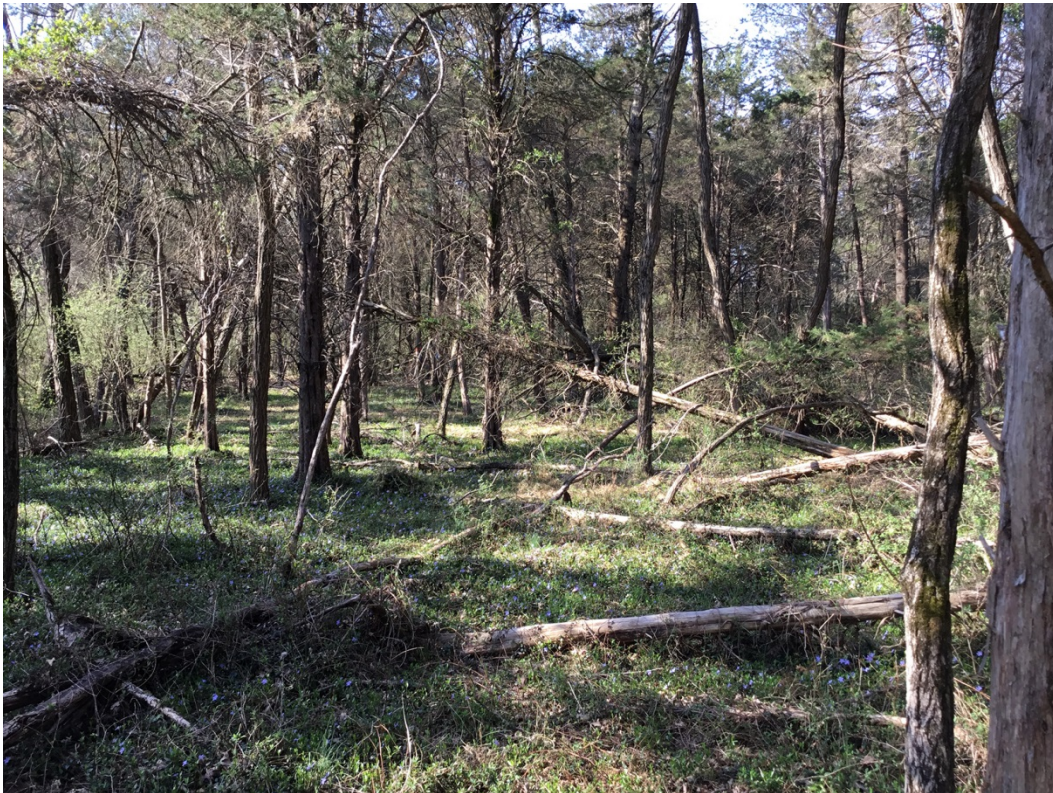
6. View toward homestead to the left, facing south