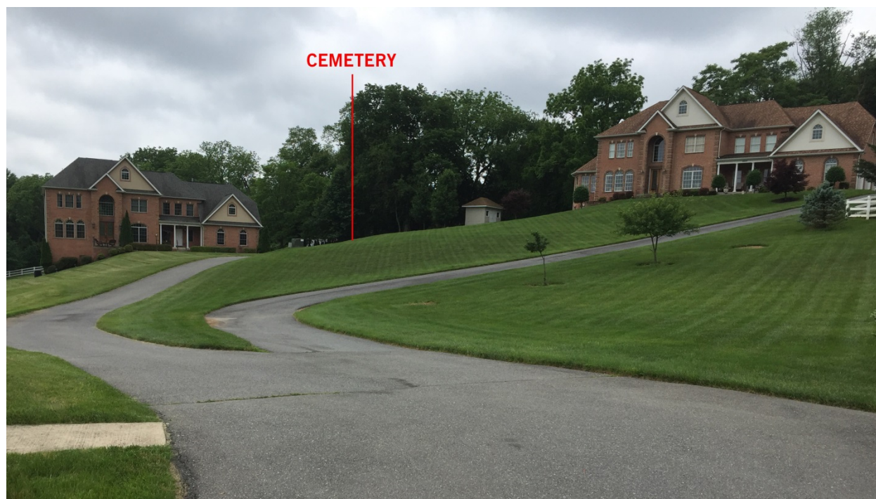
1. Approach to cemetery via 25103 Highland Manor Ct., facing south