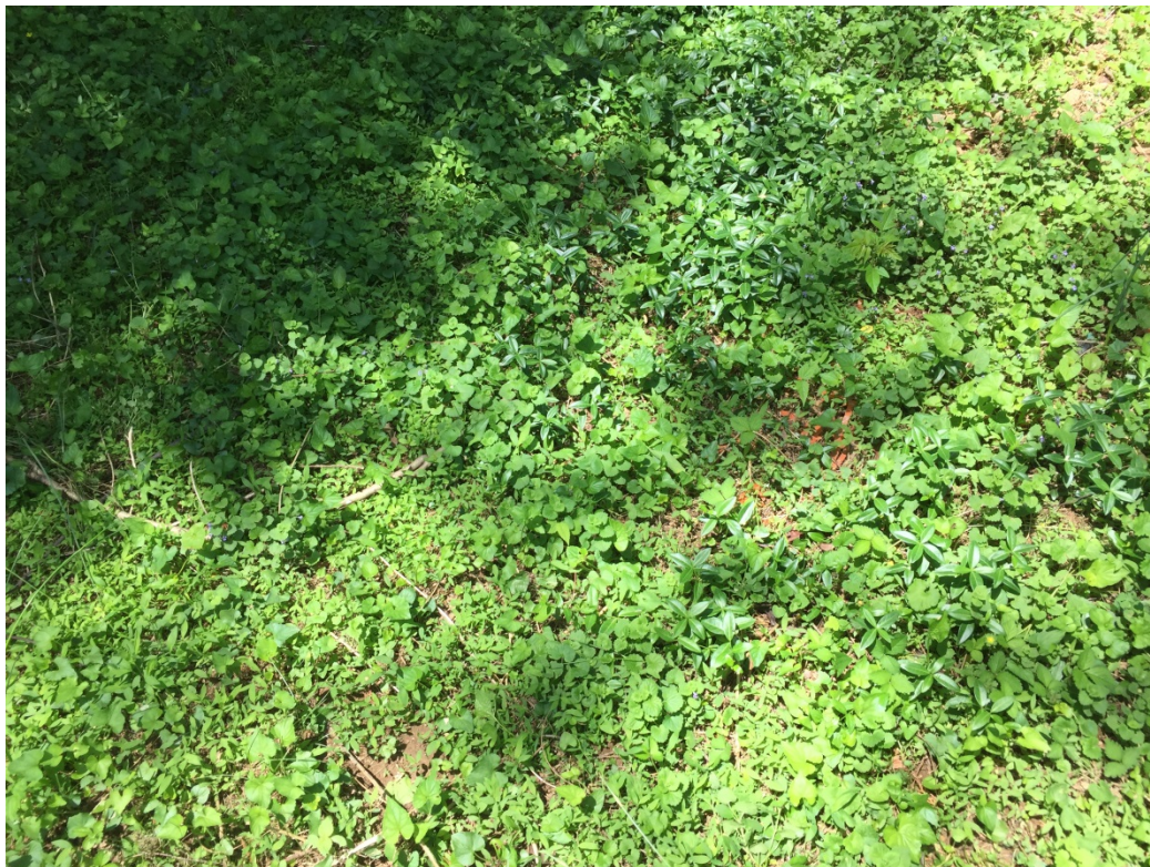
10. Vegetation, including vinca