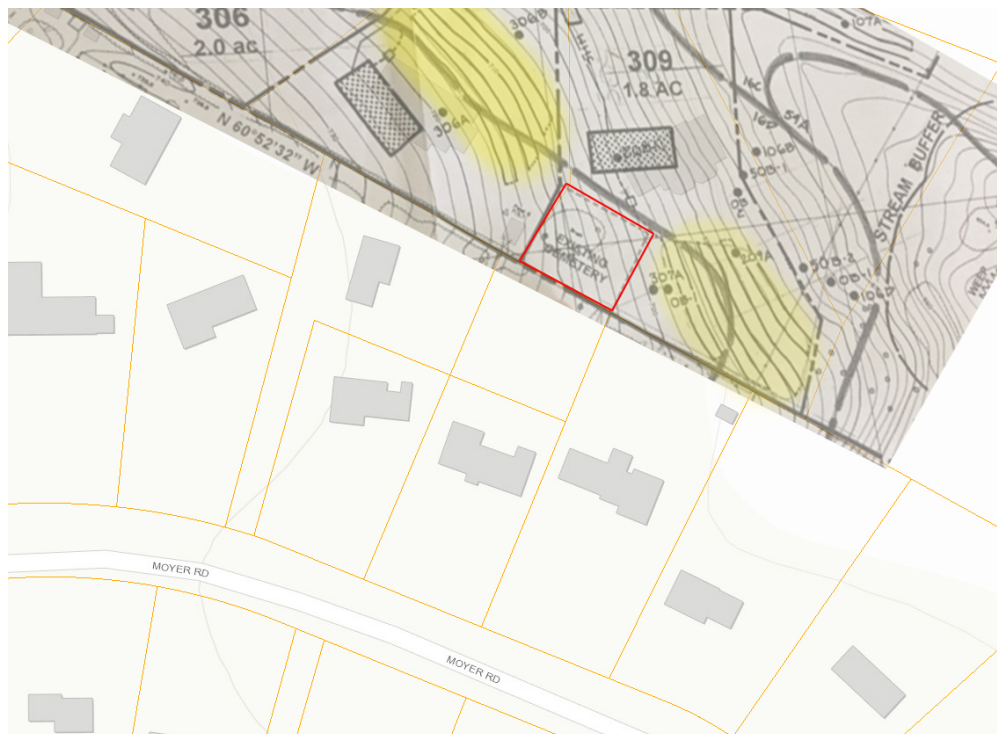
Developer's site plan showing existing cemetery (2001)