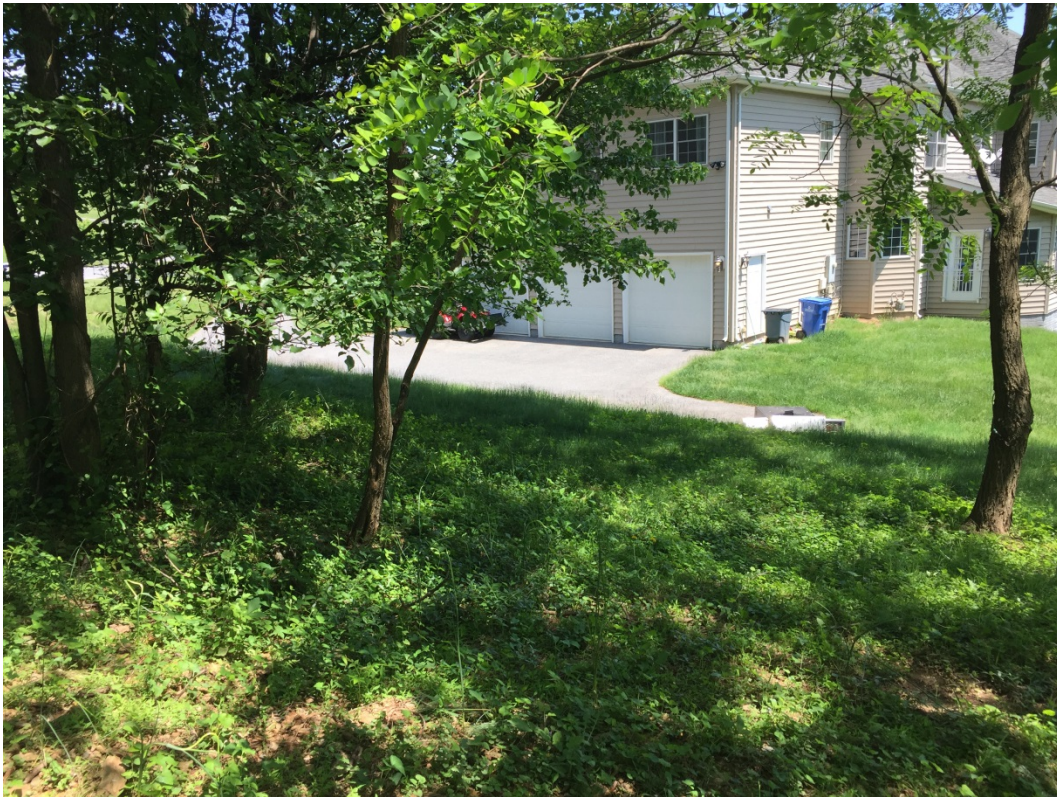
7. Cemetery facing north-east