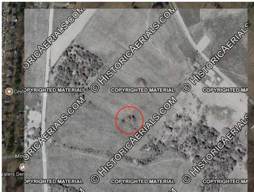
Aerial photograph – Cemetery in red circle (1957)