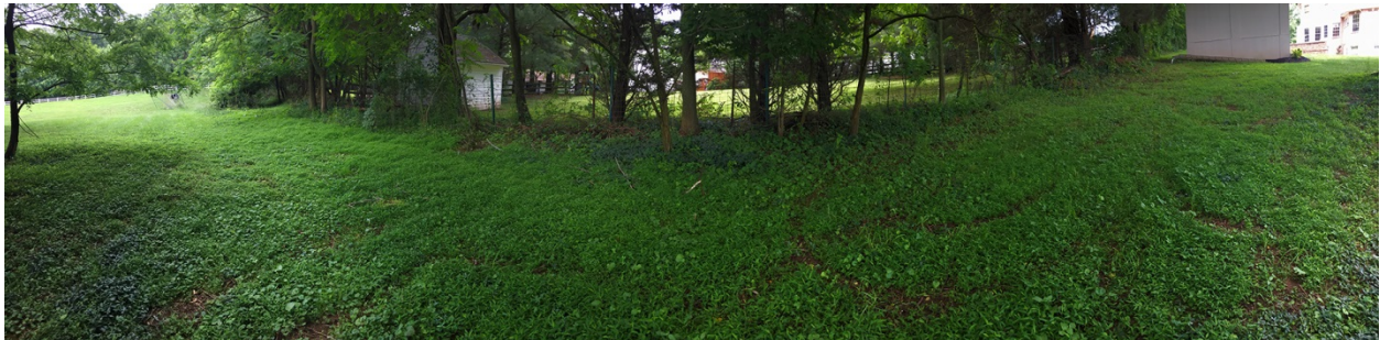
5. Panoramic from east to south to west