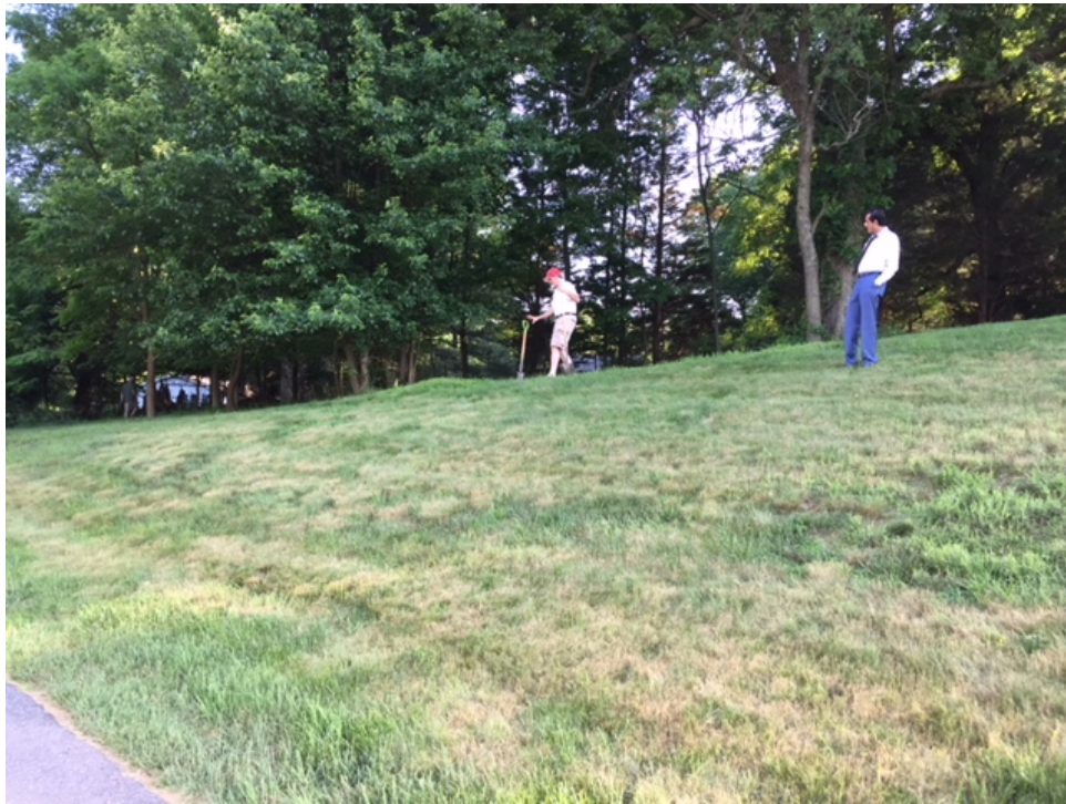
2. Cemetery from driveway at 25103 Highland Manor Ct., facing south