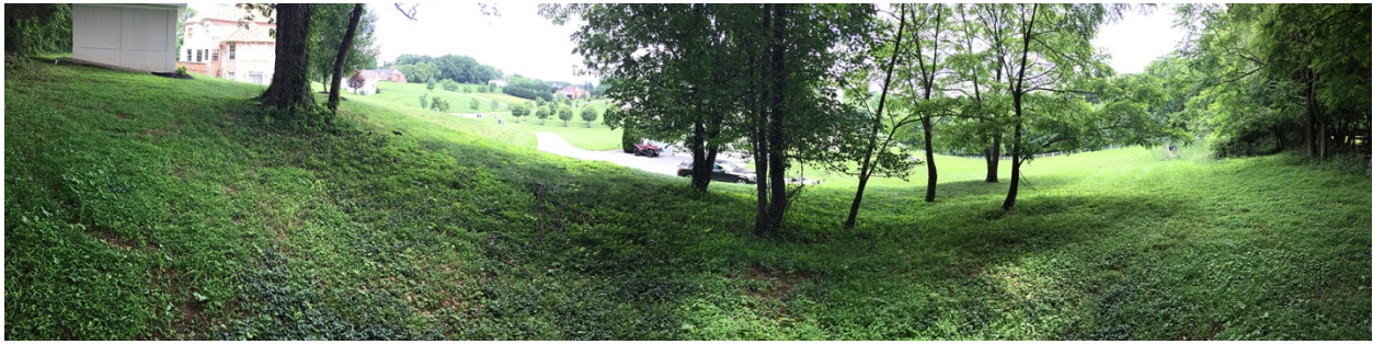
4. Panoramic from west to north to east