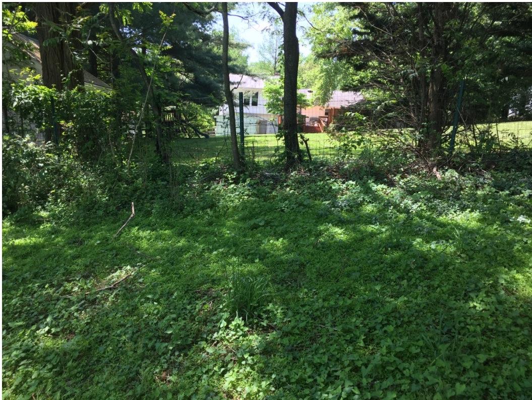
6. Cemetery toward back of 9825 Moyer Road, facing south