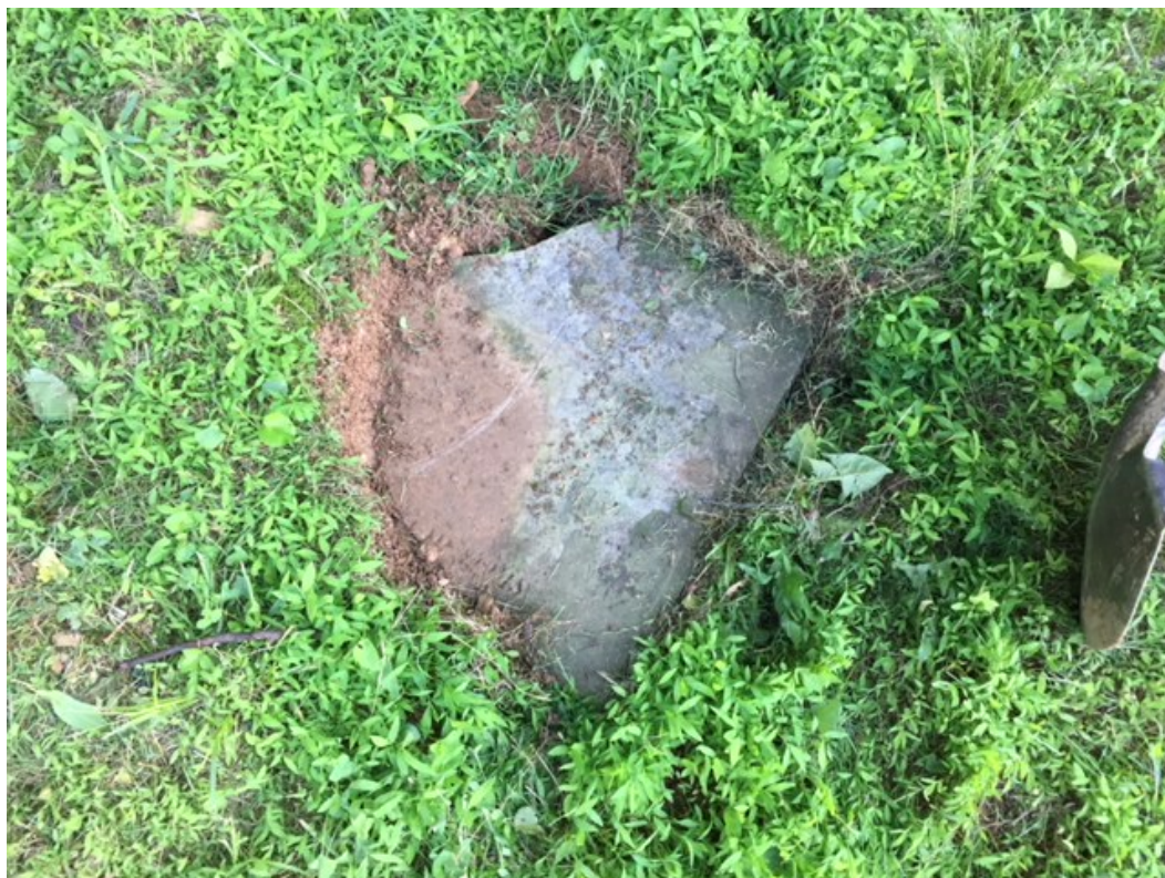
8. Field stone grave marker