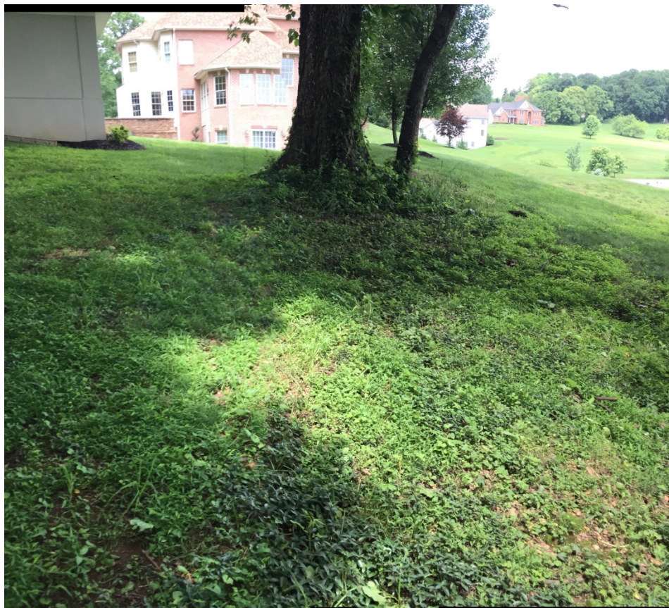
3. Cemetery facing west