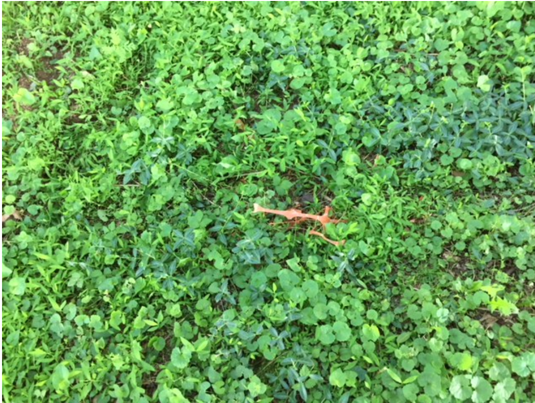
9. Former plastic perimeter fence used by development in 2001