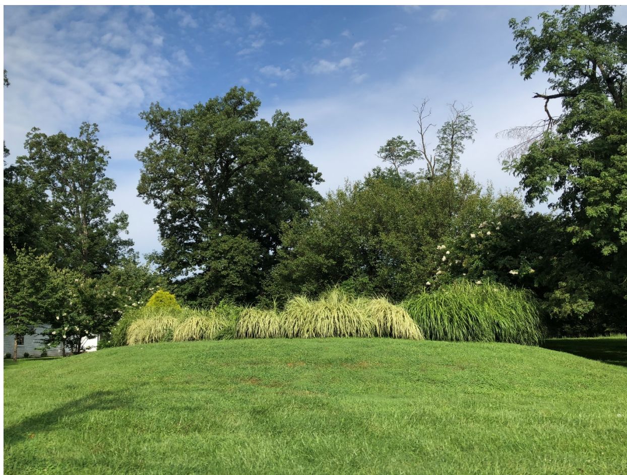
1. View of memorial garden from New Hampshire Ave., facing west