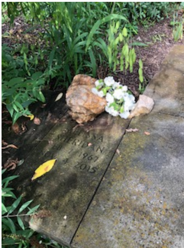
5. Detail of etched cap stones, some with etched names and dates