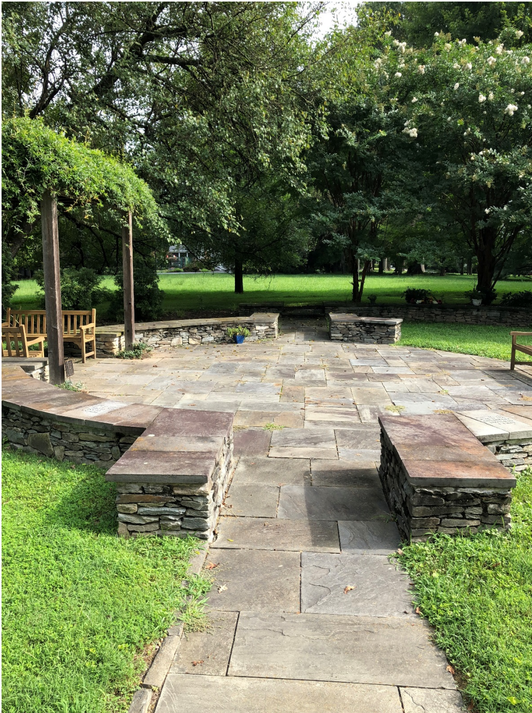
3. Memorial garden patio, facing north