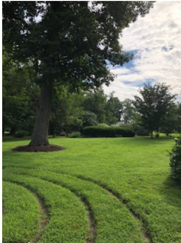
4. Labyrinth, looking toward memorial garden