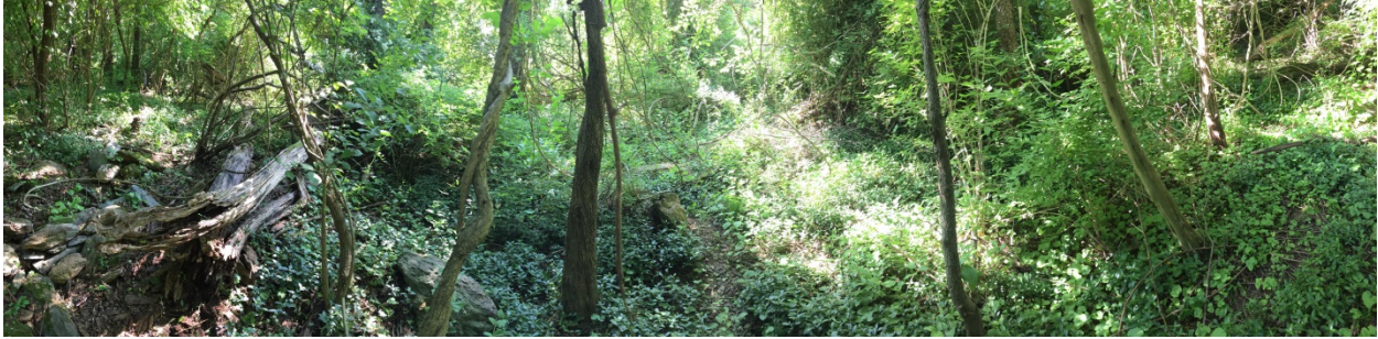
6. Panoramic from west to north to east