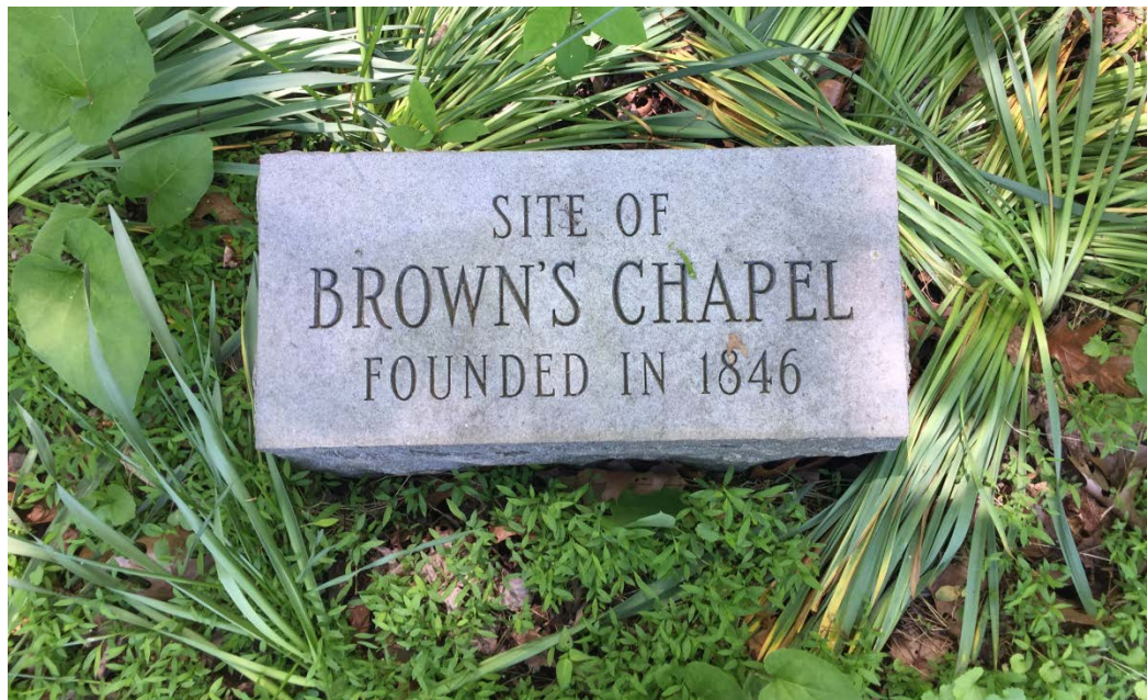
3. Church stone marker