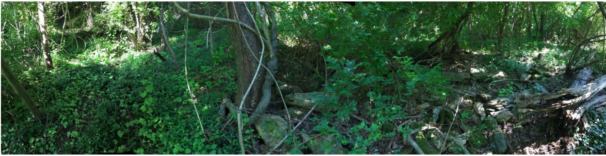
7. Panoramic from east to south to west