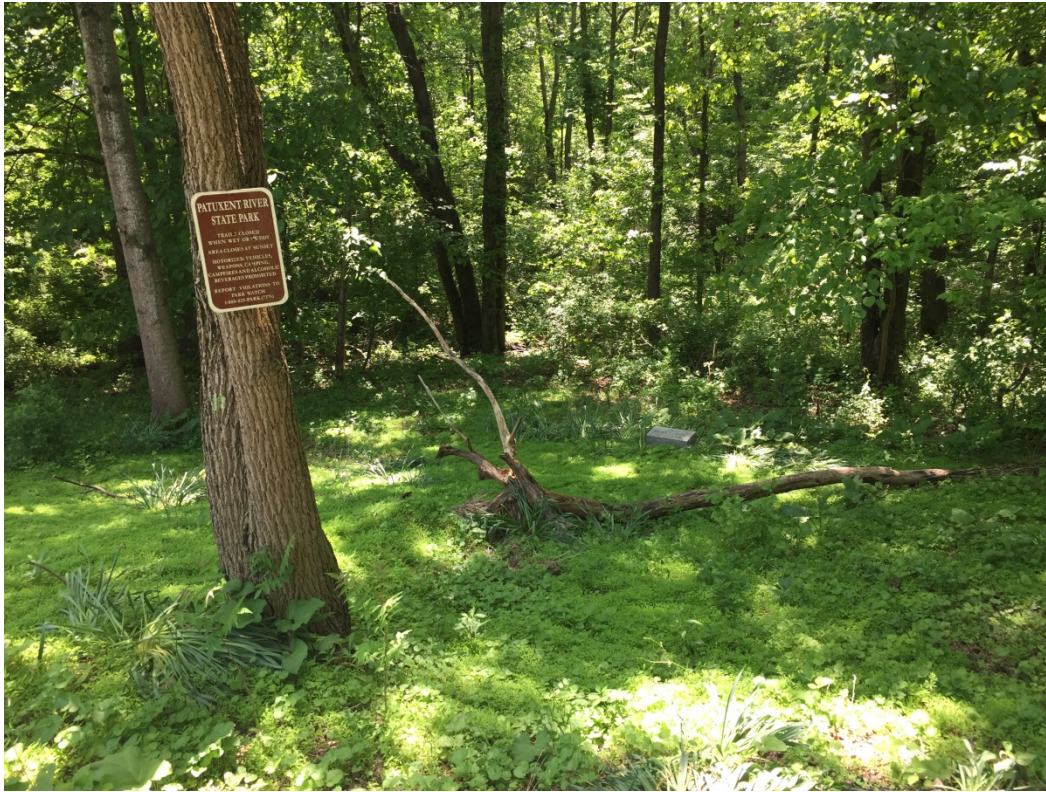
2. Park sign and church stone marker