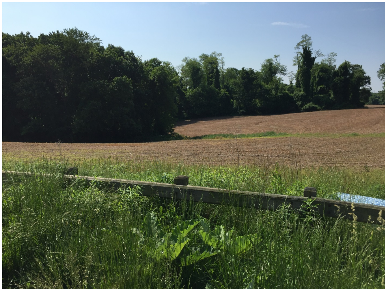
1. Approach to cemetery on Brown Church Rd., facing south