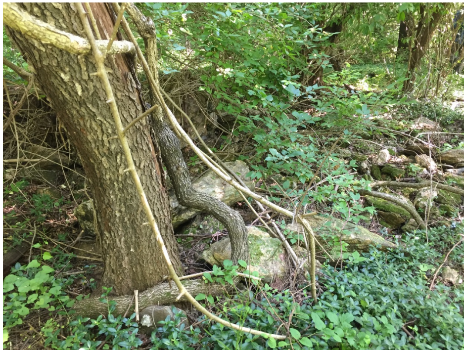
5. Piles of field stones