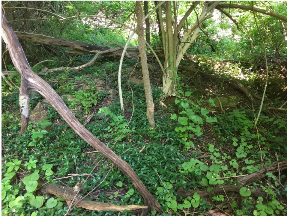
4. Cemetery with vinca and periwinkle