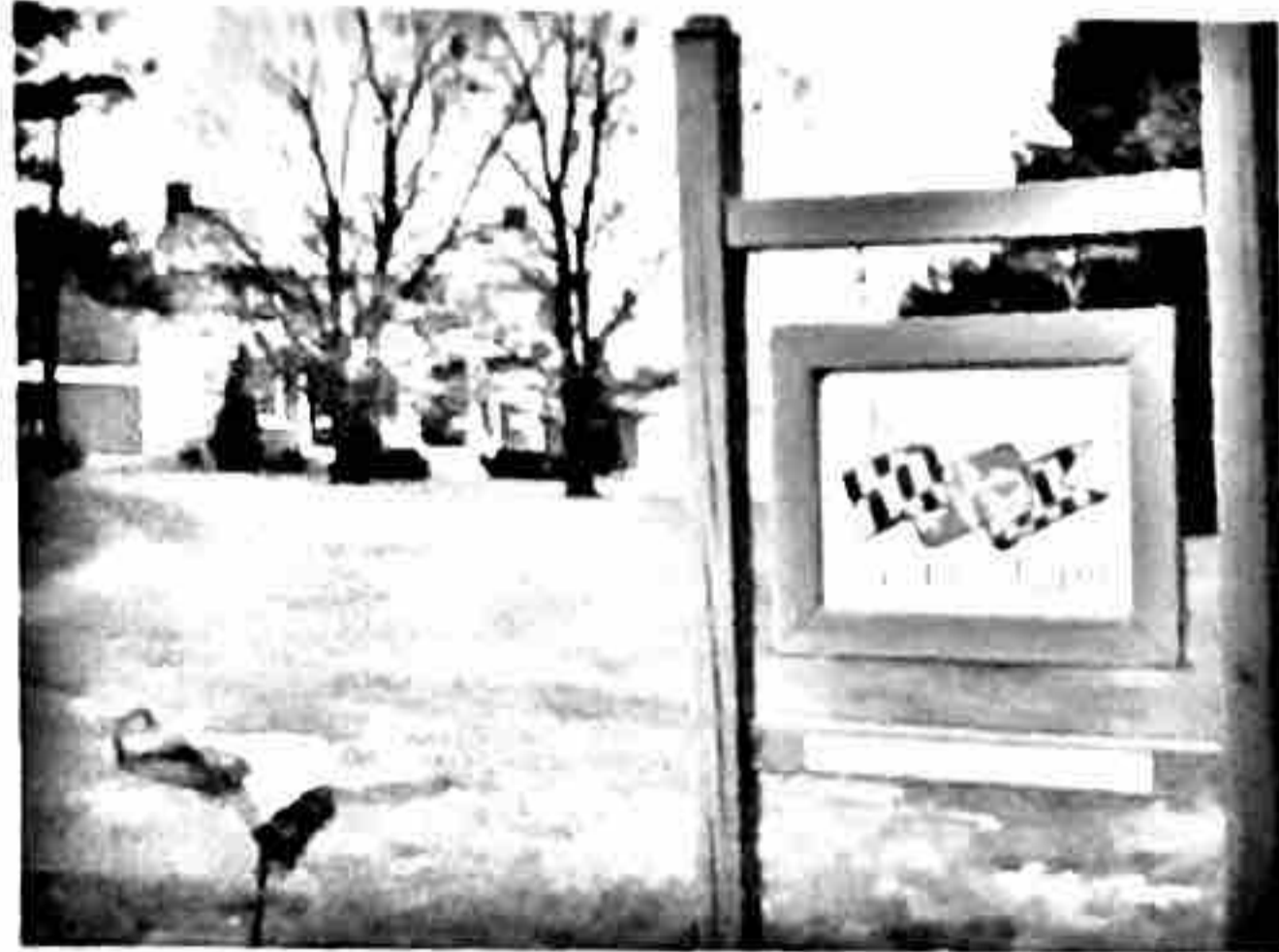
Farmhouse and sign 164-01.JPG

289 GRIFFITH FAMILY CEMETERY 5501 GRIFFITH ROAD LAYTONSVILLE