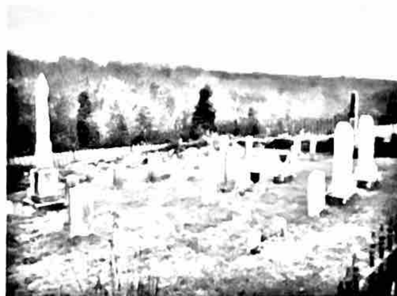
View from northwest corner of cemetery 164-04.JPG