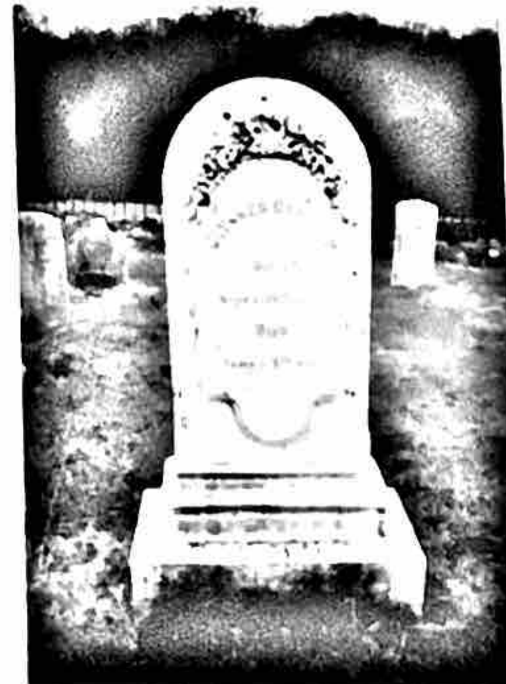
"Ulysses Griffith" marker (family patriarch) 164-08.JPG