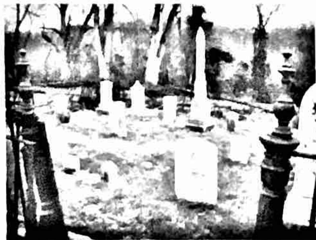
Markers seen through opening in iron fence 164-05.JPG