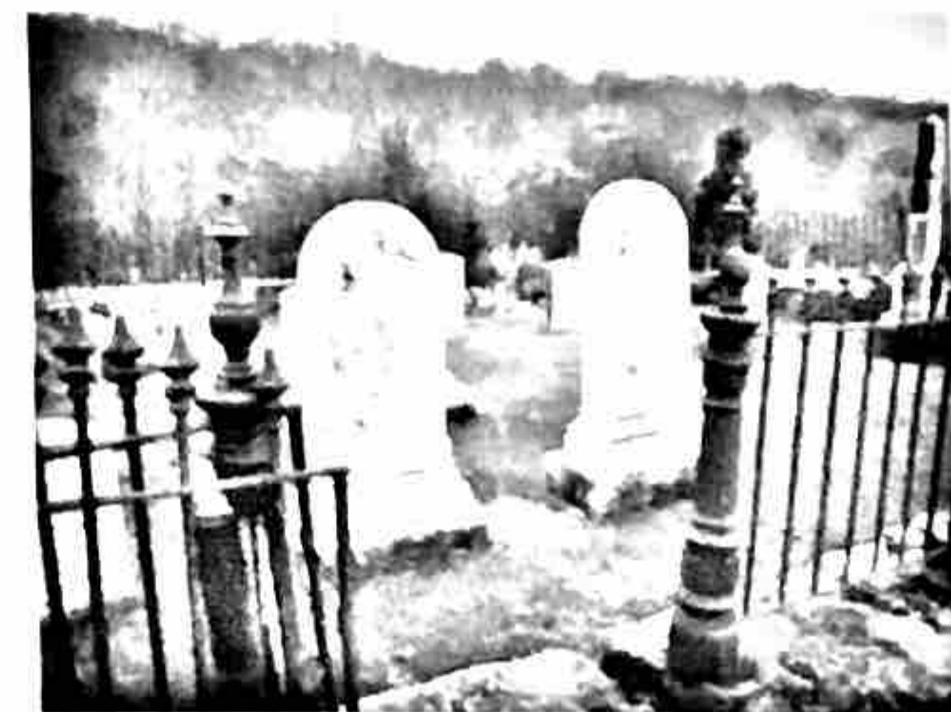
"Griffith" markers 164-06.JPG