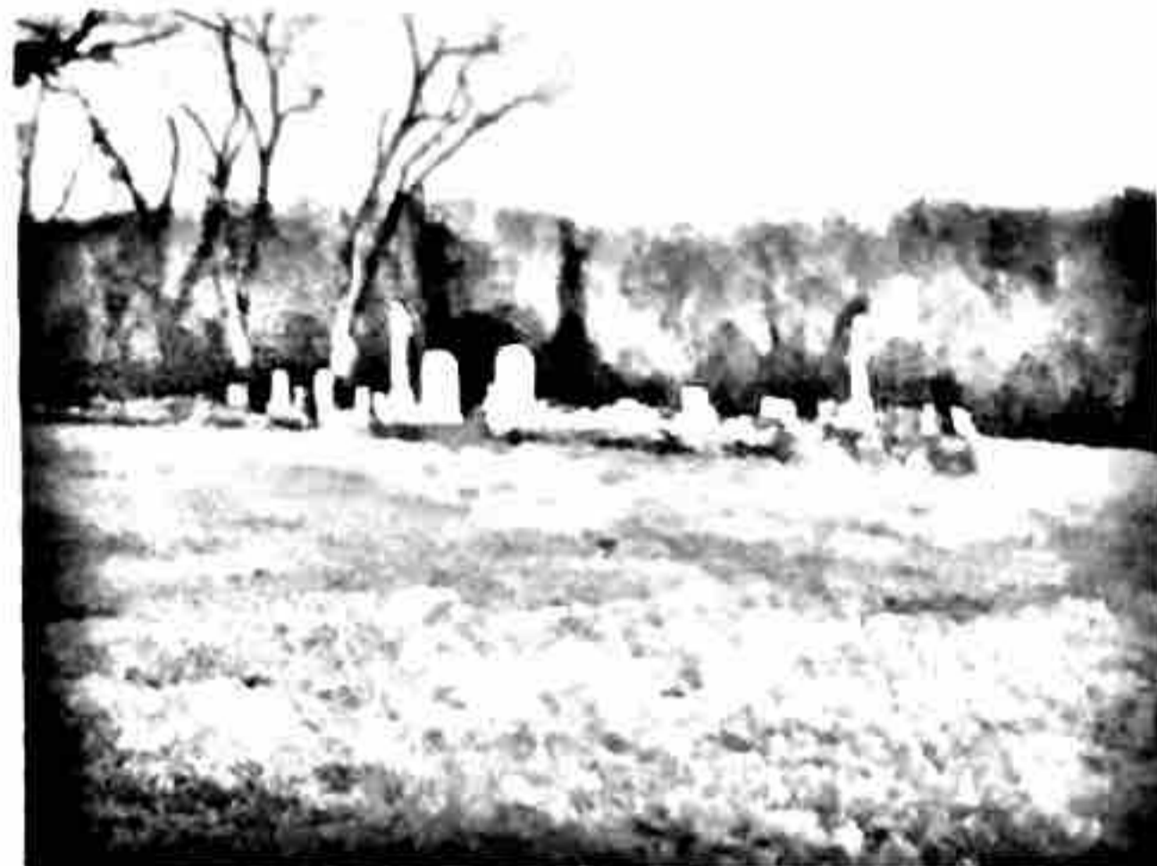
View of cemetery, looking east 164-02.JPG