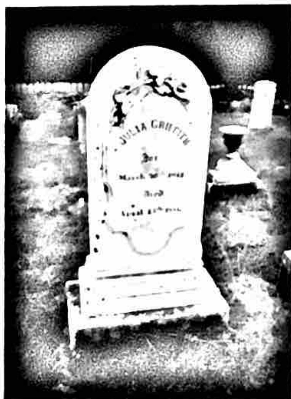
"Julia Griffith" marker (family matriarch) 164-07.JPG