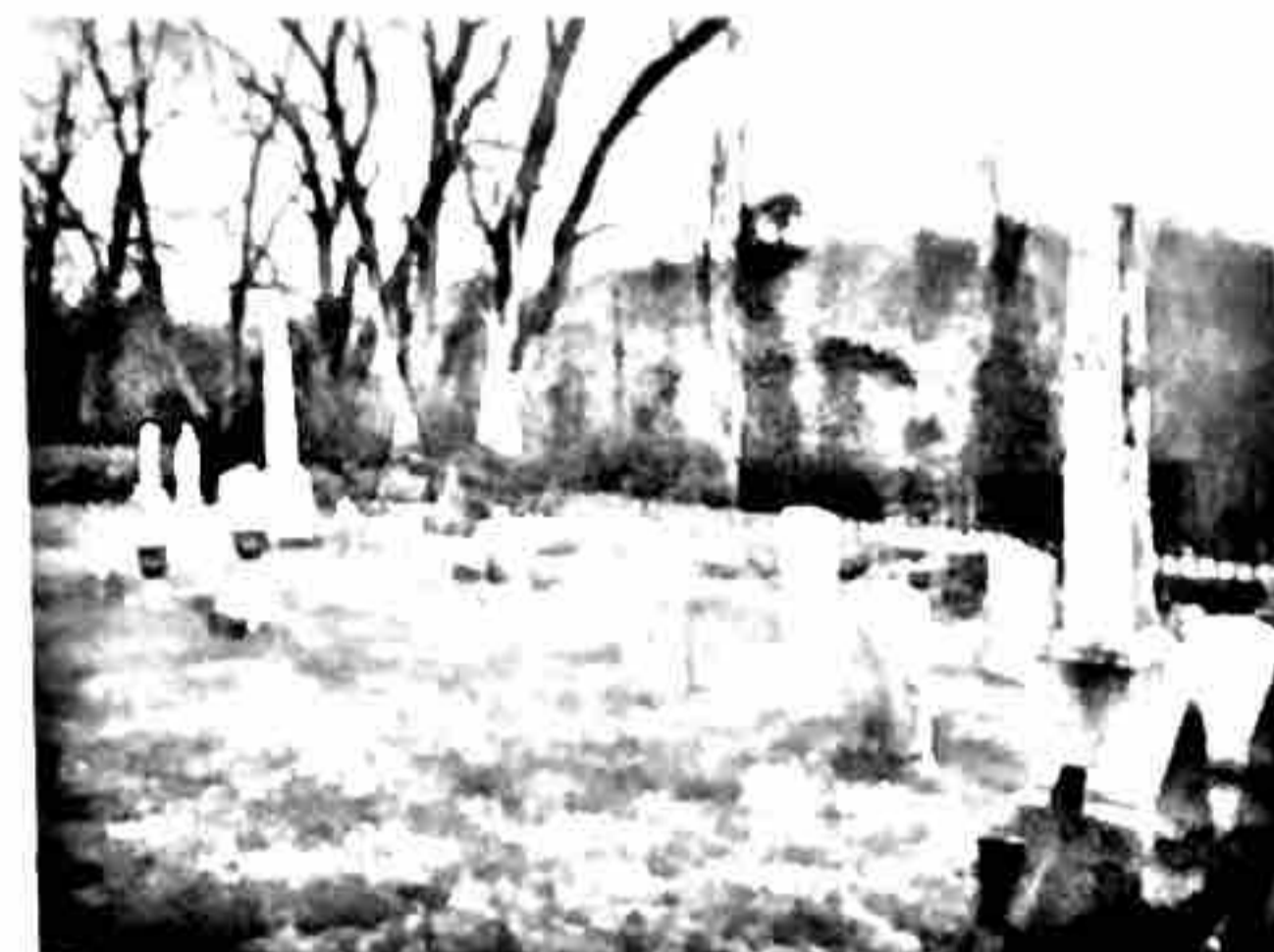
View from southwest corner of cemetery 164-03.JPG