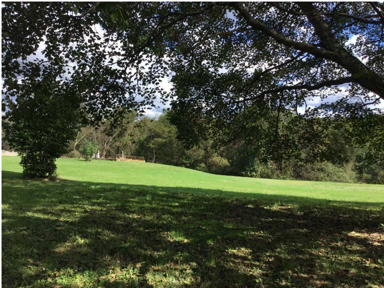
1. Initial view of cemetery from driveway, facing north