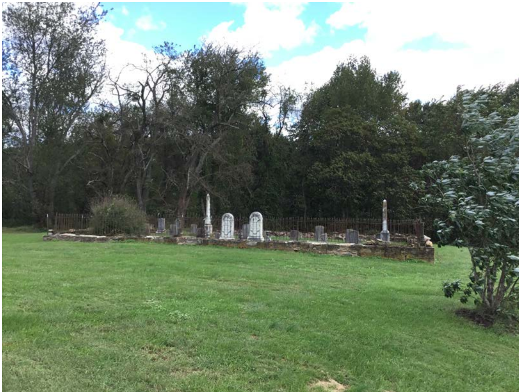
3. Approach to cemetery, facing east