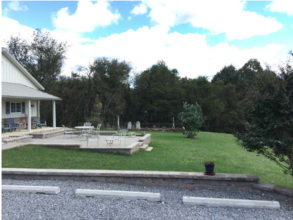
2. View toward cemetery from residence, facing east