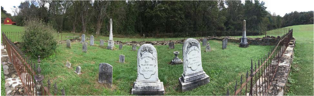
4. Panoramic from north to east to south