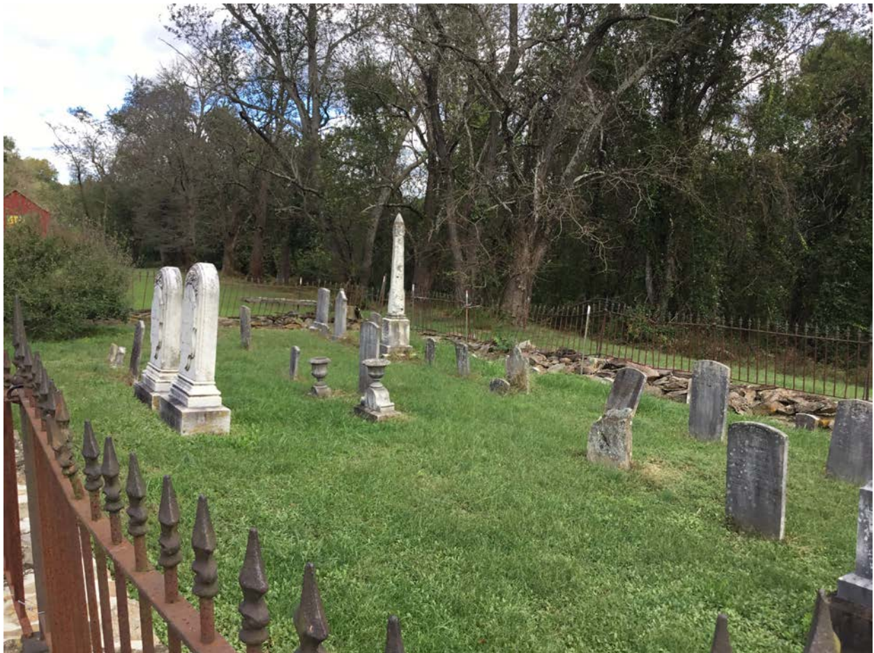
5. Cemetery from southwest corner, facing north