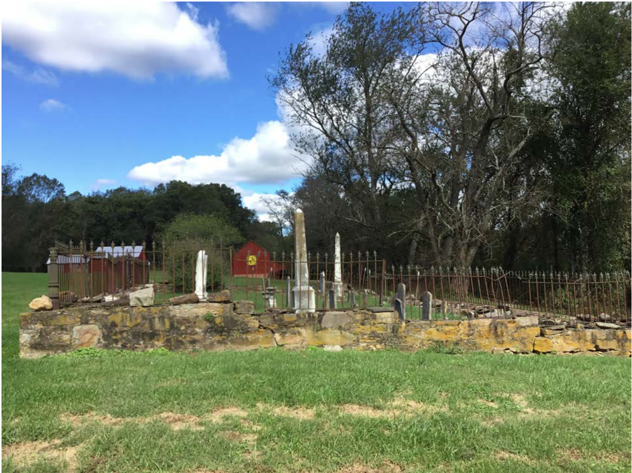
6. South end of cemetery, facing north