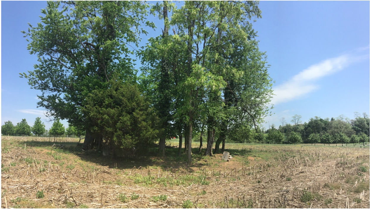
4. Panoramic from west to north to east