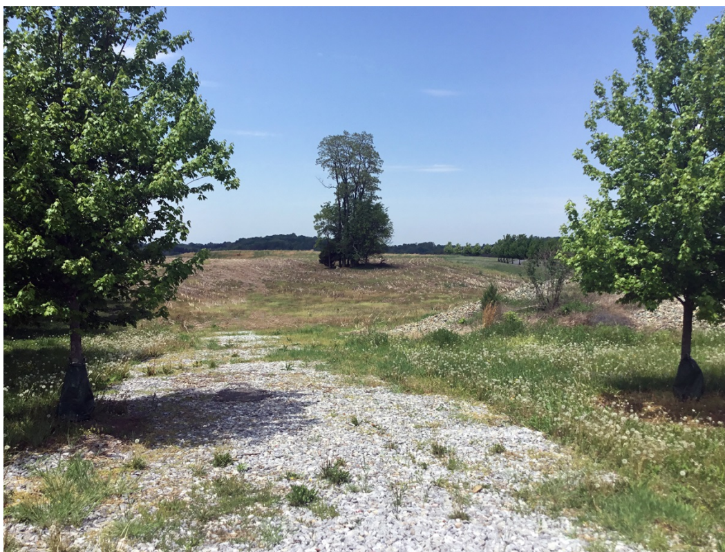
1. View to cemetery from Purdum Road, facing west