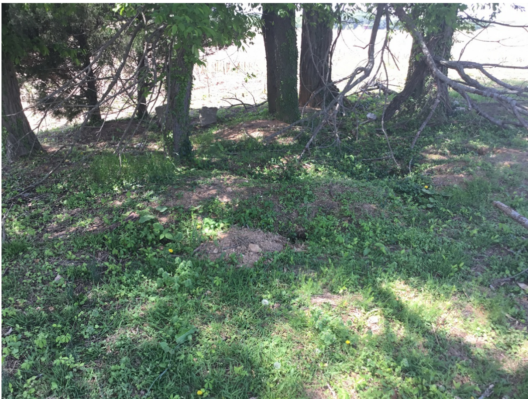
3. View to center of cemetery, facing south