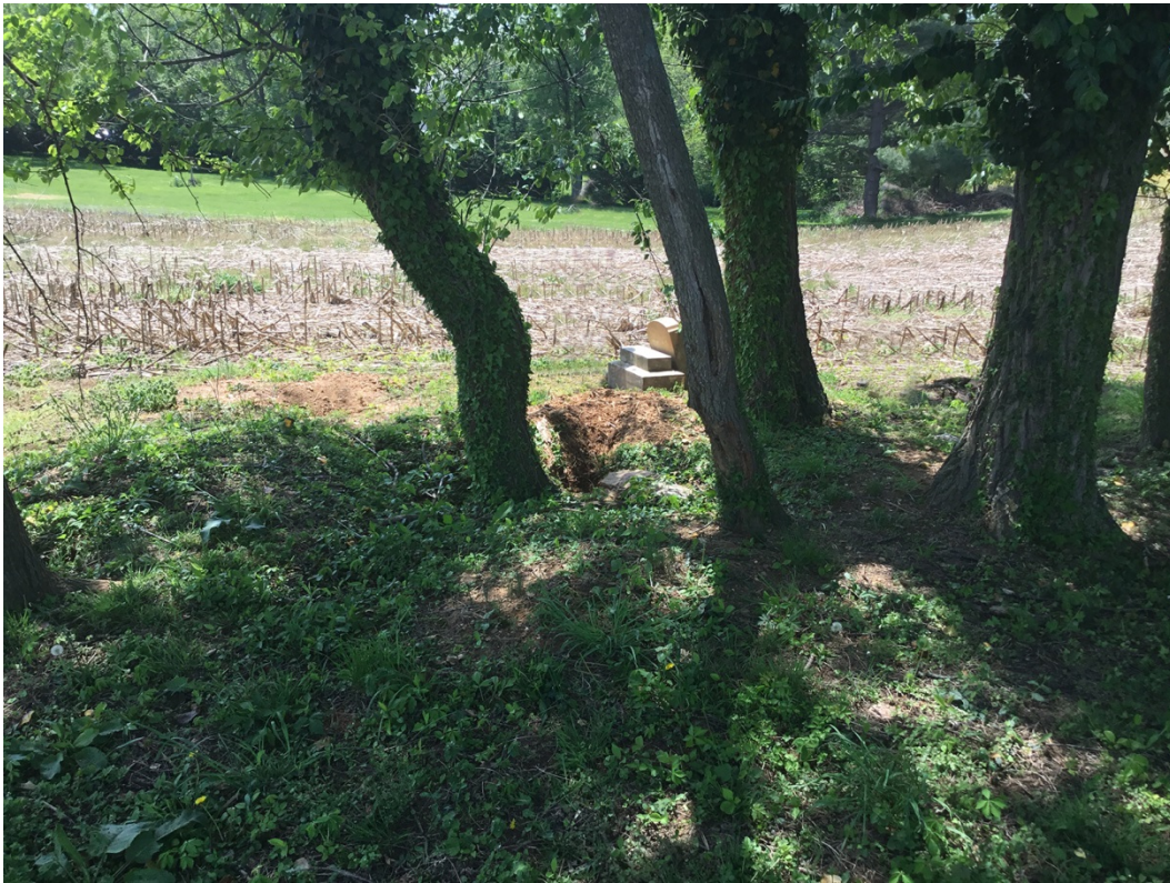
2. View to center of cemetery, facing south