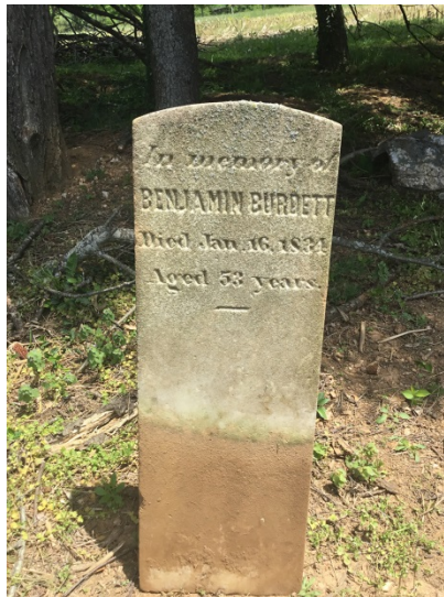
6. Benjamin Burdett gravestone