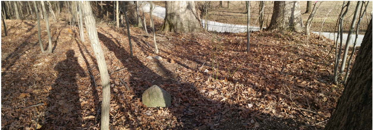
2. Panoramic from east to south to west