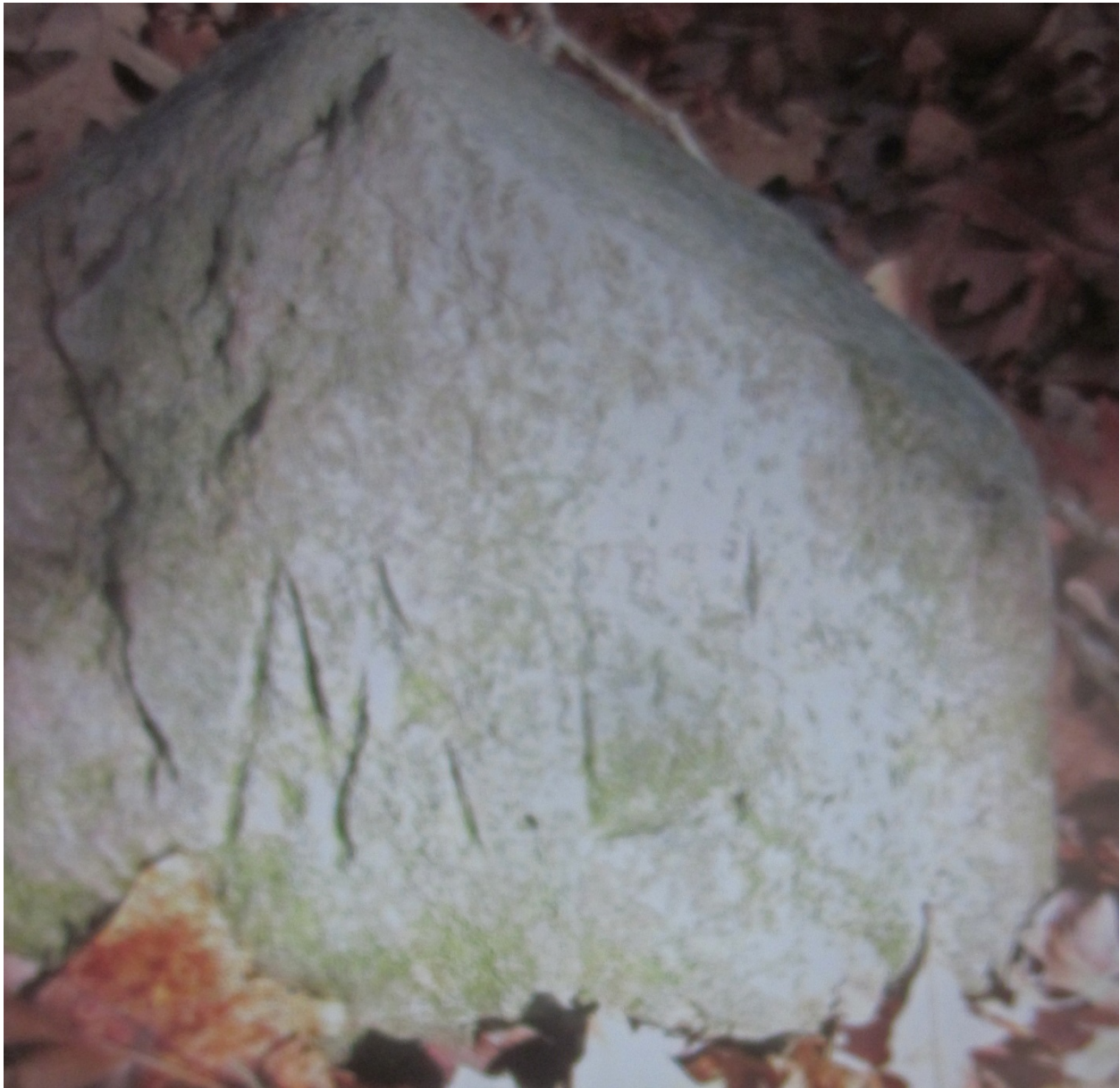
4. Side 2 of gravestone