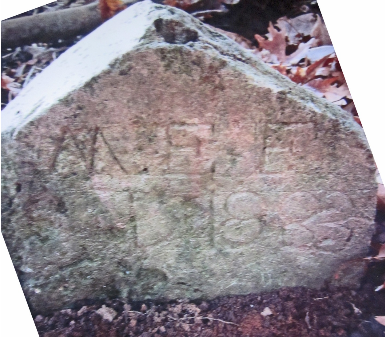
3. Side 1 of gravestone