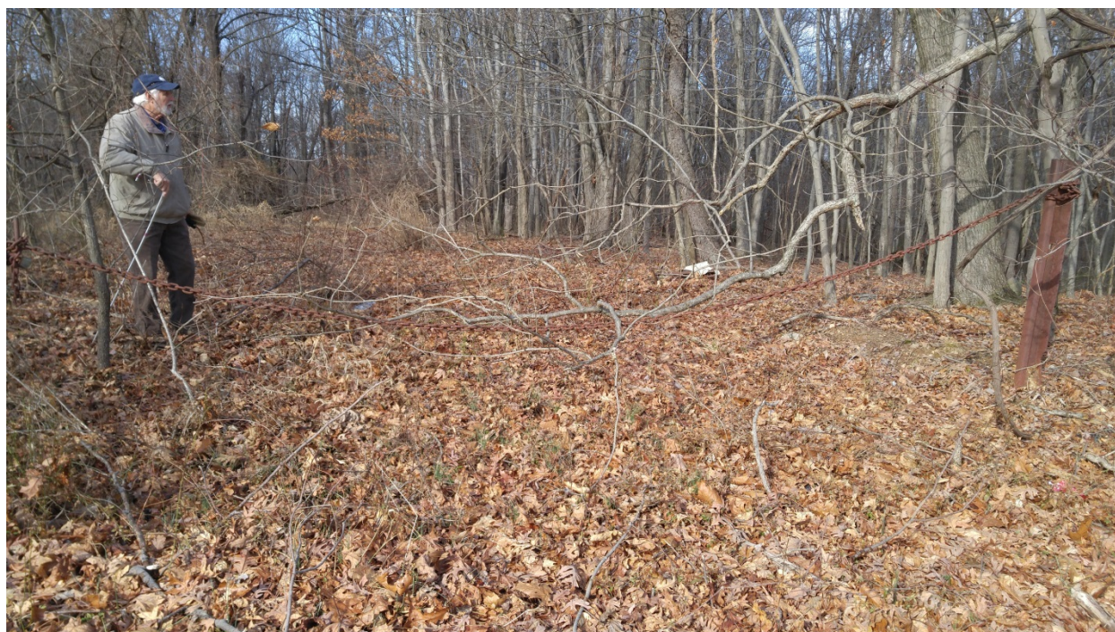
1. From Batson Road, facing north