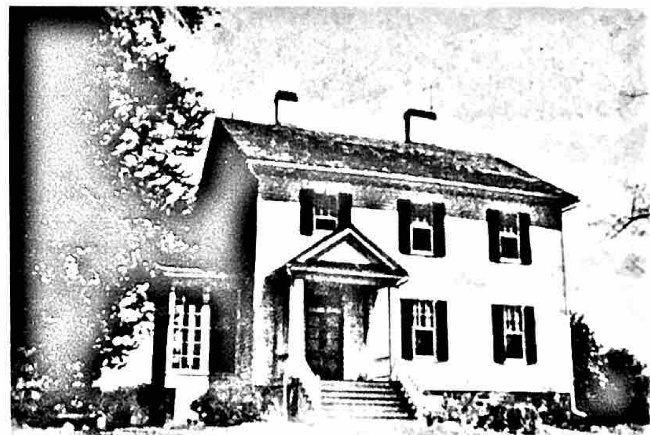
NO. 81 D-9 WASHINGTON B. CHICHESTER 1875 FRAME

He was able to pay off all his debts. In addition to some other lands, he bought 2,000 acres of about the best land in the County. Settling