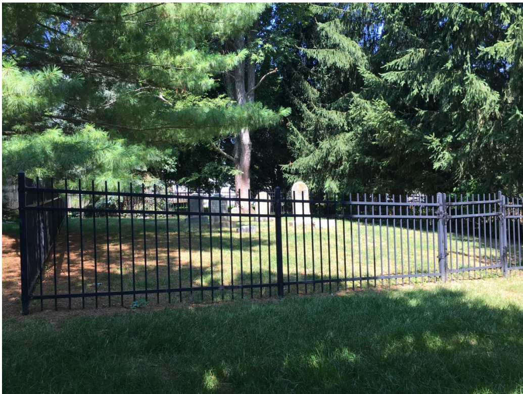
3. View from bench toward cemetery, facing northwest