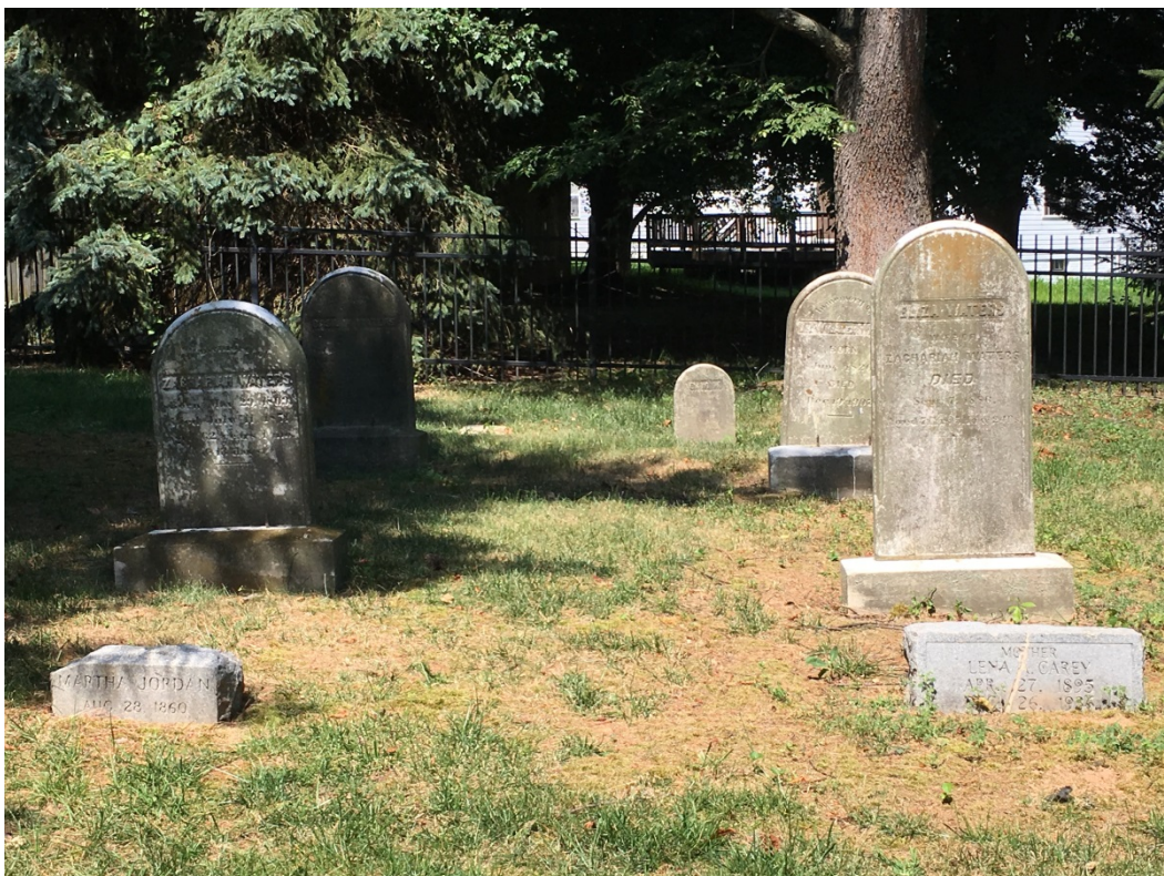
5. Center of cemetery, facing west