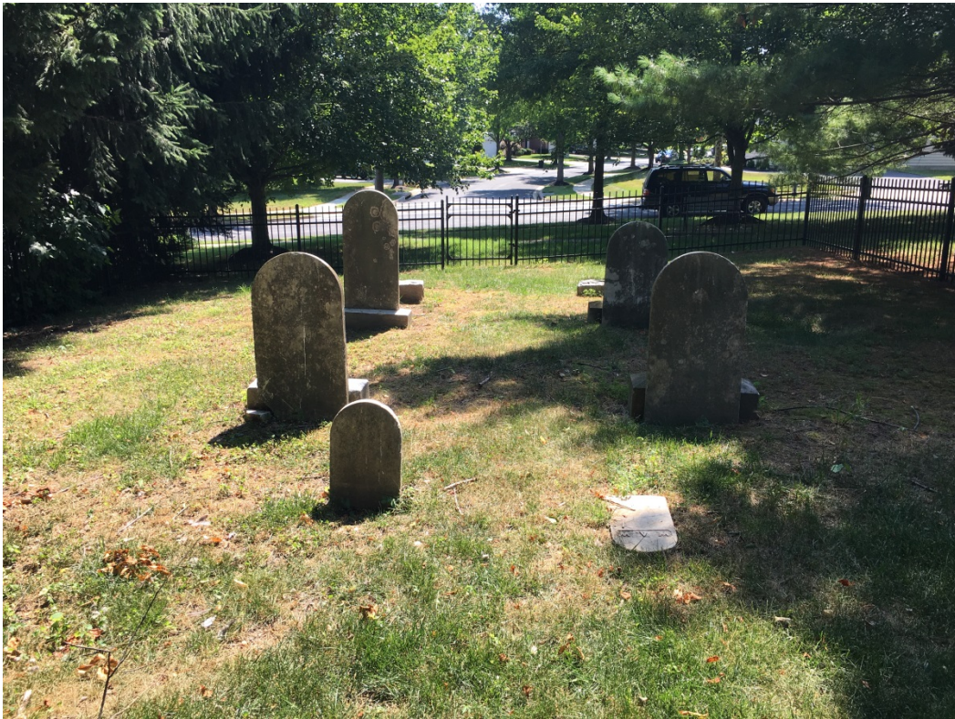
6. Center of cemetery, facing east