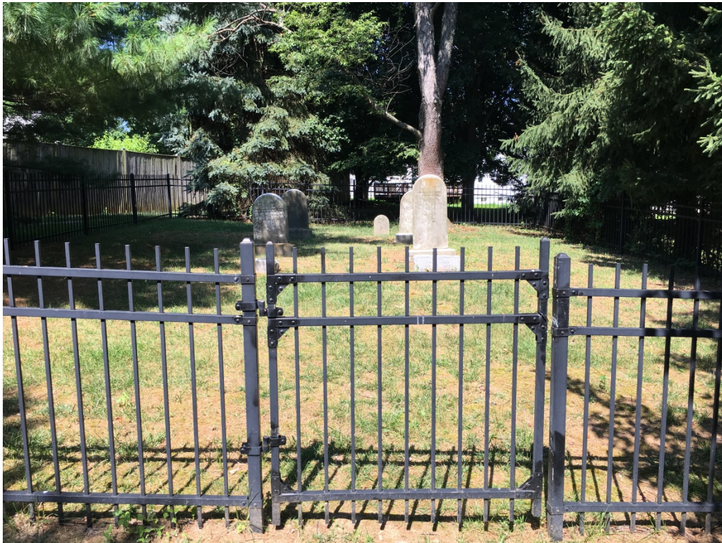
4. Entrance gate of metal fenced enclosure, facing west