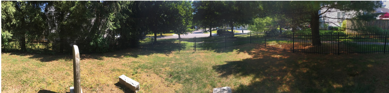
7. Panoramic from north to east to south