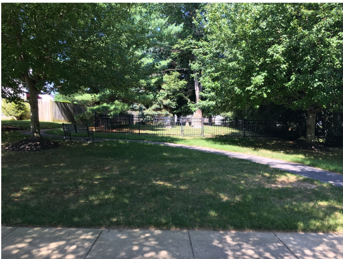
1. View to cemetery from Hawks Nest Lane, facing west