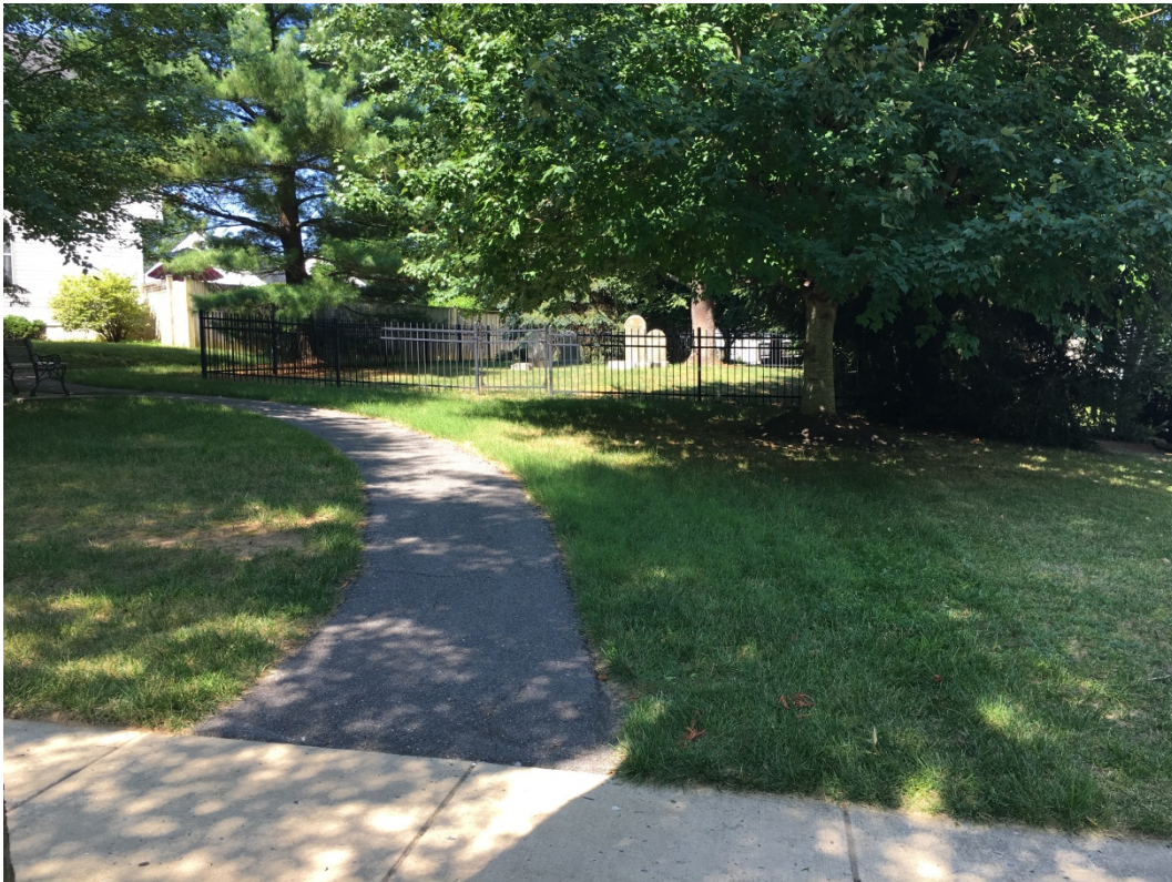
2. Approach to cemetery along paved pathway, facing west