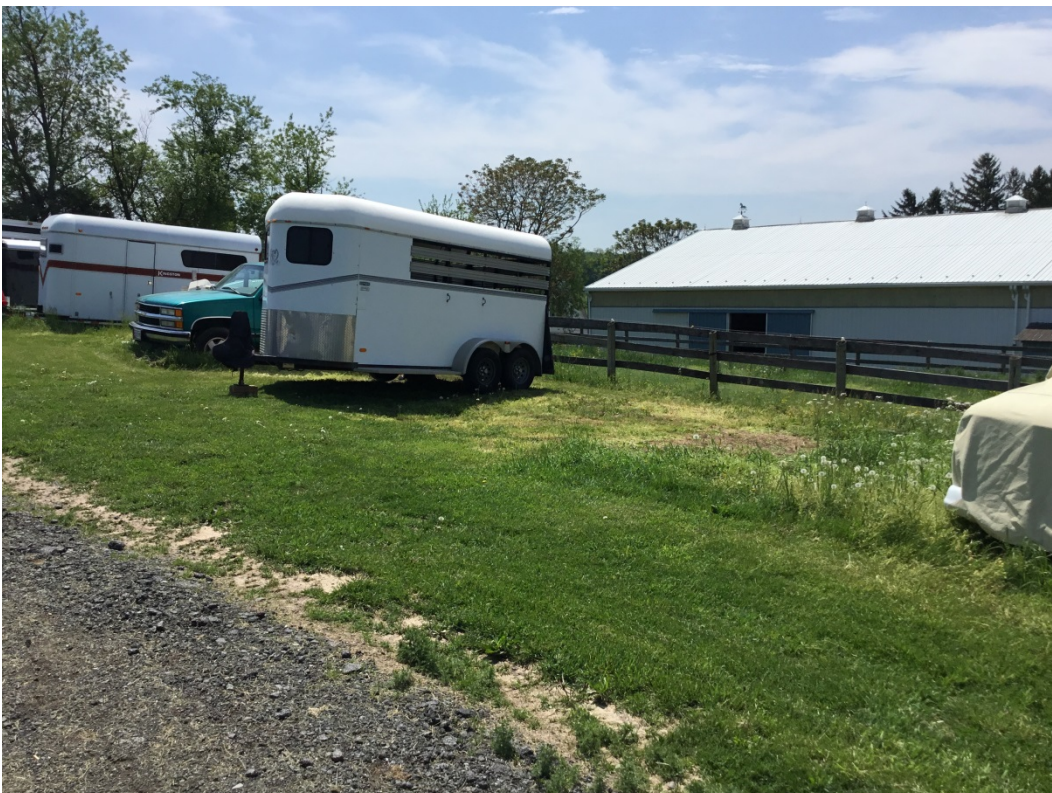
3. View of presumed burial area under trailers, facing south