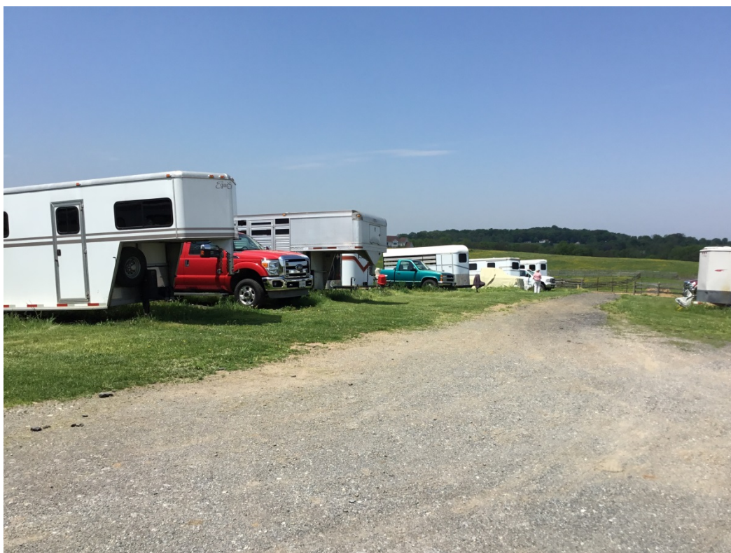
4. View toward presumed burial area under trailers, facing west