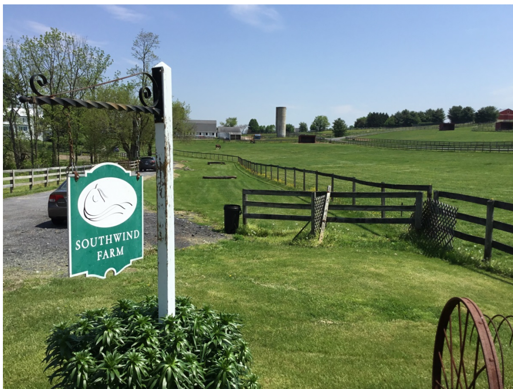
1. Southwind Farm entrance from Bethesda Church Road, facing north