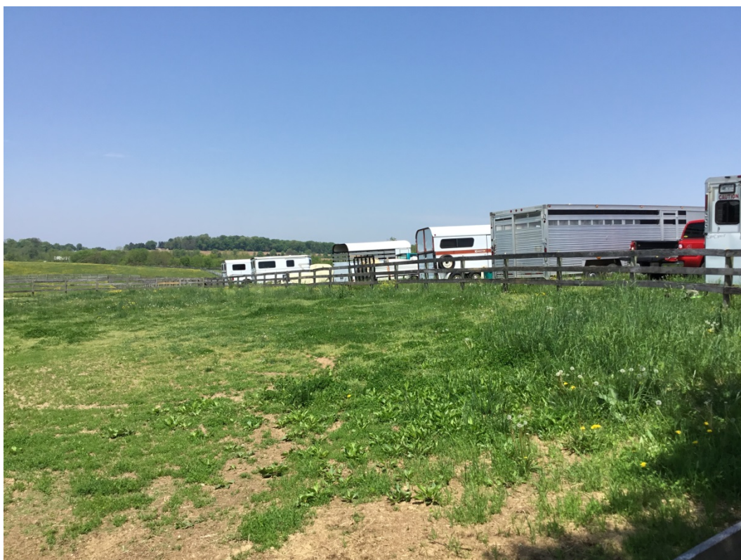
5. View across paddock to presumed burial area under trailers, facing north-west