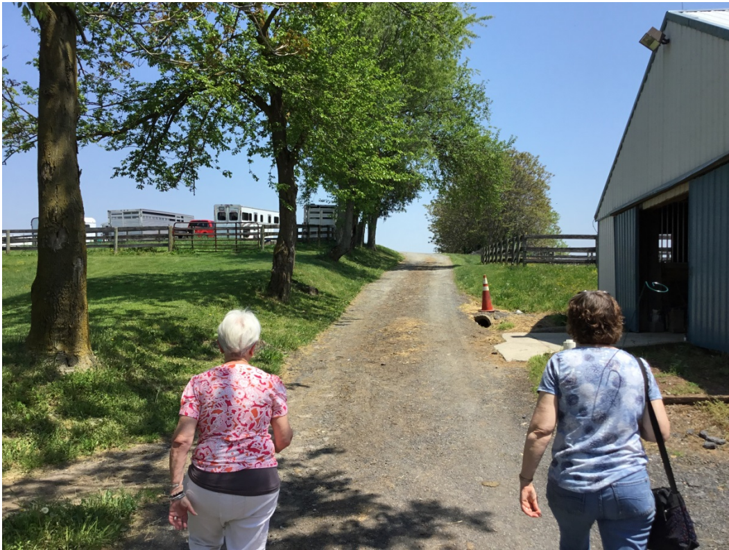
2. Climbing hill between arena and stable toward burial ground, facing north