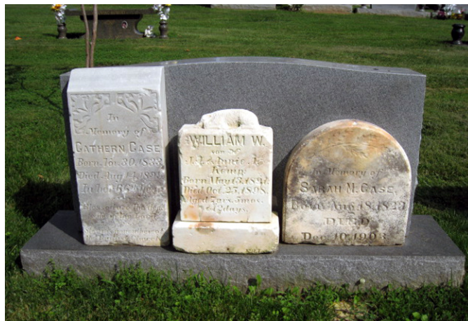
Grave markers located at Parklawn Memorial Park in Rockville.