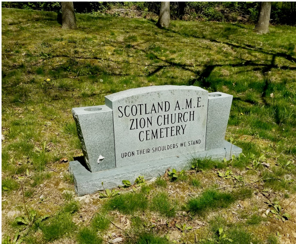
3. Cemetery sign, facing east