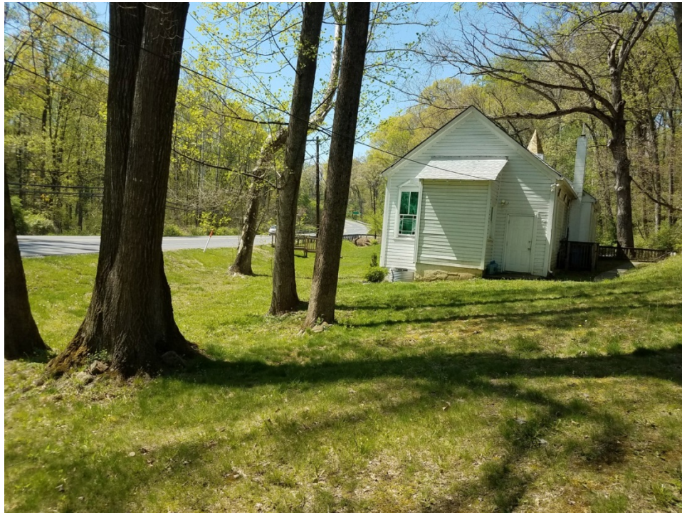
11. View to back of church building, facing south