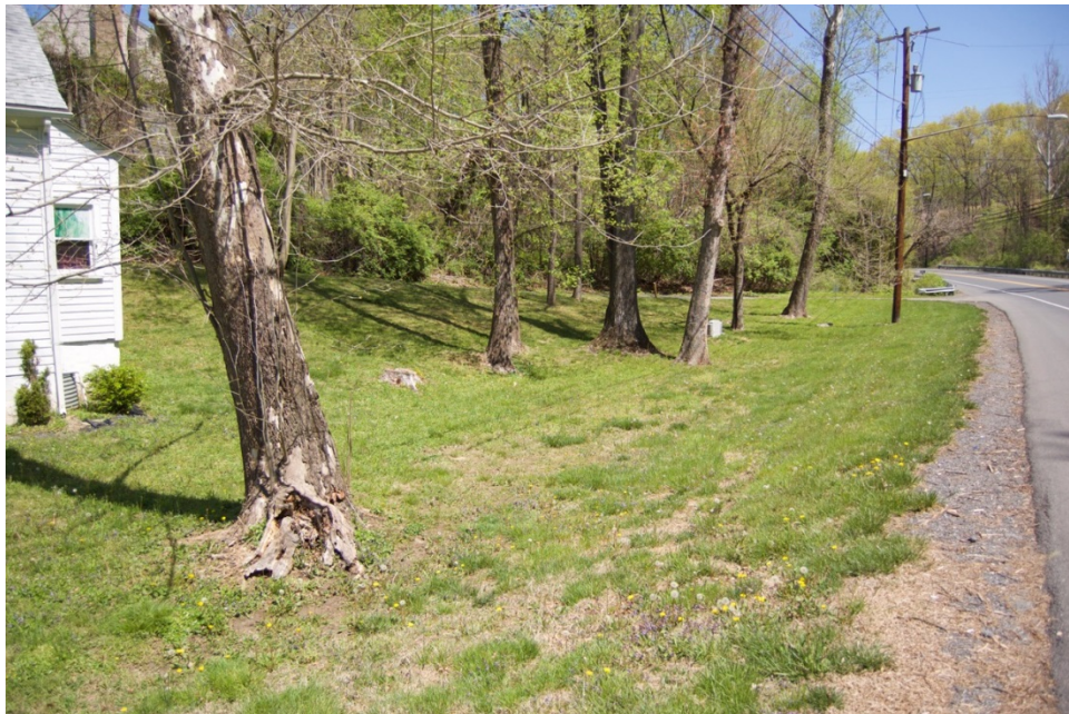
6. View toward cemetery from Seven Locks Road, facing north