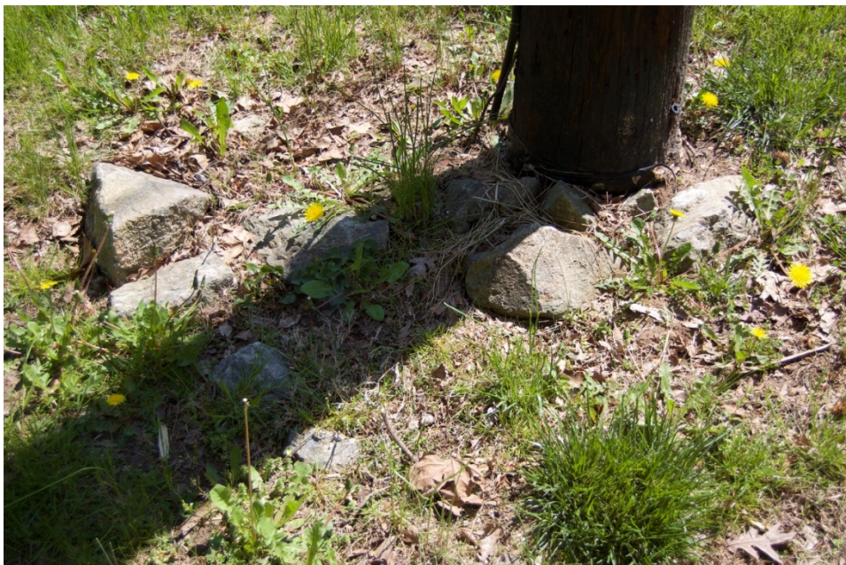
10. Piled stones at telephone pole