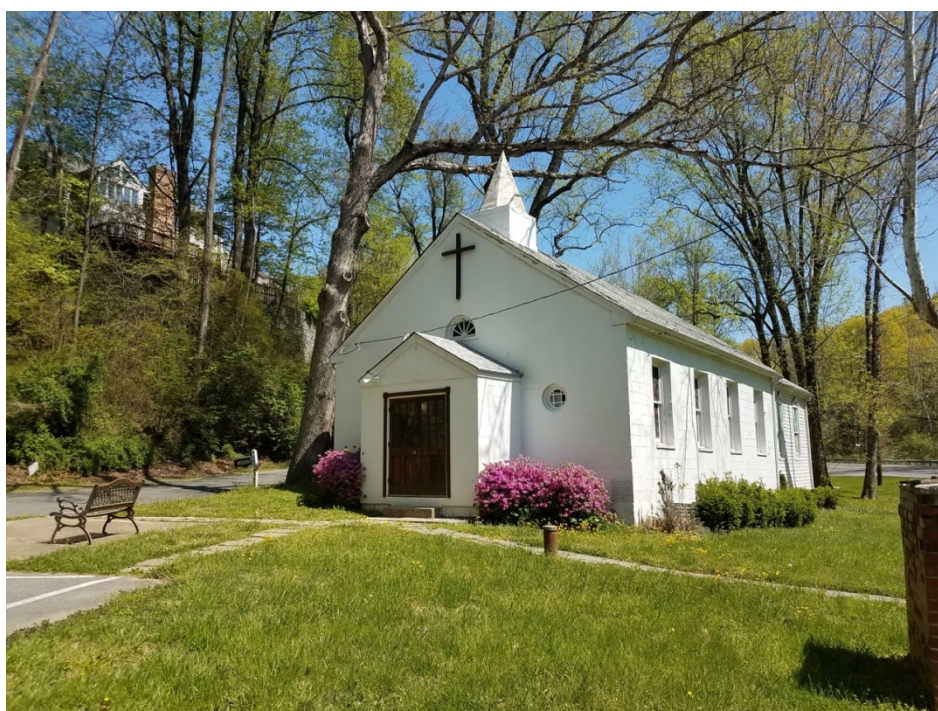
1. Church building, facing north