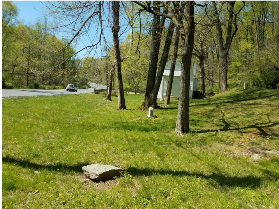
7. View from cemetery, facing south