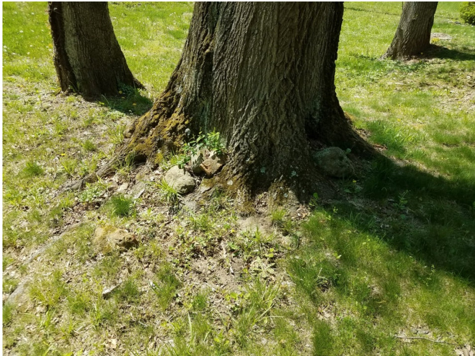
9. Field stones stacked around tree