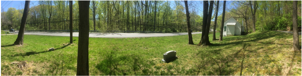
4. Panoramic from north to east to south