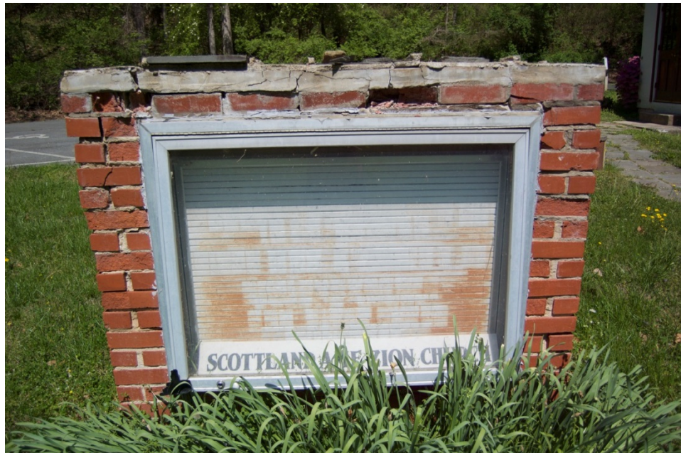
2. Original church sign