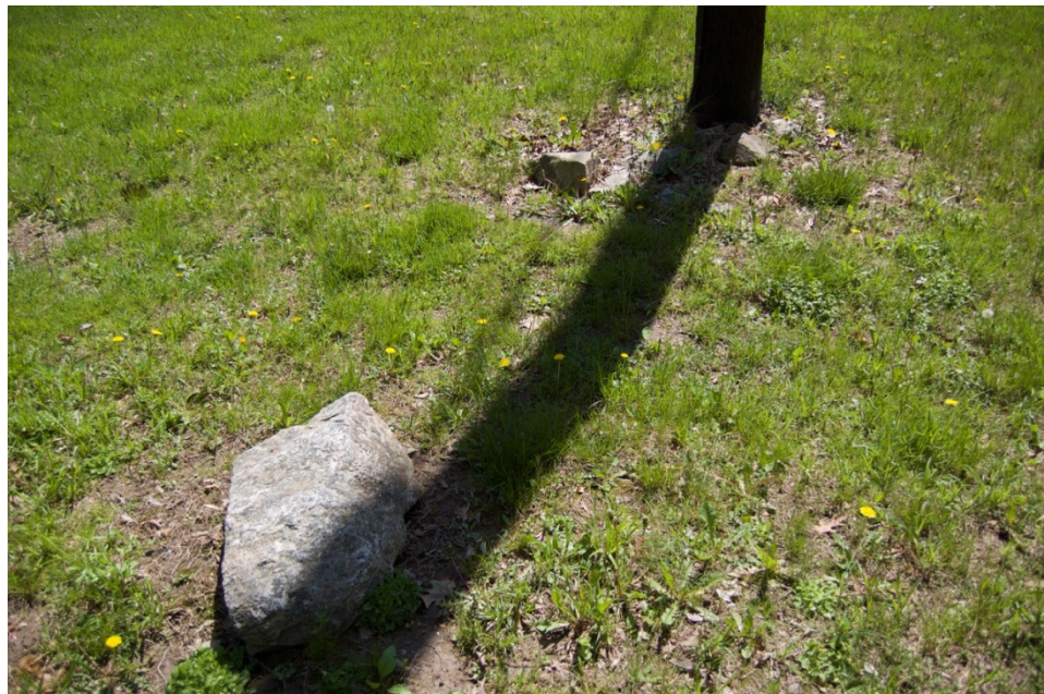
8. Field stone and piled stones at telephone pole