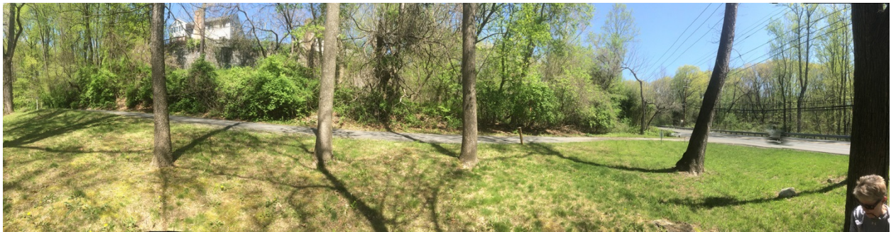
5. Panoramic from west to north to east