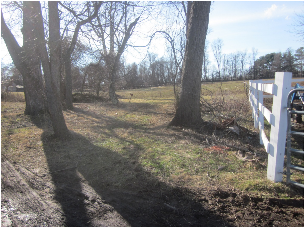
4. Cemetery facing southwest