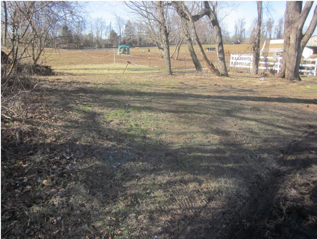
2. Cemetery facing northwest