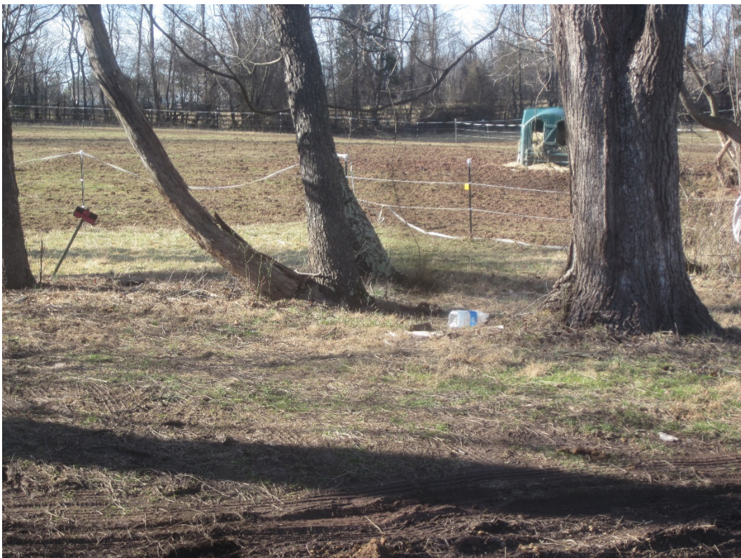
3. Detail of possible burial area, facing northwest