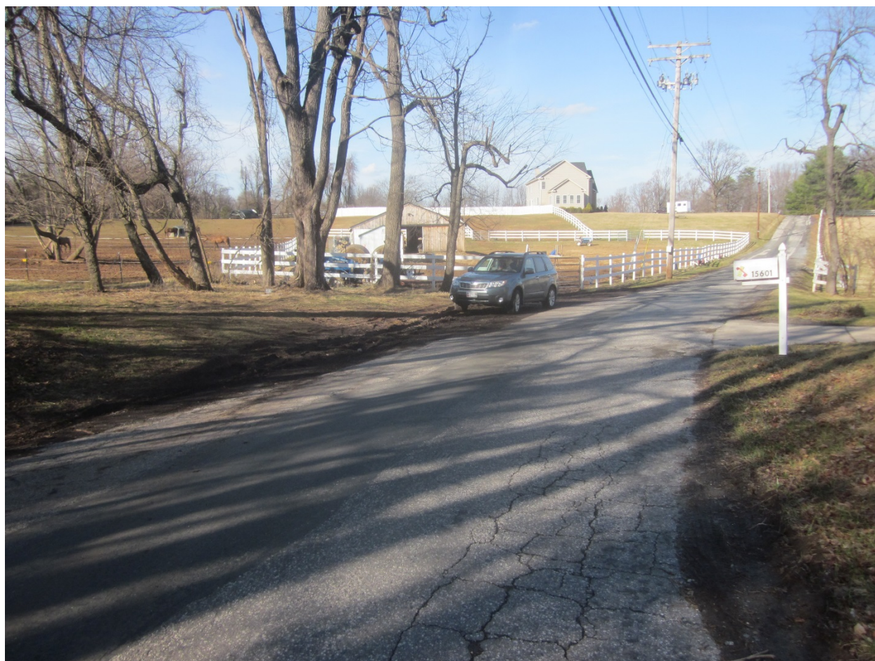
1. Cemetery on left of Kruhm Road, facing north