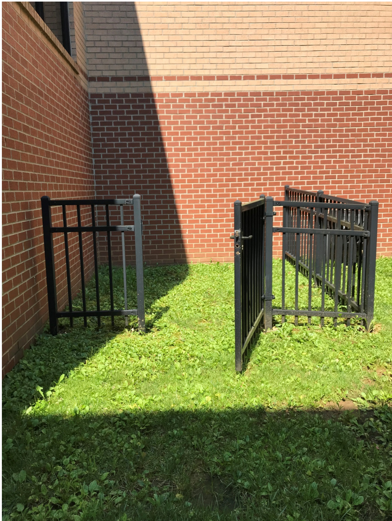
2. Gated fenced enclosure where the two skulls were buried.