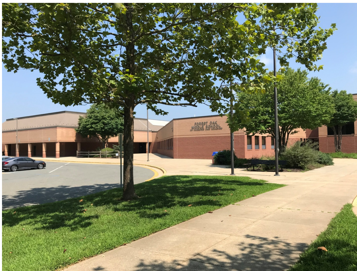
1. Approach to school