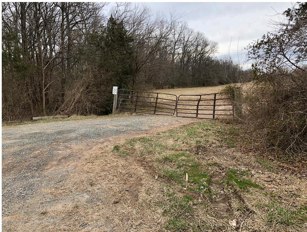
271_1. River Road access point (gate) to farmer's field, facing south