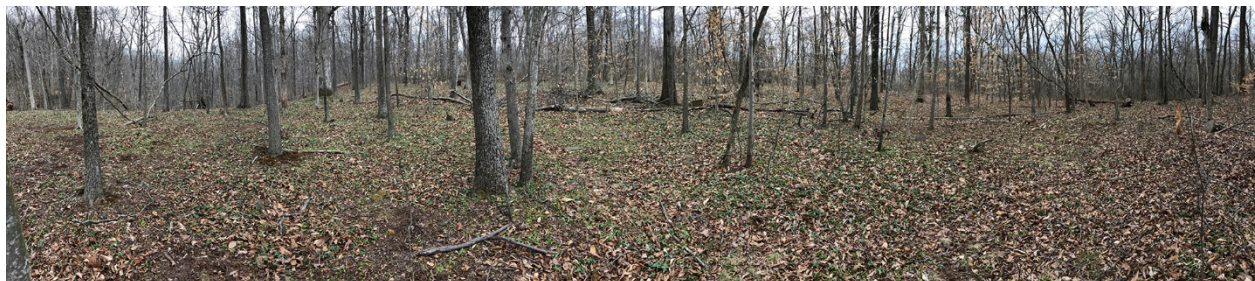
271_31. Panoramic from north to east to south