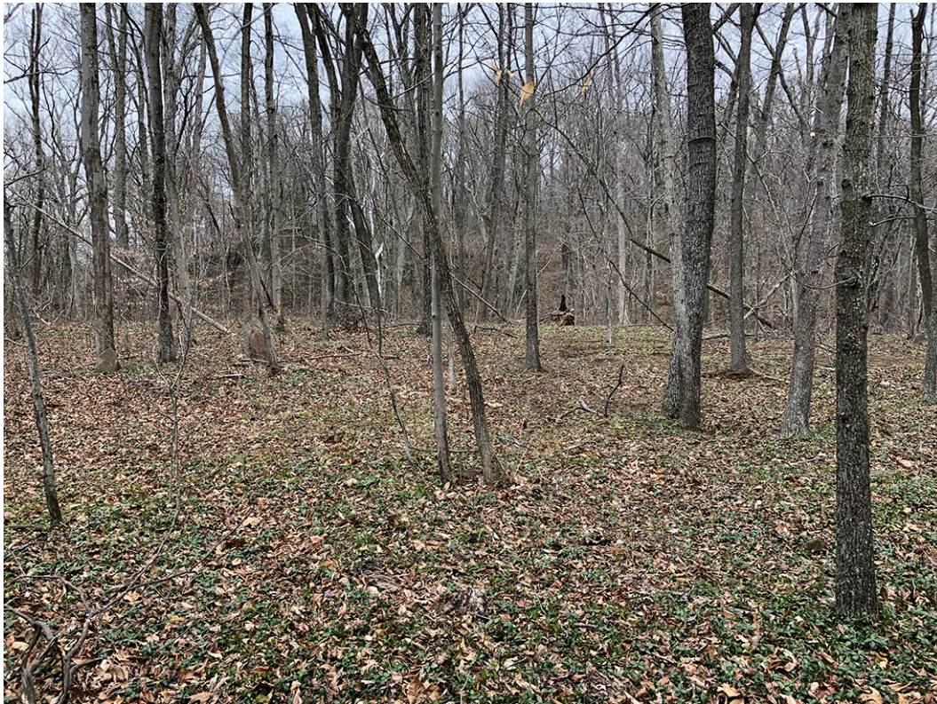
271_7. Initial approach to cemetery