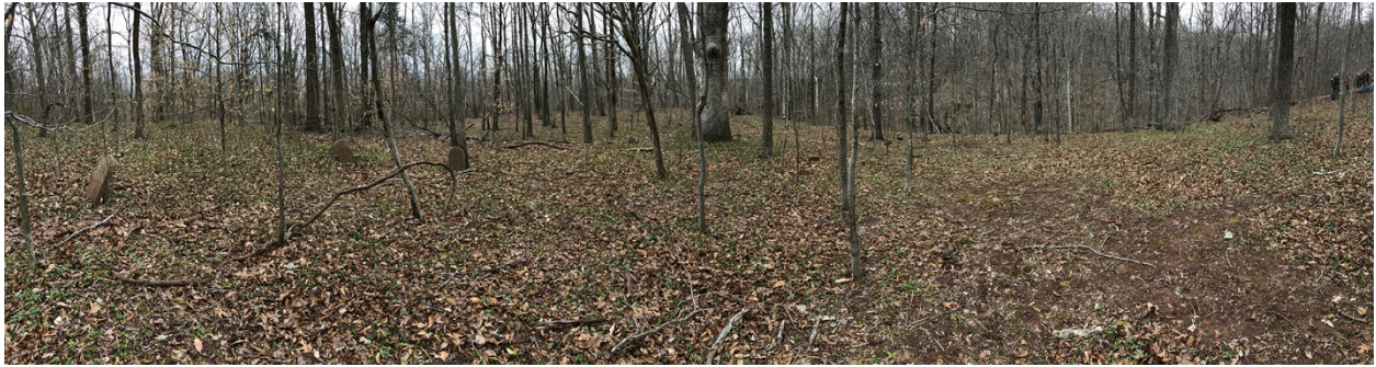
271_32. Panoramic from south to west to north