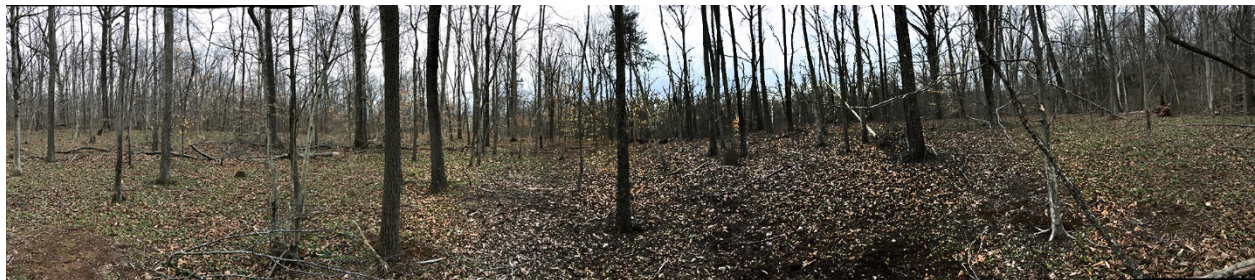
271_30. Panoramic from east to south to west, Jack Clipper grave at center