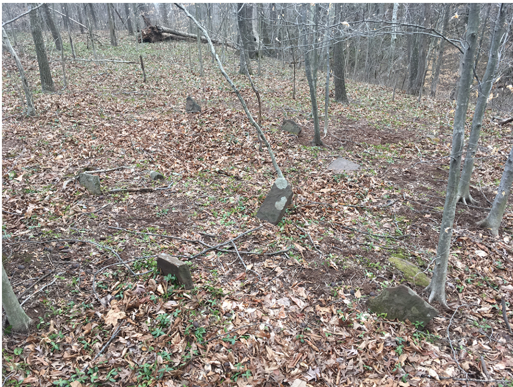
271_39. View of other burial locations with markers