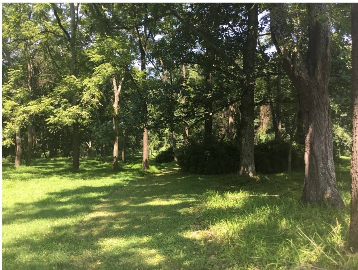
1. Approach to burial area, facing west