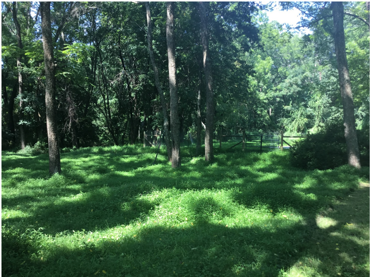
2. Center of burial area to the south of the fenced pool, facing northwest