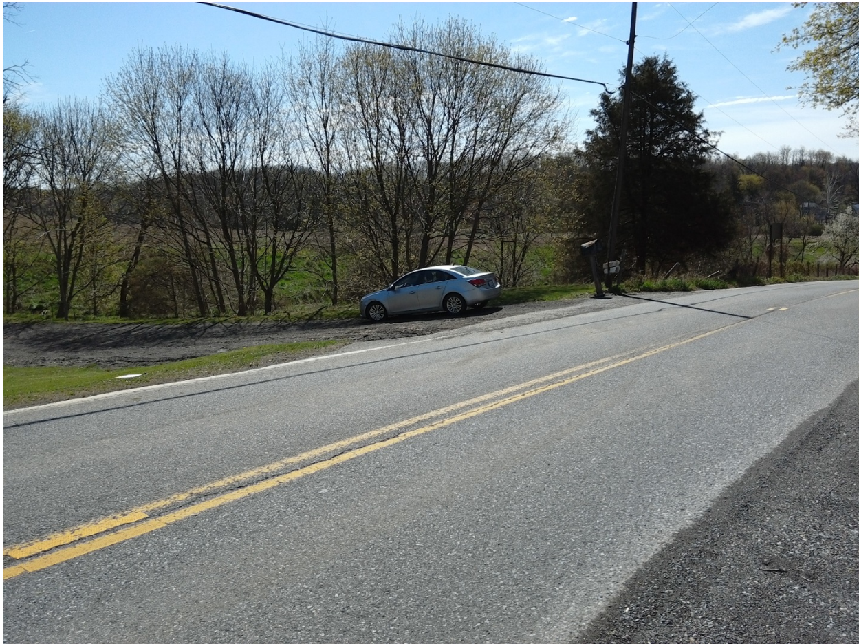
1. Entry from Bethesda Church Road, facing east