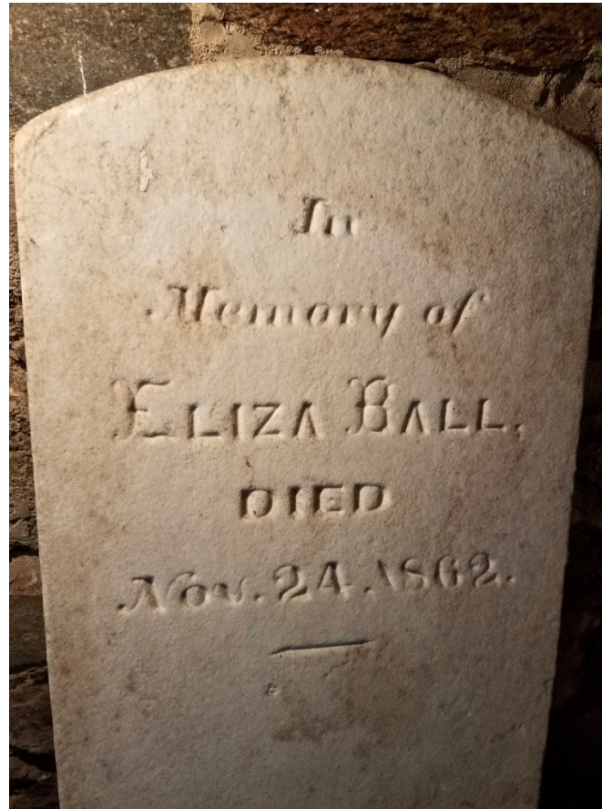
2. Eliza Ball grave marker and base