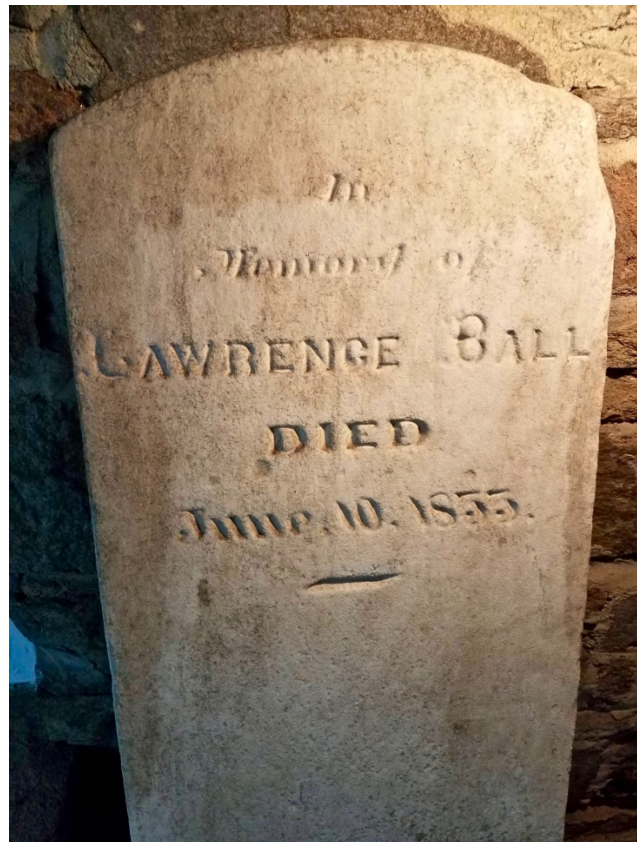
1. Lawrence Ball grave marker and base