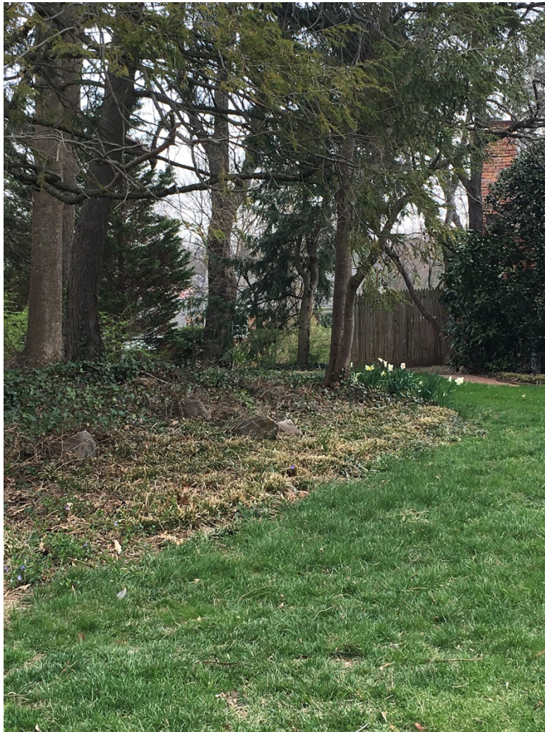
5. Field stones along Pollard Road. Possibly former grave markers?