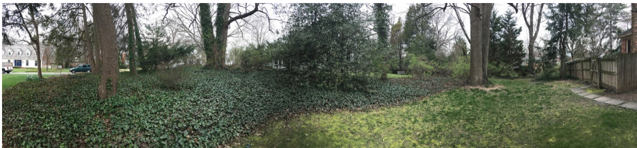
3. Panoramic from south to west to north