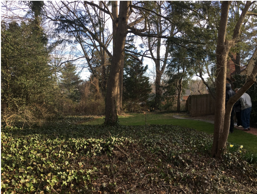
2. Center of cemetery, facing north