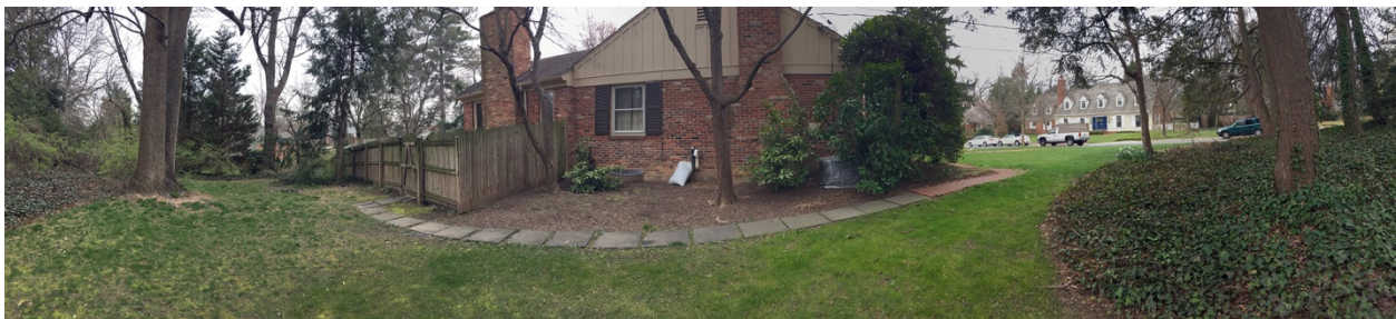
4. Panoramic from north to east to south