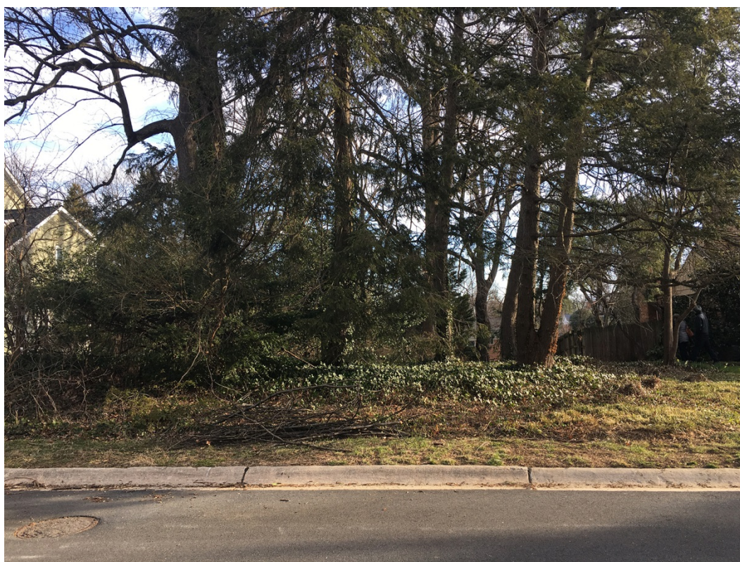
1. Approach to cemetery, facing north