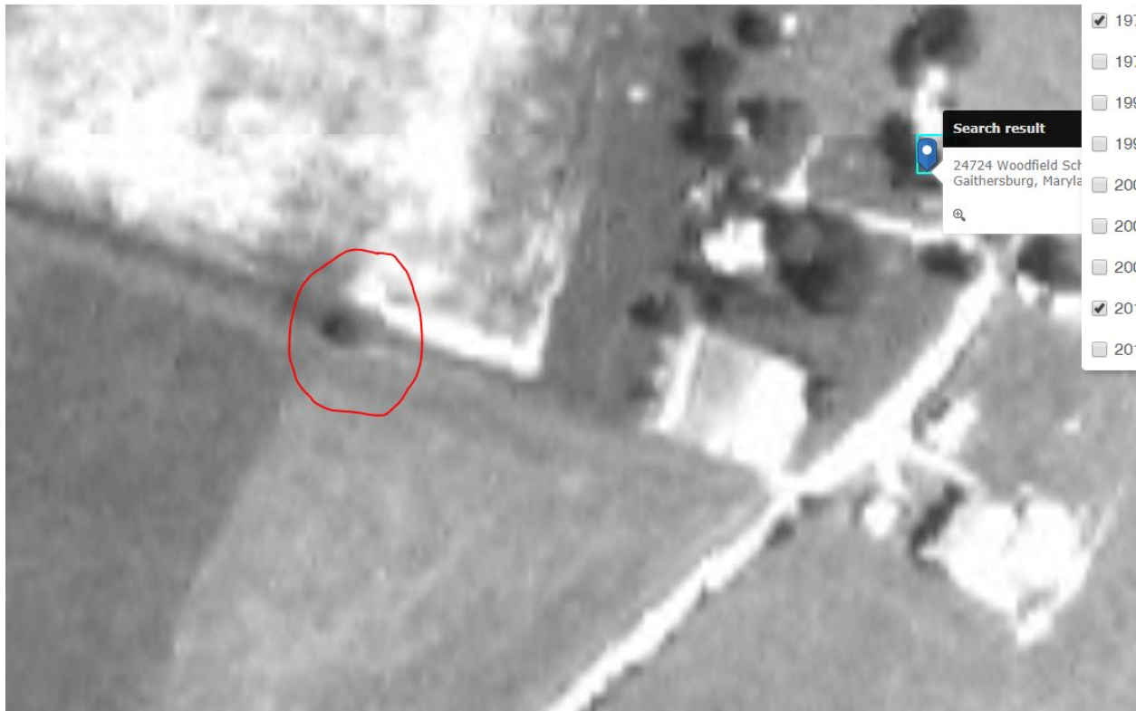
1971 Aerial Photograph. Site circled in red.