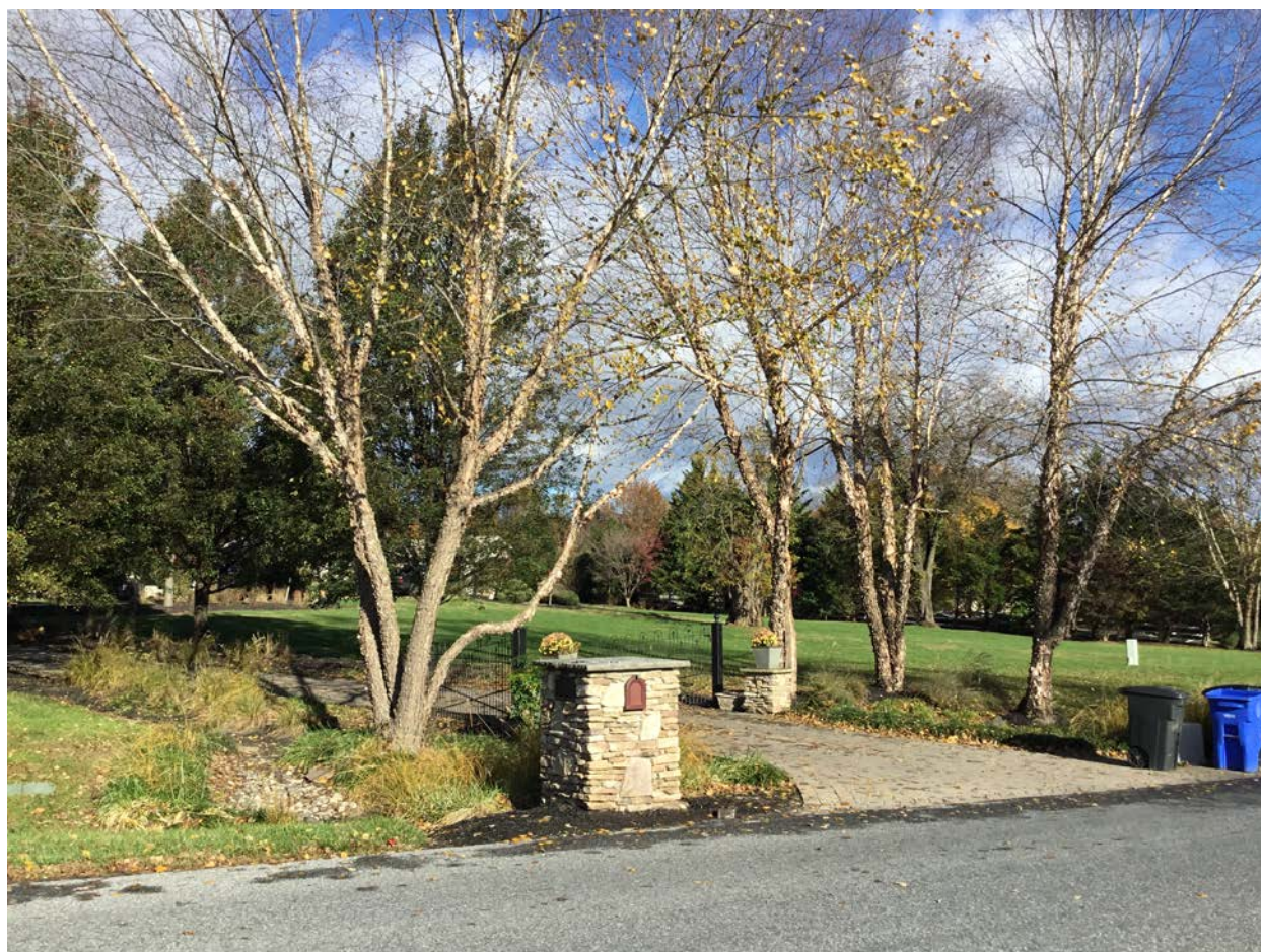
1. Residential address at 24724 Woodfield School Rd., facing west