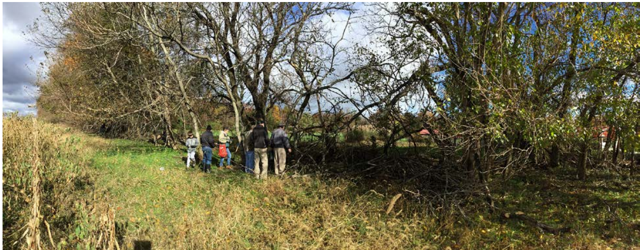
4. Panoramic from west to north to east