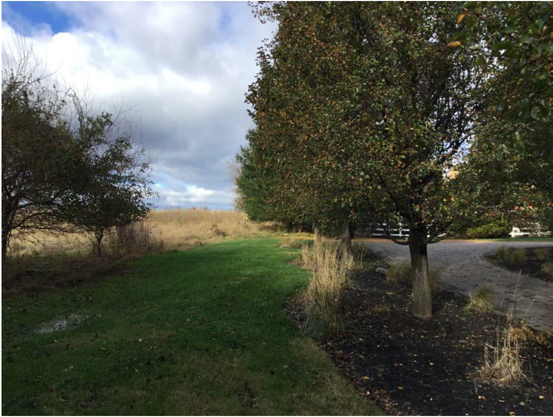
2. Approach to cemetery along southern property line, facing west