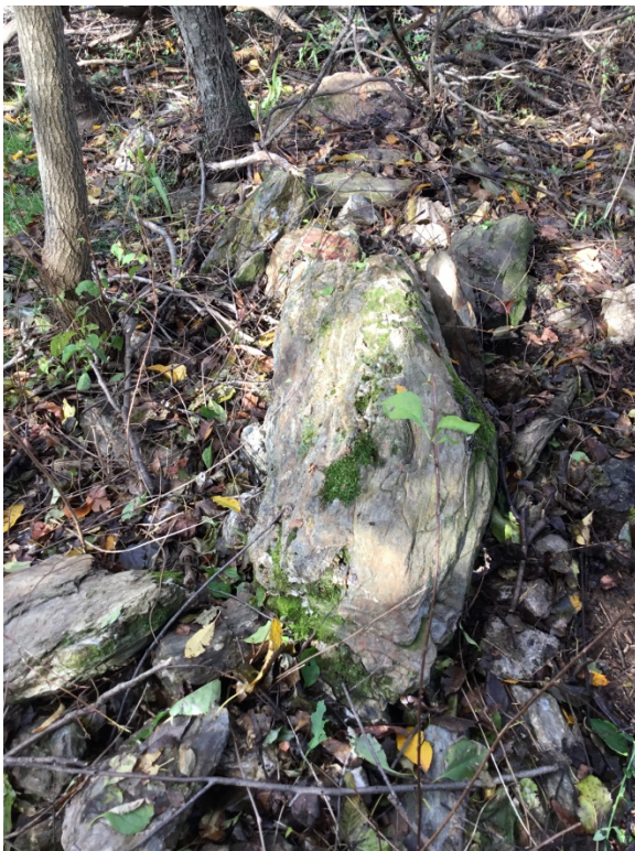
5. Large boulder surrounded by smaller stones