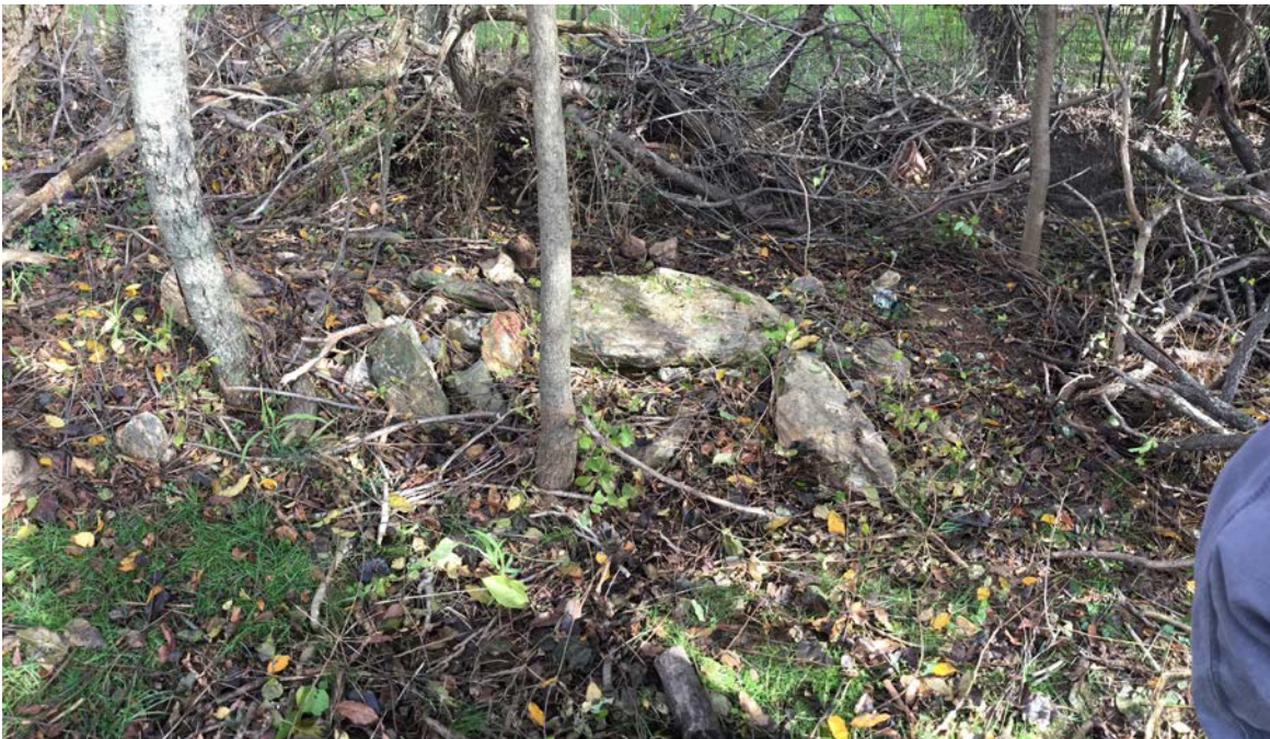
3. Pile of fieldstones marking the burial sites