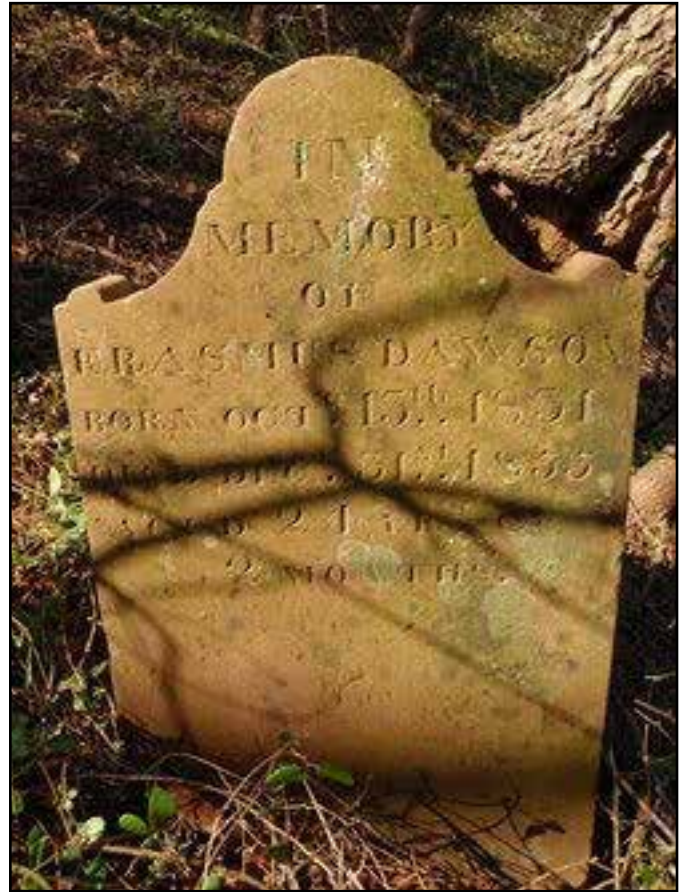
Erasmus Dawson B. Oct 15th 1831, D. Dec 31st 1855 Aged 24 years, 2 months