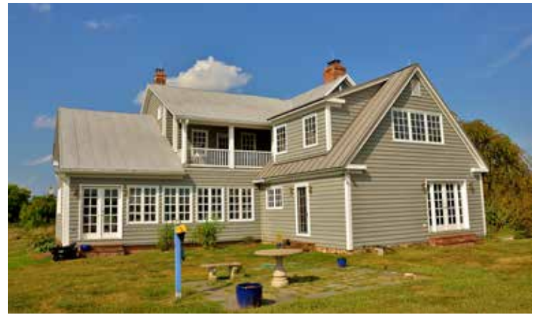
about 2003 (all barns and out-buildings removed)