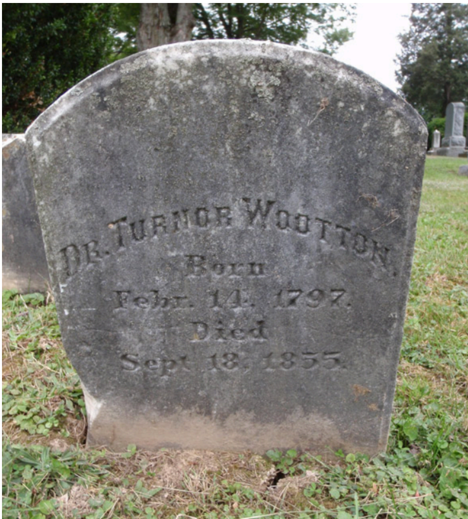
Photograph: Monocacy Cemetery, Beallsville, MD, relocated from the Wootton Family Cemetery, Rockville, MD