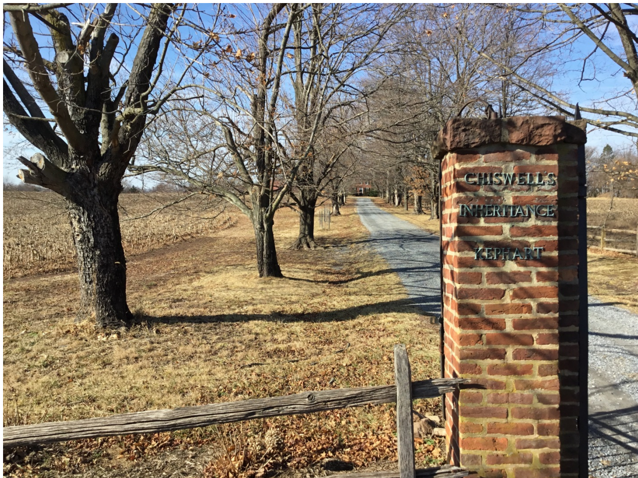
1. Entrance gate to Chiswell's Inheritance