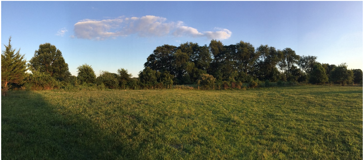
2. Fence line where family members were supposedly buried