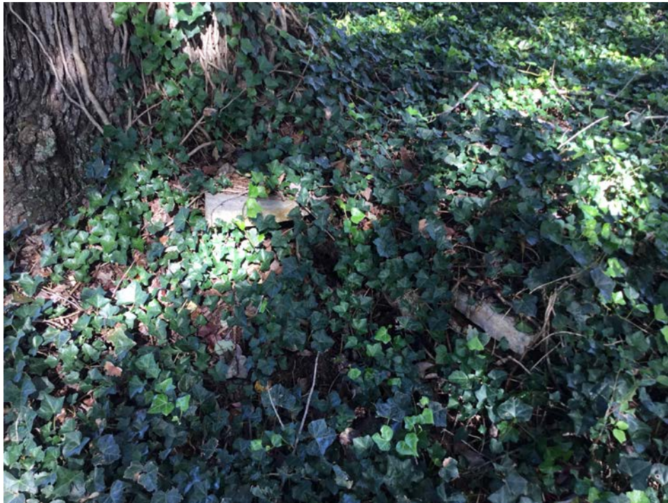
6. Broken grave markers covered in creeping ivy