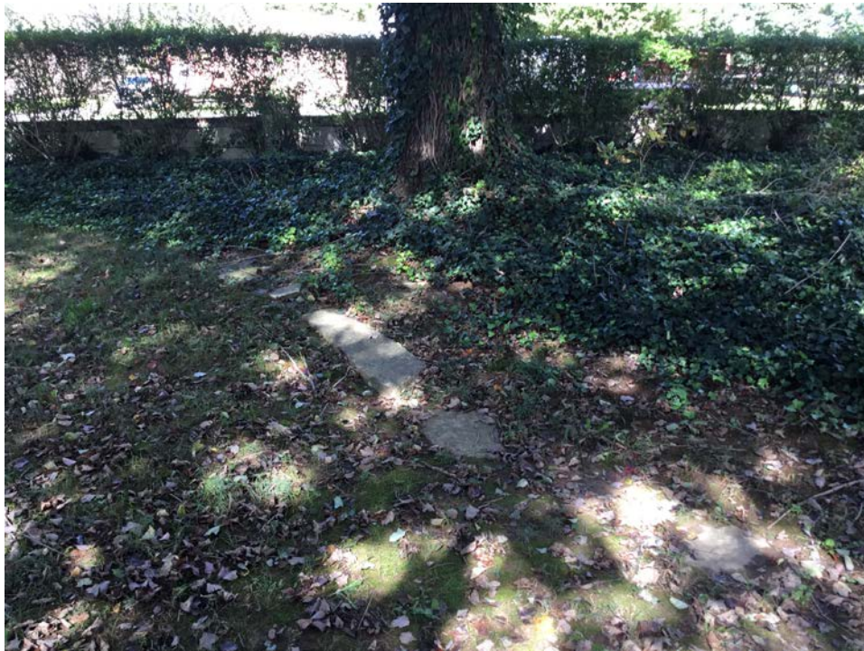
2. View of cemetery, facing north