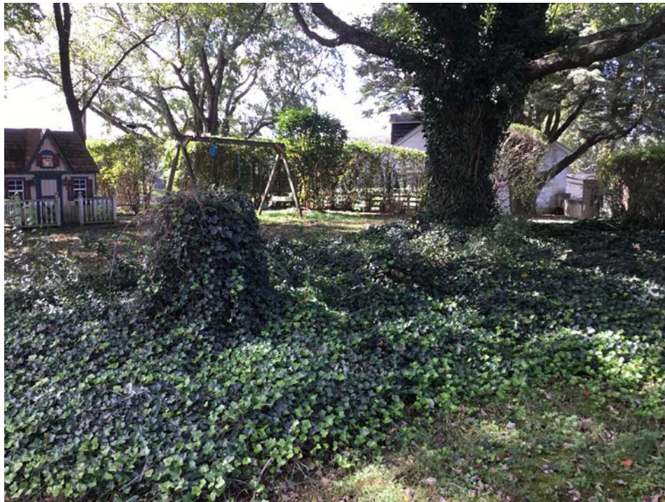
4. View of cemetery, facing west