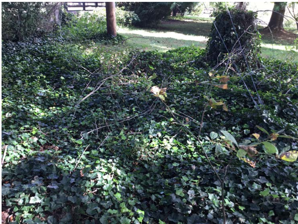
3. View of cemetery, facing northeast