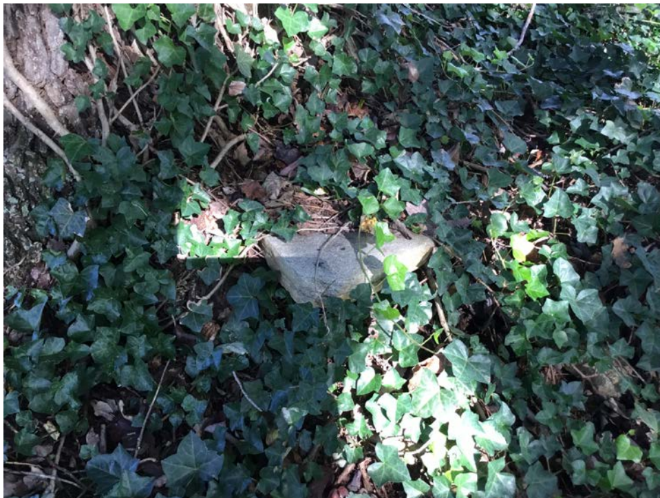
5. Broken grave markers covered in creeping ivy