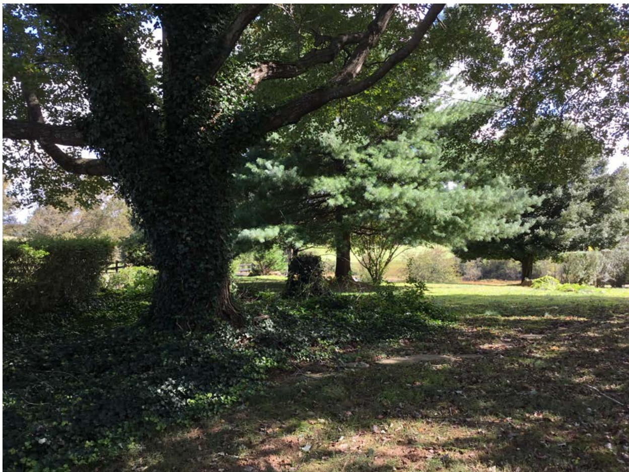
1. Initial view of cemetery from driveway, facing east