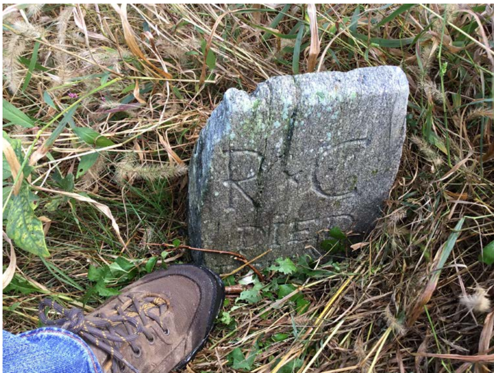
8. Grave marker with "R C"