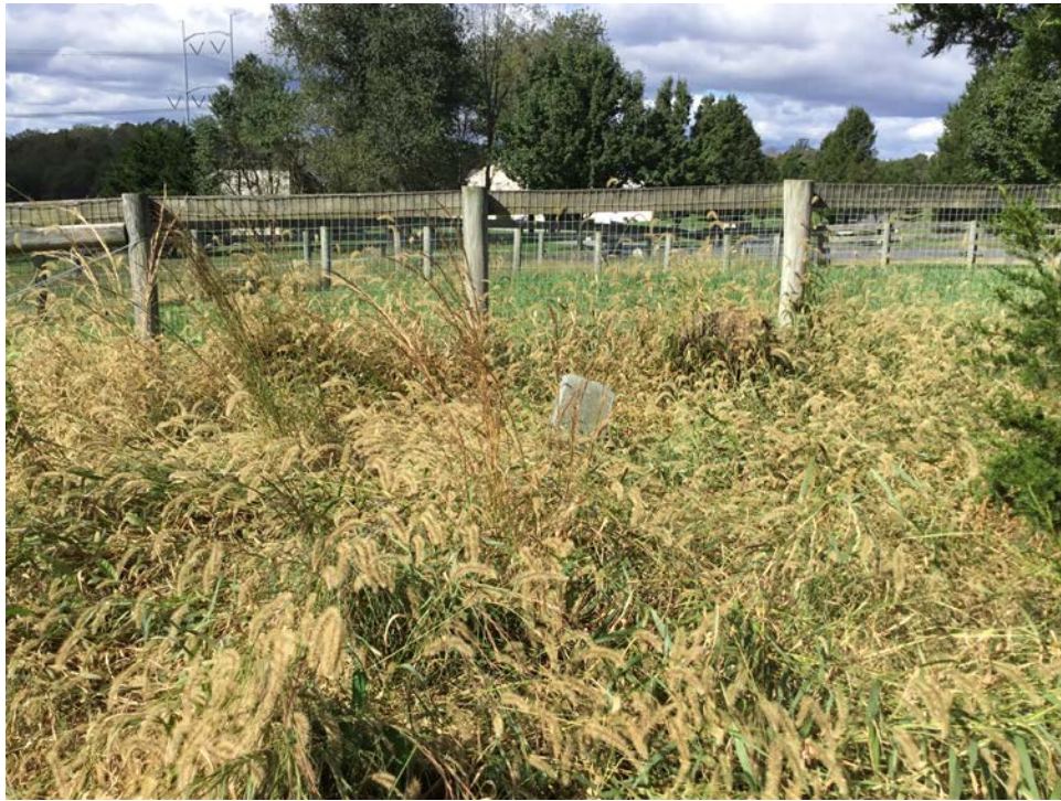
4. Overgrowth of wheat grass and grave marker