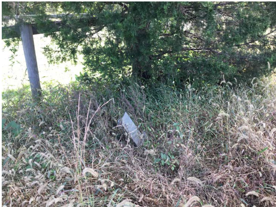
5. Unmarked grave marker under cedar tree, facing southeast