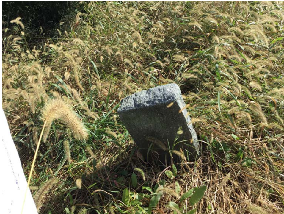
7. Unmarked grave marker at southern end of cemetery