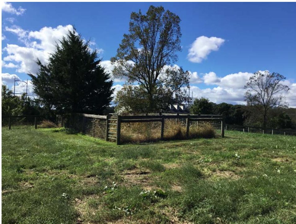
3. Approach to cemetery, facing south