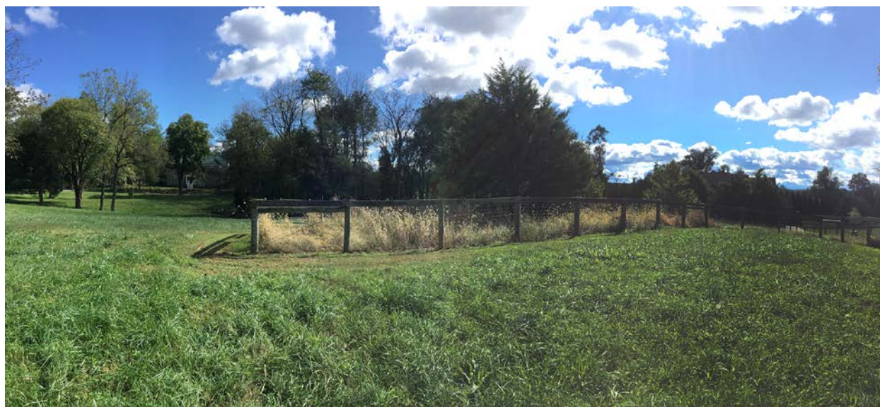
1. Initial view of cemetery from driveway, facing east