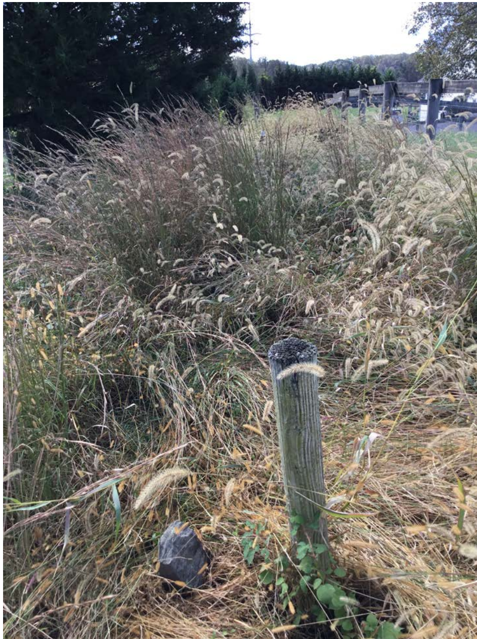
6. Unmarked grave next to random wooden post, facing south