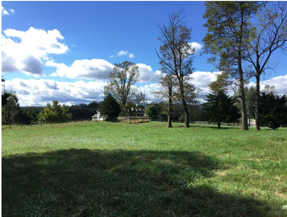
2. Initial view from pasture entrance next to barn, facing south