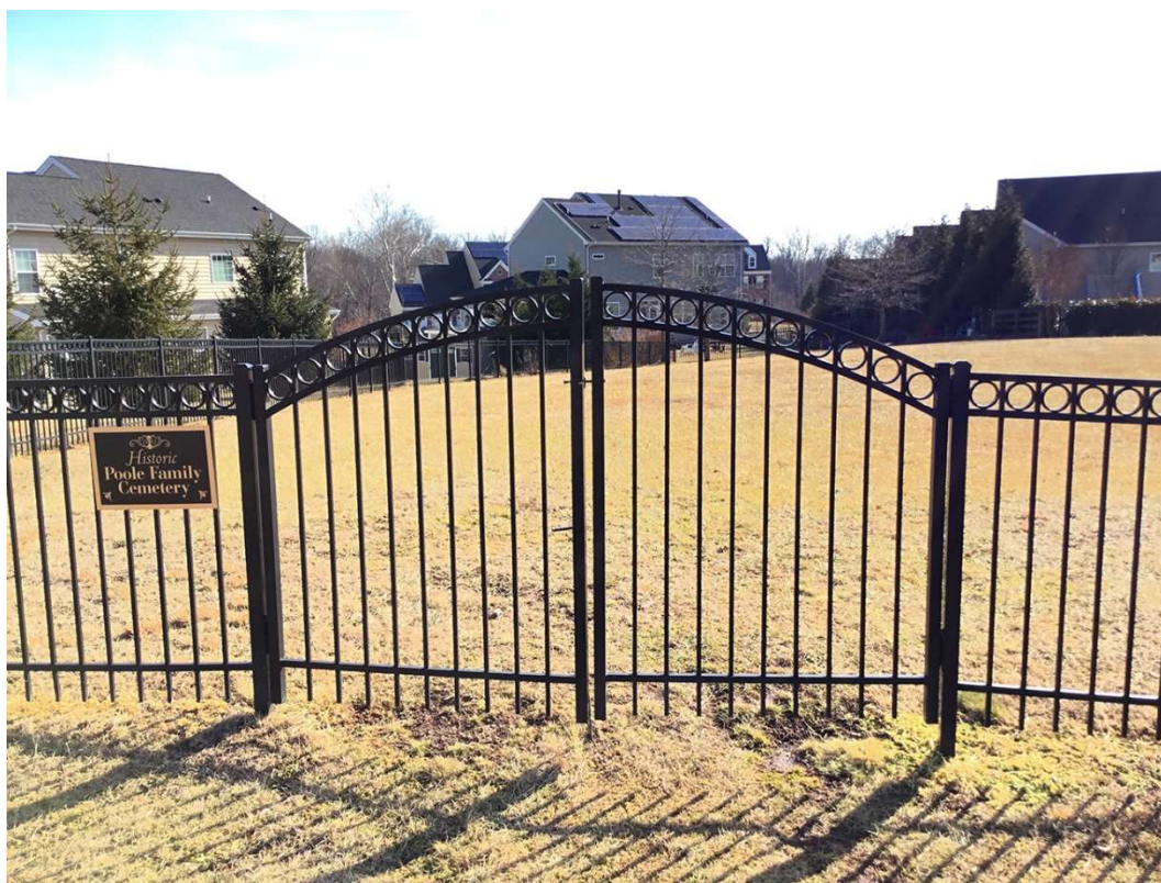
2. Entrance gate with sign, facing south