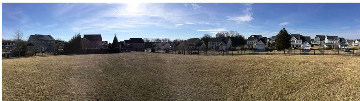
4. Panoramic from east to south to west