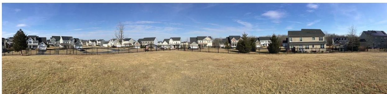
3. Panoramic from west to north to east