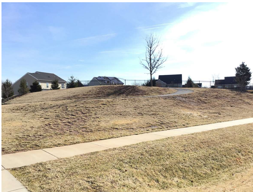
1. Photo from corner of Bliss Drive and Dr. Walling Road, facing south