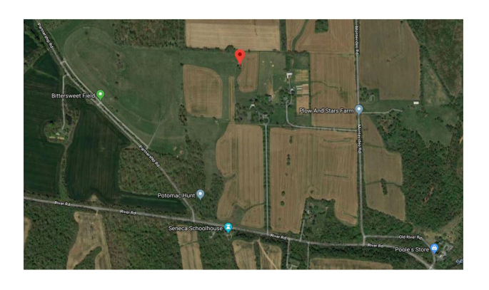
HP-021-002 Aerial Map

Date 08/06/2018