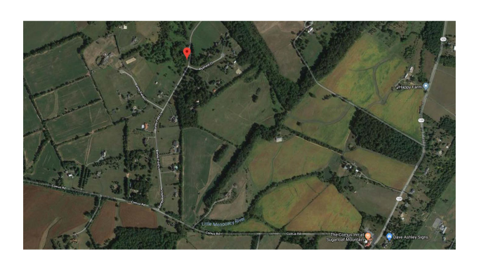
HP-022-002 Aerial Map