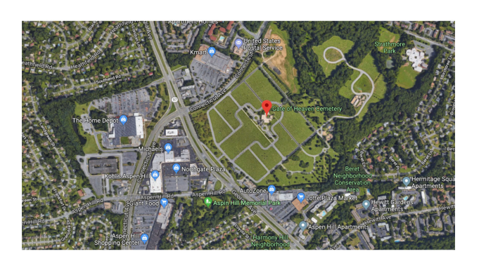
HP-086-002 Aerial Map

Date 08/22/2018