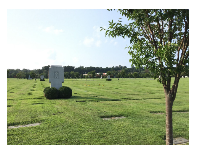
HP-086-009 Sculptural pylons designating sections

Date 08/22/2018