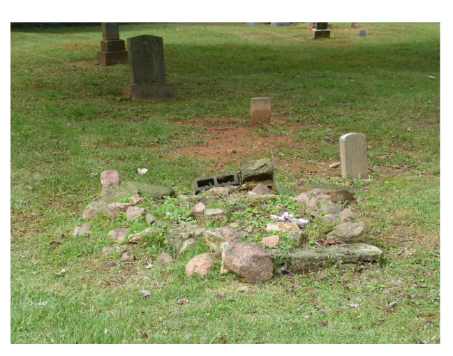
HP-088-012 Collapsed box tomb, facing west

Date 09/28/2018