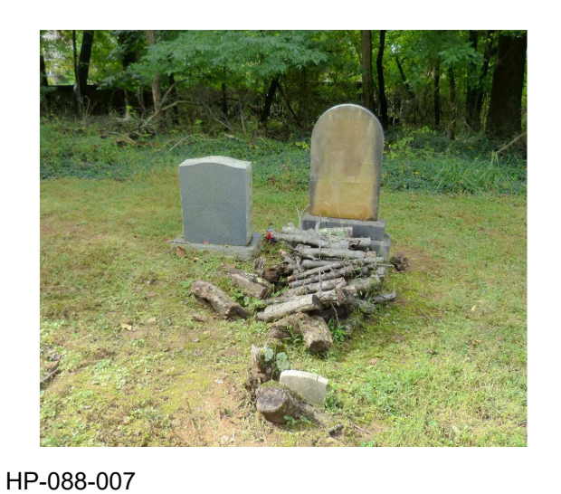
Wood pile stacked on grave, facing southwest

Date 09/28/2018