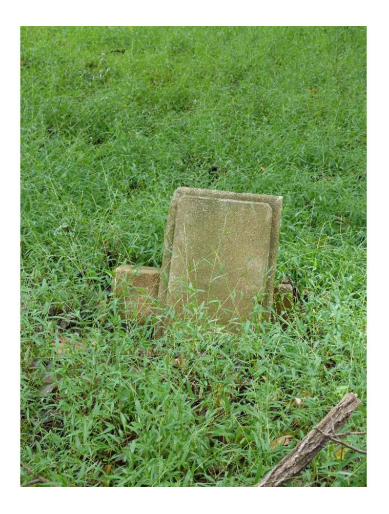
HP-088-011 Unidentified cement marker

Date 09/28/2018