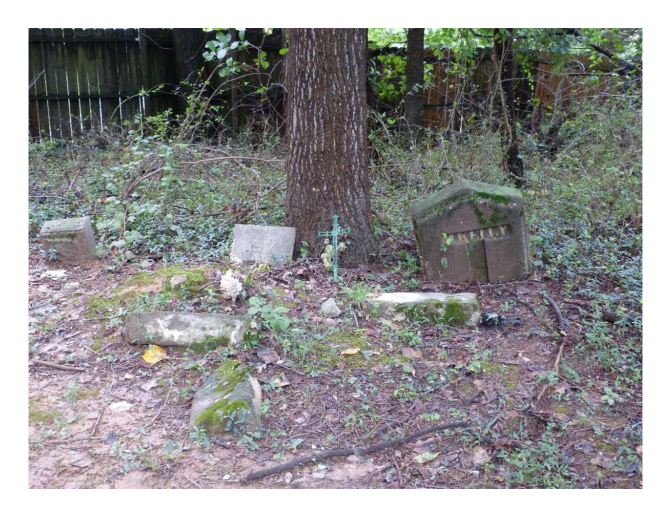
HP-088-009 Southeast area along fence, facing south

Date 09/28/2018