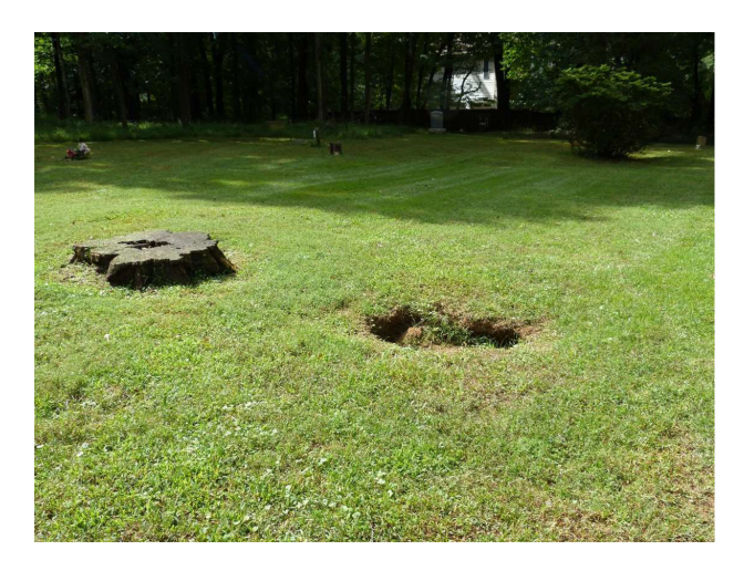
HP-088-013 Collapsed sinkhole near tree stump

Date 09/28/2018