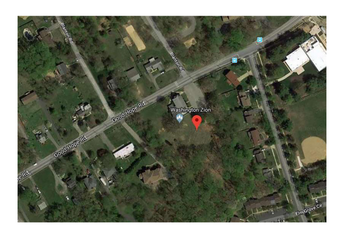
HP-088-002 Aerial Map

Date 09/28/2018