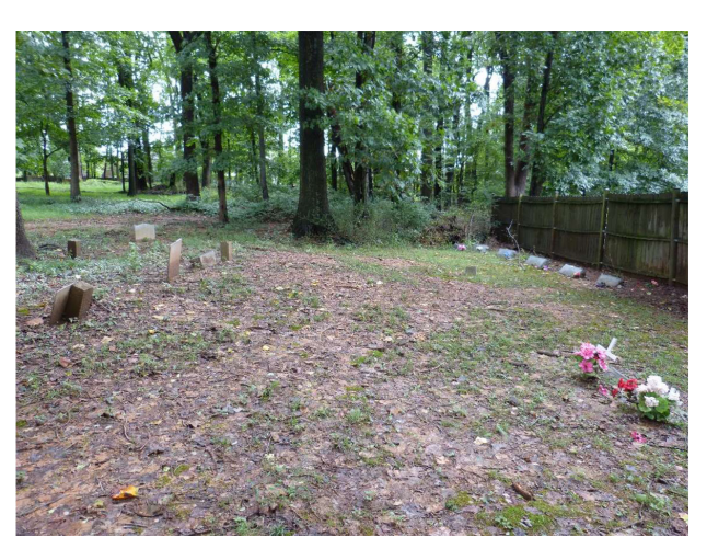
HP-088-010 Unmaintained area, facing northeast

Date 09/28/2018